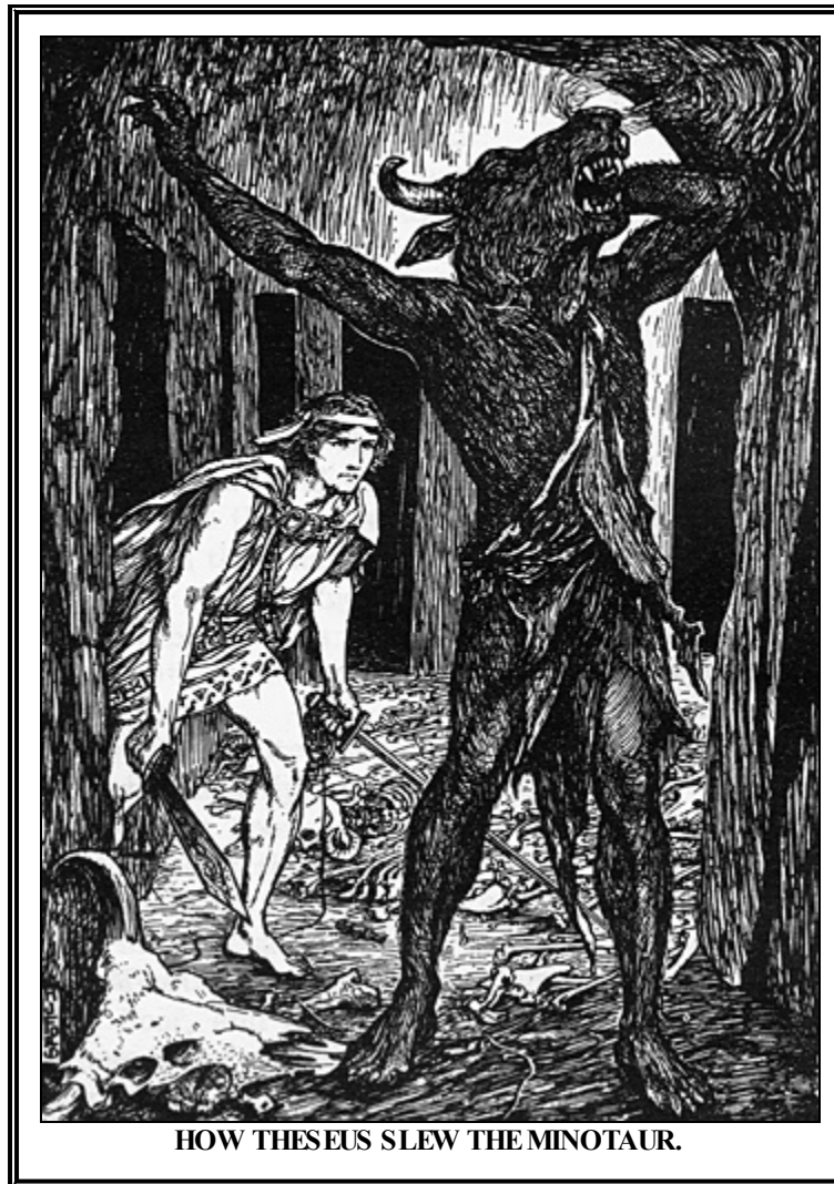
HOW THESEUS SLEW THE MINOTAUR.

Theseus knelt down, and thanked all the gods, and promised rich sacrifices, and a new temple to Pallas Athene, the Guardian of Athens. When he had finished his prayer, he drew the short sword, and hacked off the head of the Minotaur. He sheathed both his swords, took the head in his hand, and followed the string back out of the daylight place, to the rock where he had left his lamp. With the lamp and the guidance of the string he easily found his way to the door, which he unlocked. He noticed that the thick bronze plates of the door were dented and scarred by the points of the horns of the Minotaur, trying to force his way out.