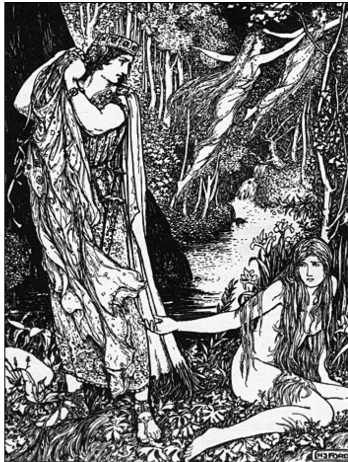
KING ATHAMAS STEALS NEPHELE'S CLOTHES SO THAT SHE CANNOT FLOAT AWAY WITH HER SISTERS.

Then he drove home, and did all that he had been told to do. On the first night of the new moon, when she shines like a thin gold thread in the sky, he left his palace, and climbed up through the hills, and hid in the wood by the edge of the pool. When the dawn began to shine silvery, he heard voices, and saw the three girls come floating through the trees, and alight on the river bank, and undress, and run into the water. There they bathed, and splashed each other with the water, laughing in their play. Then he stole to the grassy bank, and seized the clothes of the most beautiful of the three; and they heard him move, and rushed out to their clothes. Two of them were clad in a moment, and floated away up the glen, but the third crouched sobbing and weeping under the thick cloak of her yellow hair. Then she prayed the king to give her back her soft gray and rose-coloured raiment, but he would not till she had promised to be his wife. And he told her how long he had loved her, and how the goddess had sent him to be her husband, and at last she promised, and took his hand, and in her shining robes went down the hill with him to the palace. But he felt as if he walked on the air, and she scarcely seemed to touch the ground with her feet. She told him that her name was Nephele, which meant 'a cloud,' in their language, and that she was one of the Cloud Fairies who bring the rain, and live on the hilltops, and in the high lakes, and water springs, and in the sky.