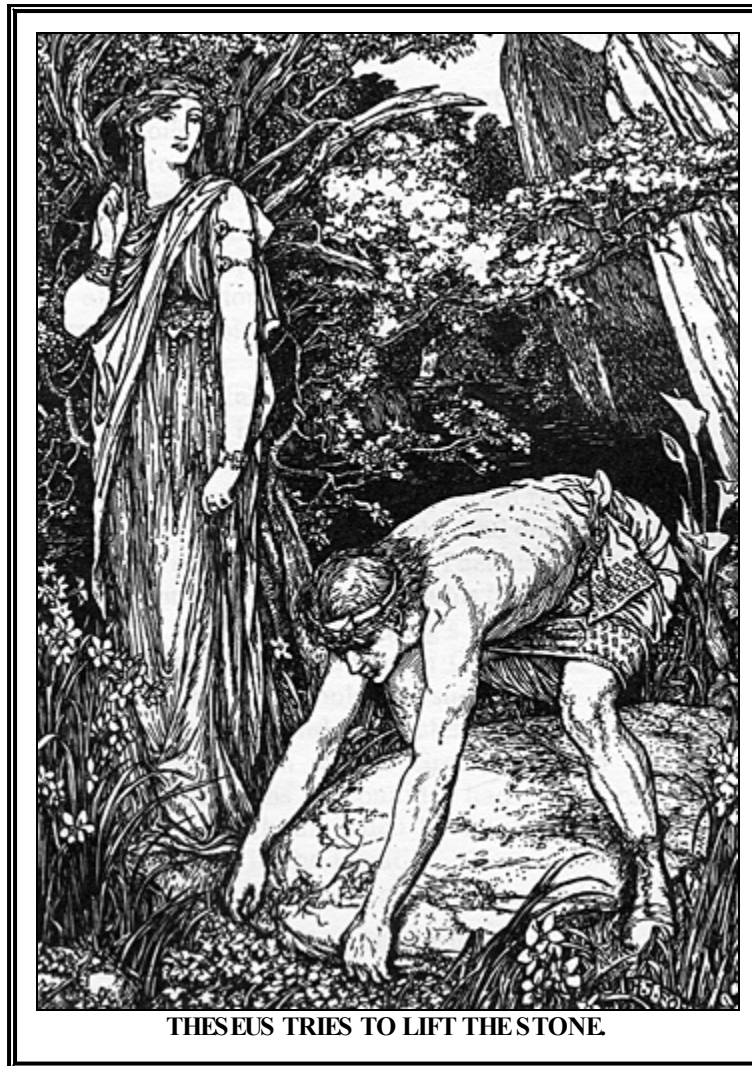
THESEUS TRIES TO LIFT THE STONE.

Beneath it there was nothing but the fresh turned soil, but in a hollow of the foot of the rock, which now lay uppermost, there was a wrapping of purple woollen cloth, that covered something. Theseus tore out the packet, unwrapped the cloth, and found within it a wrapping of white linen. This wrapping was in many folds, which he undid, and at last he found a pair of shoon, such as kings wear, adorned with gold, and also the most beautiful sword that he had ever seen. The handle was of clear rock crystal, and through the crystal you could see gold, inlaid with pictures of a lion hunt done in different shades of gold and silver. The sheath was of leather, with patterns in gold nails, and the blade was of bronze, a beautiful pattern ran down the centre to the point, the blade was straight, and double edged, supple, sharp, and strong. Never had Theseus seen so beautiful a sword, nor one so well balanced in his hand.