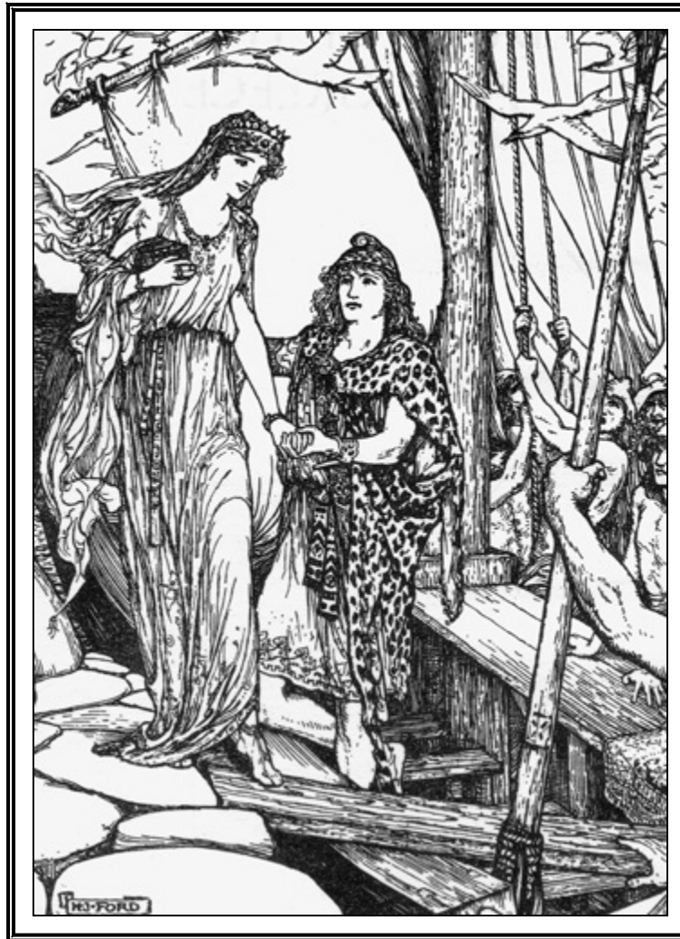
THE STEALING OF HELEN.