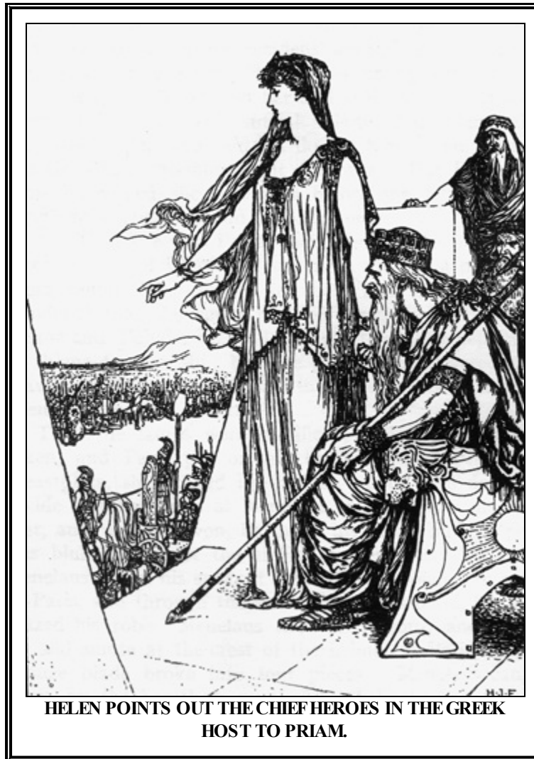
HELEN POINTS OUT THE CHIEF HEROES IN THE GREEK HOST TO PRIAM.

When Helen heard that her husband was to fight Paris, she wept, and threw a shining veil over her head, and with her two bower maidens went to the roof of the gate tower, where king Priam was sitting with the old Trojan chiefs. They saw her and said that it was small blame to fight for so beautiful a lady, and Priam called her 'dear child,' and said, 'I do not blame you, I blame the Gods who brought about this war.' But Helen said that she wished she had died before she left her little daughter and her husband, and her home: 'Alas! shameless me!' Then she told Priam the names of the chief Greek warriors, and of Ulysses, who was shorter by a head than Agamemnon but broader in chest and shoulders. She wondered that she could not see her own two brothers, Castor and Polydeuces, and thought that they kept aloof in shame for her sin; but the green grass covered their graves, for they had both died in battle, far away in Lacedaemon, their own country.