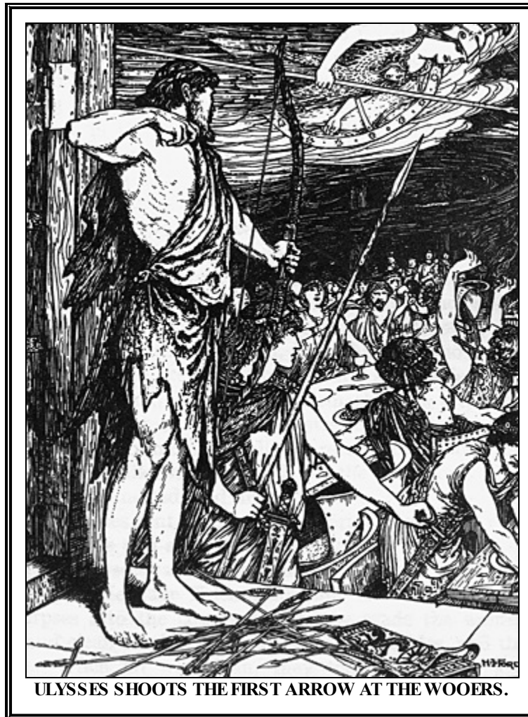
ULYSSES SHOTS THE FIRST ARROW AT THE WOOERS.

Ulysses thought that one of the women was showering down the weapons into the hall, but the swineherd and cowerd went to the armoury, through the doorway, as Telemachus had gone, and there they caught Melanthius, and bound him like a bundle, with a rope, and, throwing the rope over a rafter, dragged him up, and fastened him there, and left him swinging. Then they ran back to Ulysses, four men keeping the doorway against all the wooers that were not yet slain. But the Goddess Athene appeared to Ulysses, in the form of Mentor, and gave him courage. He needed it, for the wooers, having spears, threw them in volleys, six at a time, at the four. They missed, but the spears of the four slew each his man. Again the wooers threw, and dealt two or three slight wounds, but the spears of the four were winged with death. They charged, striking with spear and sword, into the crowd, who lost heart, and flew here and there, crying for mercy and falling at every blow. Ulysses slew the prophet, Leiodes, but Phemius, the minstrel, he spared, for he had done no wrong, and Medon, a slave, crept out from beneath an ox hide, where he had been lying, and asked Telemachus to pity him, and Ulysses sent him and the minstrel into the courtyard, where they sat trembling. All the rest of the wooers lay dead in heaps, like heaps of fish on the sea shore, when they have been netted, and drawn to land.