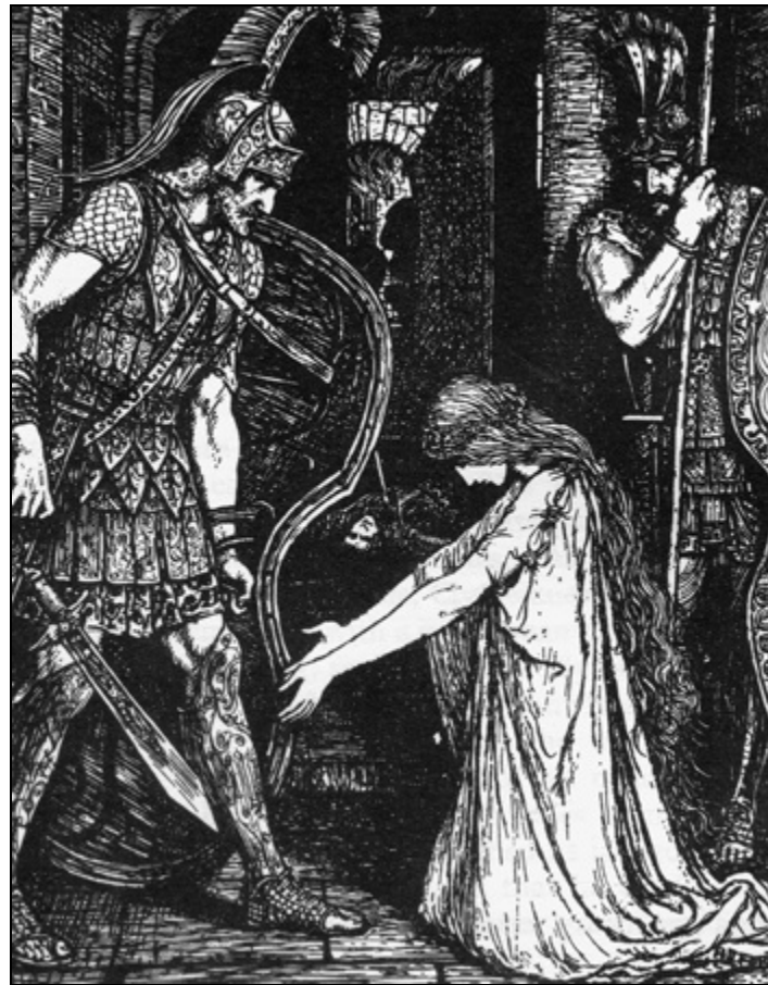
MENELAUS REFRAINS FROM KILLING HELEN AT THE INTERCESSION OF ULYSSES.