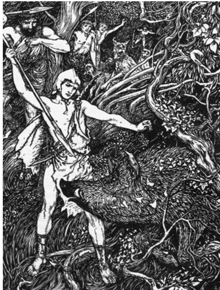
ULYSSES, WHEN A YOUTH, FIGHTS THE WILD BOAR AND GETS HIS WOUND IN HIS THIGH.