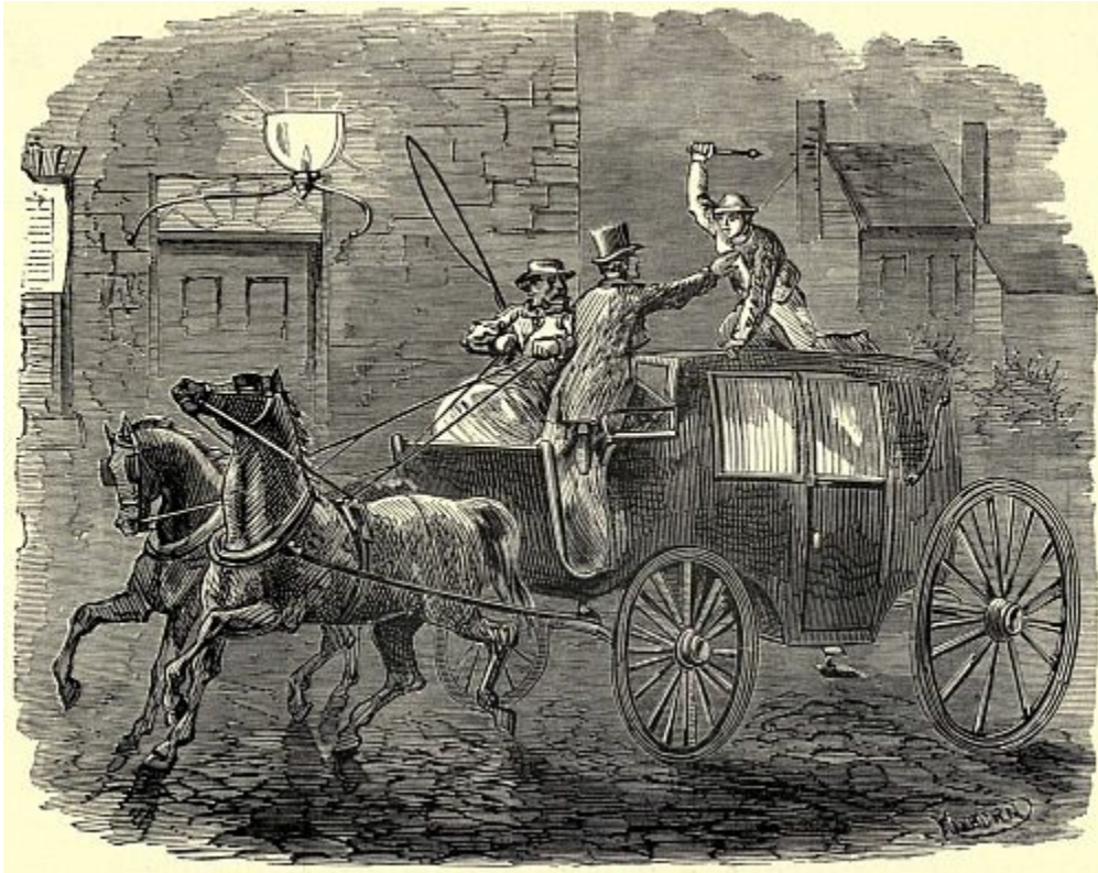
ON THE WAY TO MADISON PLACE.--Page 224.

With his cane in one hand, he reached forward with the other to grasp me by the collar; or this was what I supposed he intended to do. He did not see that I had a weapon, and getting up on my knees, I hit him again, this time with better effect, for he fell over backward upon the horses. The driver hauled in his team again, and seemed to be appalled at the fate of his companion.