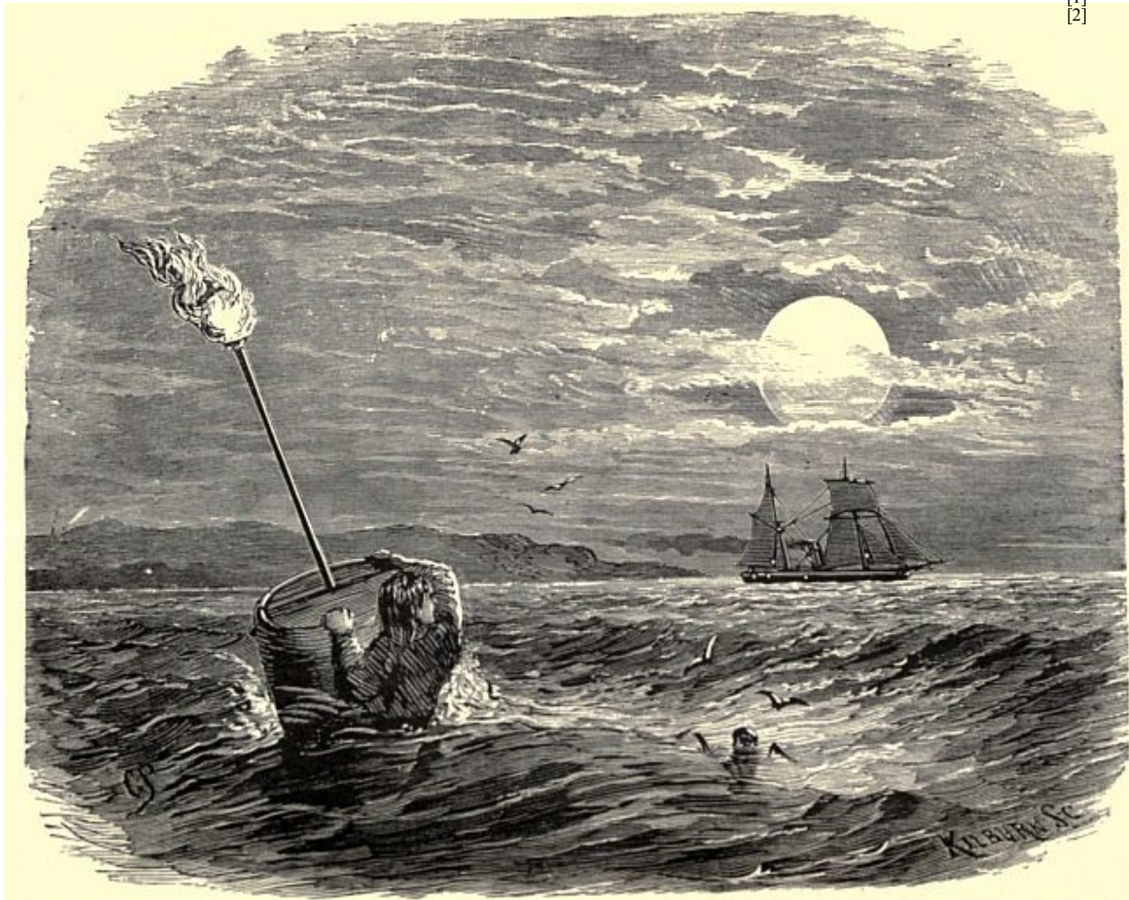
ERNEST SWIMS FOR THE DESPATCH BARREL.—Page 270