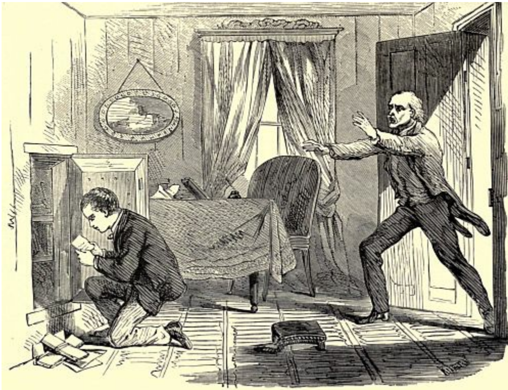
ERNEST SURPRISED BY HIS UNCLE.—Page 139.

I went directly to the bay window where I had entered the library before, and effected an entrance without any difficulty. I found the key of the safe under the cushion, where I had left it, and opened the door. Eagerly I seized the pile of papers I had seen before, and began to examine them. Most of them were unintelligible to me, and apparently had no connection with my father's affairs; but there were several letters dated at London, which I thrust into my pocket. I could find nothing else which promised to be of service to me, and I was about to close the door, when I discovered a sealed letter lying in a pigeon hole by itself. I took it from its place, and read the direction: "Robert G. Bunyard, 47 Old Jewry, Chambers, London."