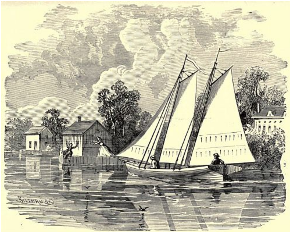
THE EXCITING SCENE ON THE SOUTH SHORE.—Page 14.

"Take the helm, Bob," shouted I, throwing the boat round into the wind, and springing upon the half deck.