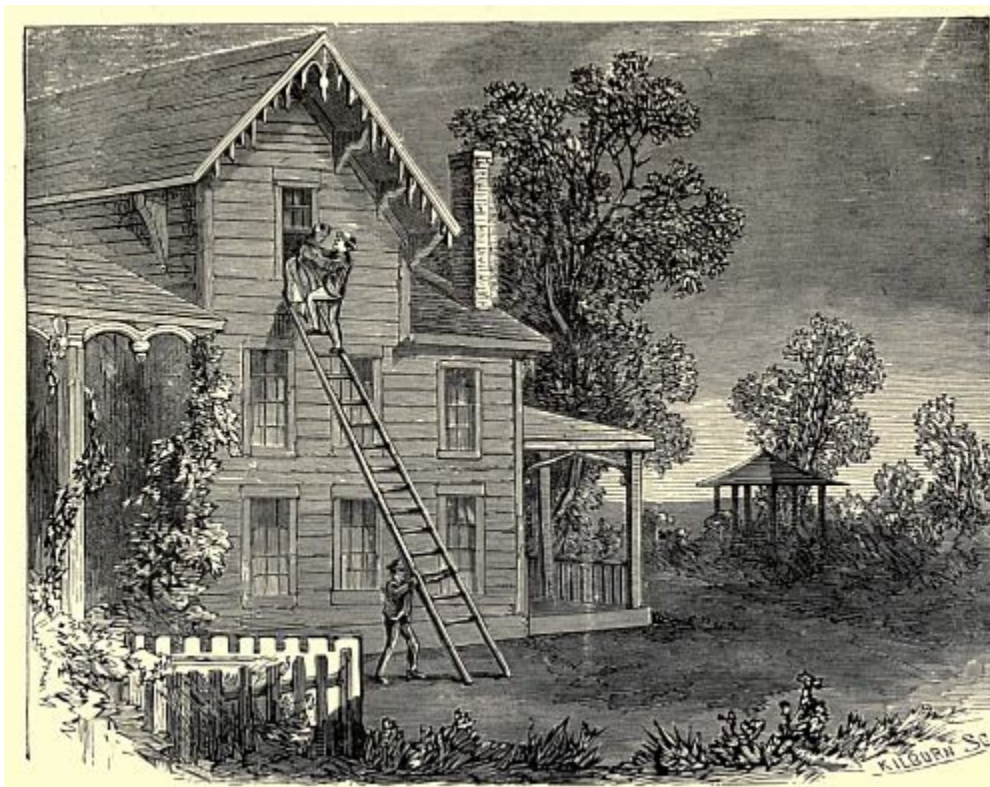
THE RESCUE OF THE CAPTIVE MAIDEN.—Page 49.

"Can you go down stairs and go out by the door?" I asked, willing to spare her the descent by the ladder.