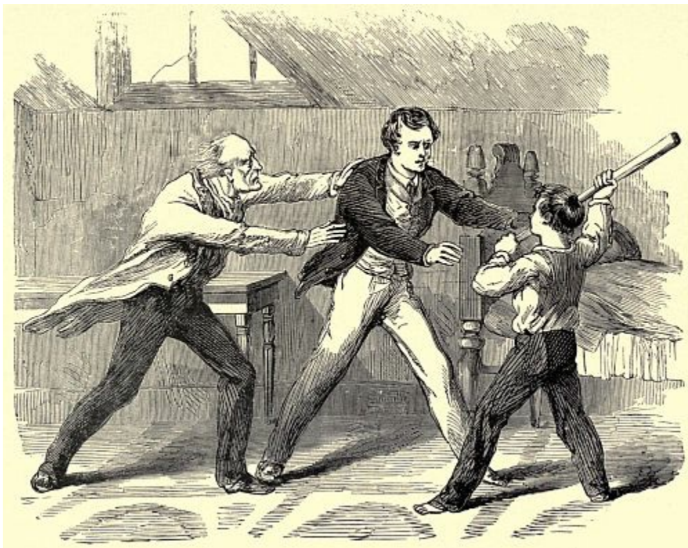
ERNEST DEFENDS HIMSELF.--Page 99.

I got out of the window, and placed the sash as I had found it. When I reached the ground, the cold sweat stood on my brow, so violent were my emotions. I entered the front door of the cottage, passing old Jerry on the way, and went to my chamber, the key being on the outside, where Tom had left it. I prayed that God would forgive me if I had done wrong, for I could not determine whether I had or not.