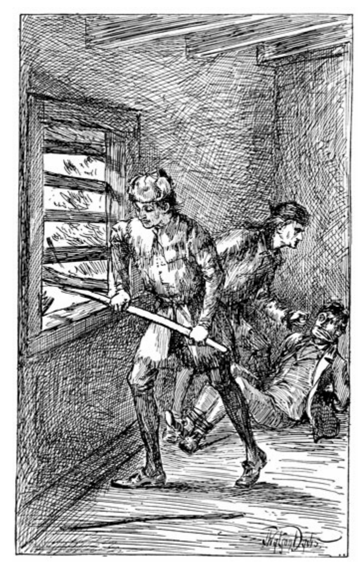
Nathan did as his comrade suggested, and save for a slight creaking now and then, the work was carried on.—Page 91.

Nathan did as his comrade suggested, and save for a slight creaking now and then, the work was carried on in almost perfect silence until the bar hung only by the points of the nails.