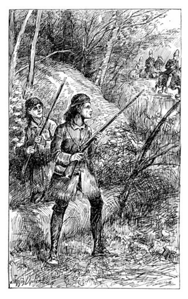
"You are grown timorous indeed, Evan, if you can imagine that noise to be caused by the Redcoats."—<u>Page 7</u>.

"That is the case only with the paper money."