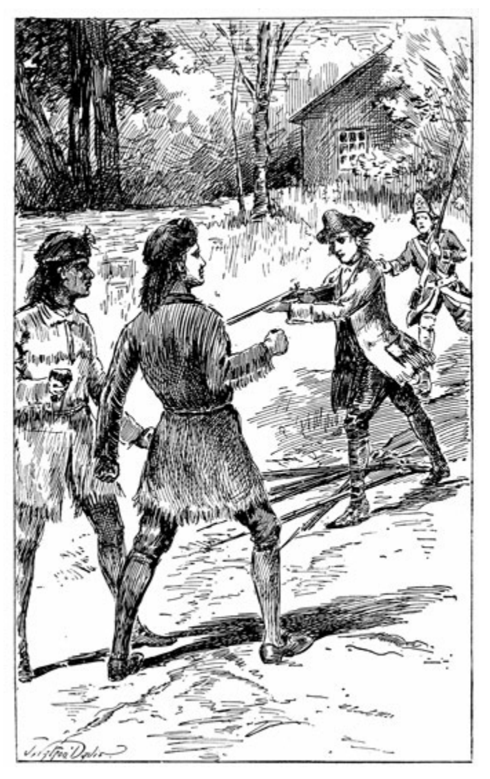
"Wheel about, and march back to the house, or I shall shoot," said the Tory. \underline{Page} \underline{153} .