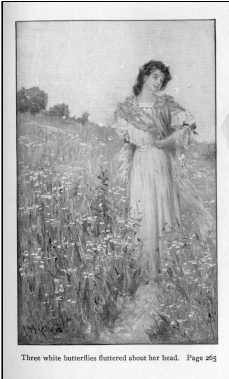
Three white butterflies fluttered about her head. Page 265

She paused abruptly midway of the daisies, and I walked toward her slowly--it must have been slowly--and I think we were both glad of a moment's respite in which to study each other. Then she spoke at once, as though our meeting had been prearranged.