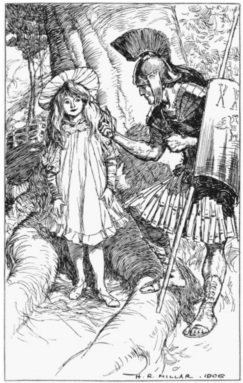
'You put the bullet into that loop.'

My people have lived at Vectis for generations. Vectisthat island West yonder that you can see from so far in clear weather.'