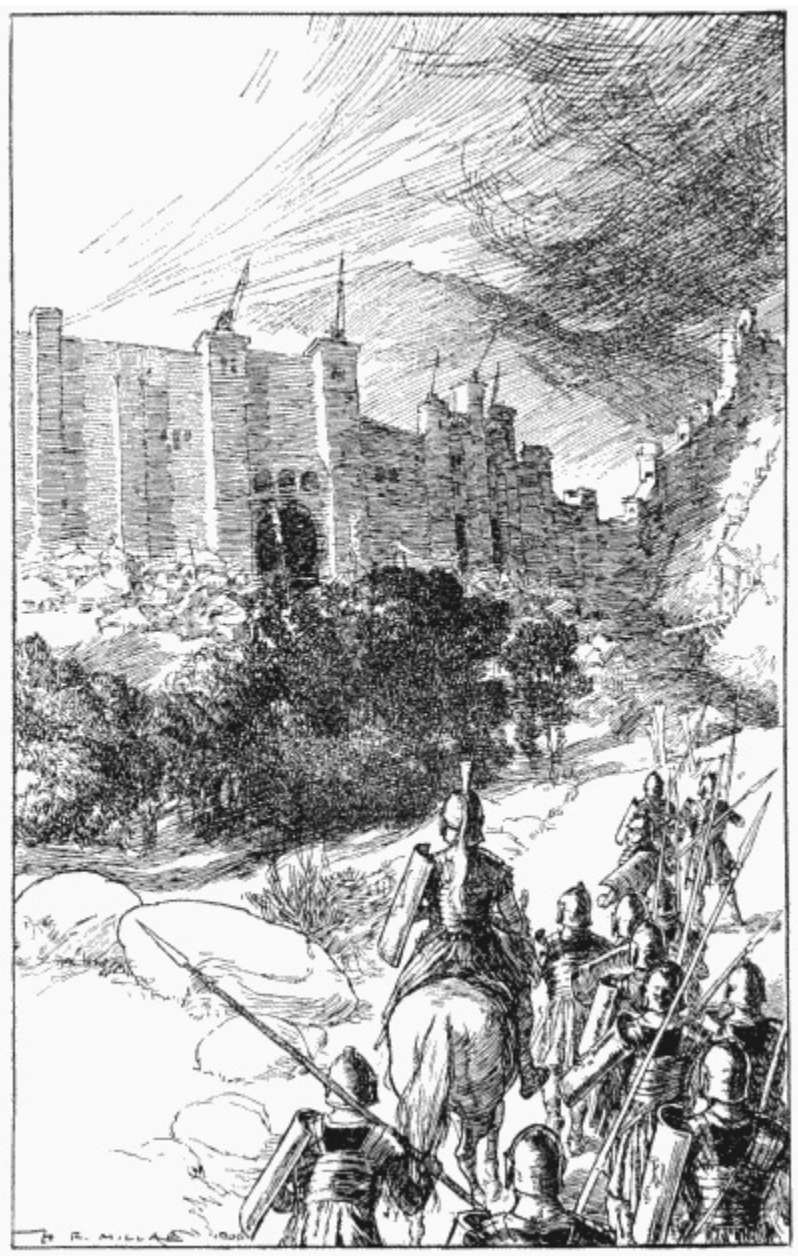
'And that is the Wall!'

in summer, freezing in winter, is that big, purple heather country of broken stone.