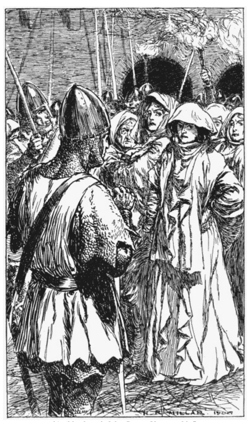
'At this she cried that I was a Norman thief'

'Yes, here. See! From the Upper Ford, Weland's Ford, to the Lower Ford, by the Belle Allee, west and east it ran half a league. From