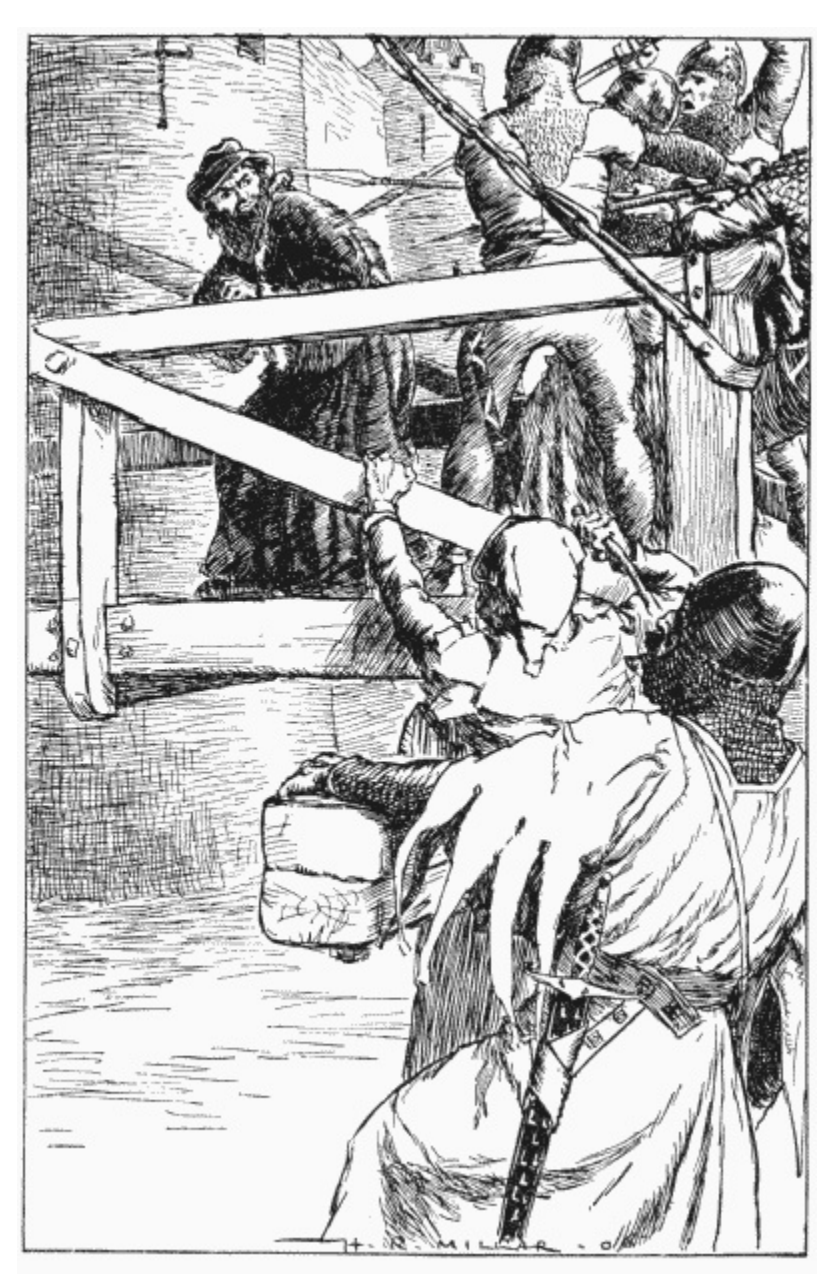
'They drove me across the drawbridge'

'My Prophecy was that I should be a Lawgiver to a People of a strange land and a hard speech. I knew I should not die. I washed my cuts. I found the tide-well in the wall, and from Sabbath to Sabbath I dove and dug there in that empty, Christian-smelling fortress. He! I spoiled the Egyptians! He! If they had only known! I drew up many good loads of gold, which I loaded by night into my boat. There had been gold-dust too, but that had been washed out by the tides.'