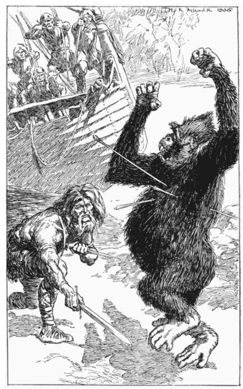
'Thorkild had given back before his Devil, till the bowmen on the ship could shoot it all full of arrows'

told me: it was one of their old women healed up Hugh's poor arm.'