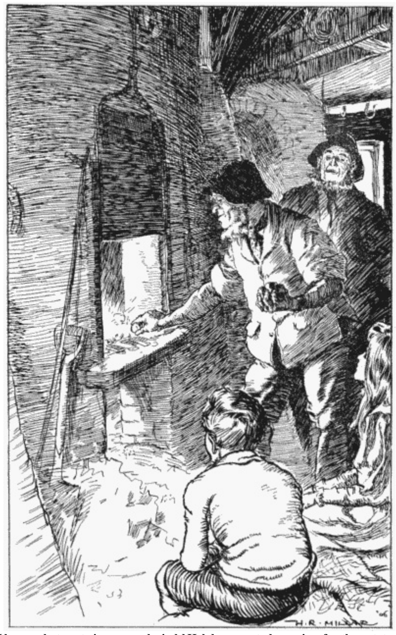
'I know what sort o' man you be,' old Hobden grunted, groping for the potatoes.

floods at Robertsbridge, when the miller's man was drowned in the street?'