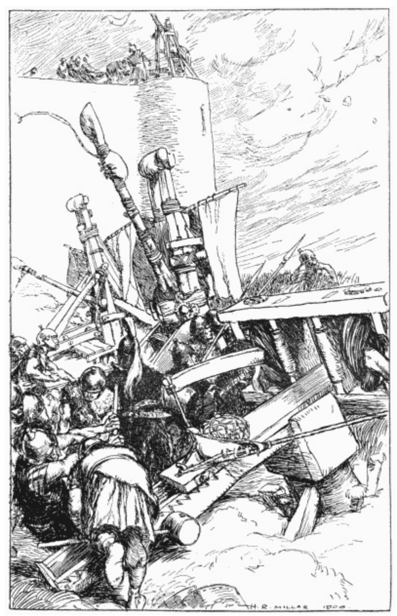
'We dealt with them thoroughly through a long day.'

makes everything clean again. A few men may come ashore, but very few. ... It was not hard work, except the waiting on the beach in blowing sand and snow. And that was how we dealt with the Winged Hats that winter.