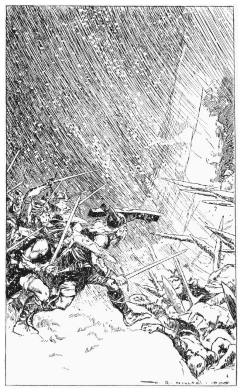
'Where they had suffered most, there they charged in most hotly.'

show them all the roads across the heather. I had this from a Pict prisoner. They were as much our spies as our enemies, for the Winged Hats oppressed them, and took their winter stores. Ah, foolish Little People!