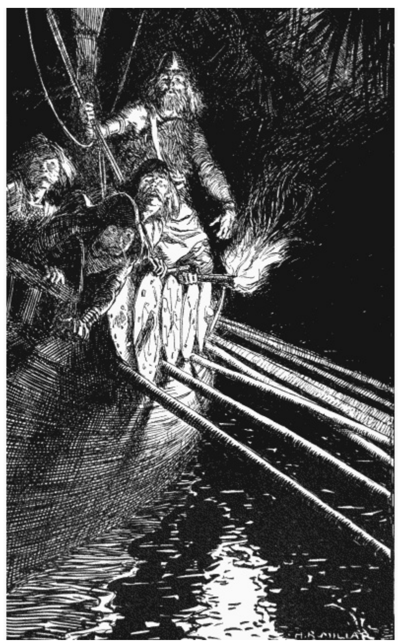
'So we called no more.'

'He was a landless man, and had been slave to some King in the East. He would have beaten out the gold into deep bands to put round the oars, and round the prow.