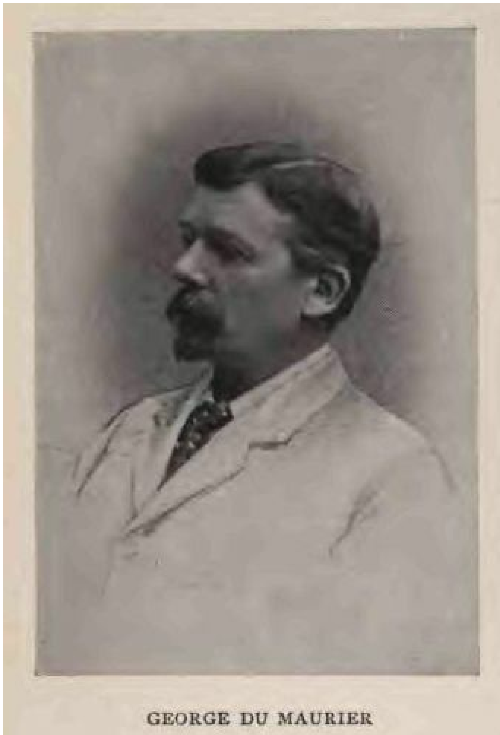
GEORGE DU MAURIER

Mr. Du Maurier has a brilliant history, but it must be candidly recognized that it is written or drawn mainly in an English periodical. It is only during the last two or three years that the most ironical of the artists of Punch has exerted himself for the entertainment of the readers of Harper; but I seem to come too late with any commentary on the nature of his satire or the charm of his execution. When he began to appear in Harper he was already an old friend, and for myself I confess I have to go through rather a complicated mental operation to put into words what I think of him. What does a man think of the language he has learned to speak? He judges it only while he is learning. Mr. Du Maurier's work, in regard to the life it embodies, is not so much a thing we see as one of the conditions of seeing. He has interpreted for us for so many years the social life of England that the interpretation has become the text itself. We have accepted his types, his categories, his conclusions, his sympathies and his ironies, It is not given to all the world to thread the mazes of London society, and for the great body of the disinherited, the vast majority of the Anglo-Saxon public. Mr. Du Maurier's representation is the thing represented. Is the effect of it to nip in the bud any remote yearning for personal participation? I feel tempted to say yes, when I think of the follies, the flatnesses, the affectations and