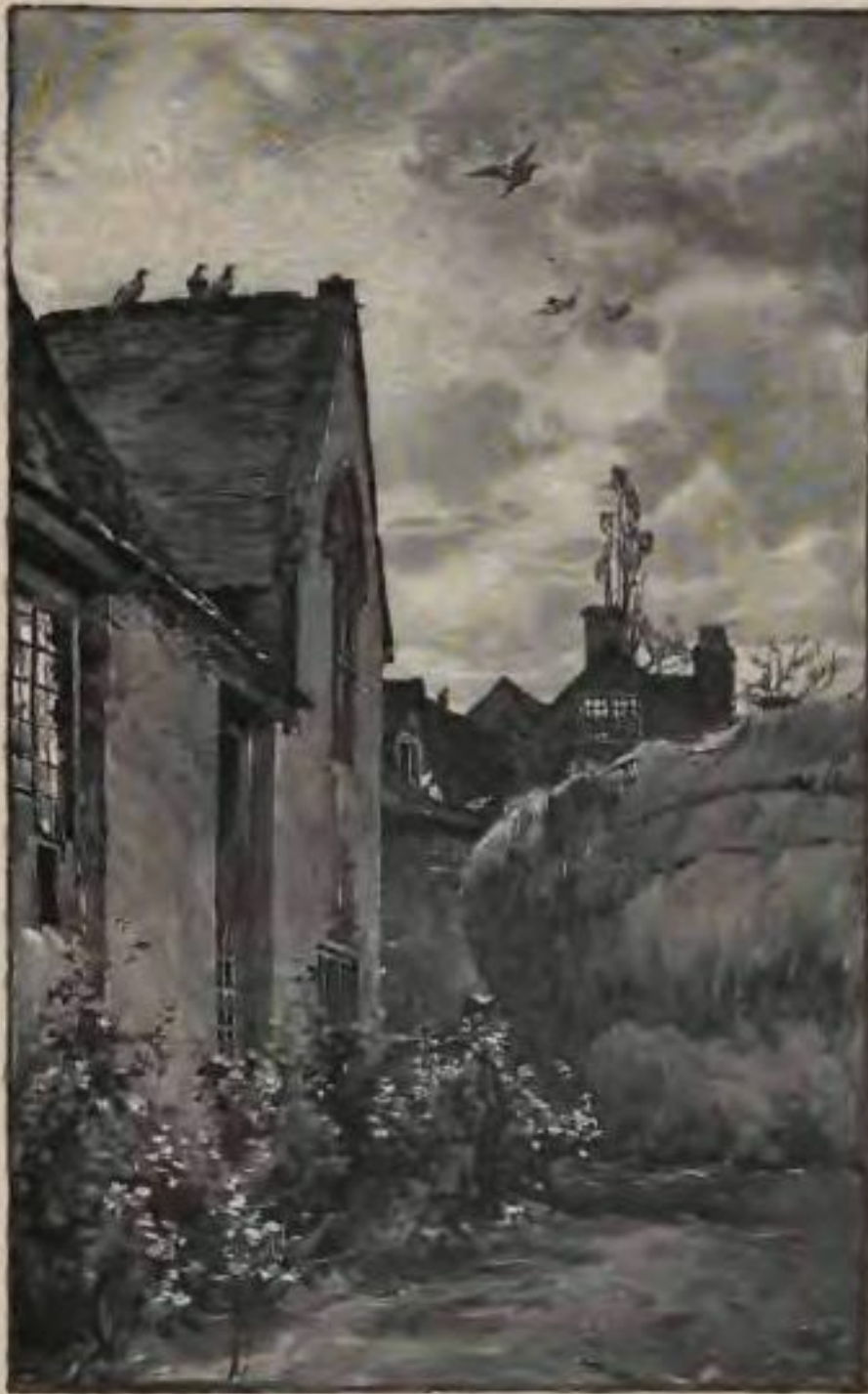
BACK OF THE PRIORY, BROADWAY

In regard, however, to the implications and explications of this perfection of a village, primarily and to be just, Broadway is, more than any one else. Mr. Frank Millet. Mr. Laurence Hutton discovered but Mr. Millet appropriated it: its sweetness was wasted until he began to distil and bottle it. He disinterred the treasure, and with impetuous liberality made us sharers in his fortune. His own work, moreover, betrays him, as well as the gratitude of participants, as I could easily prove if it did not perversely happen that he has commemorated most of his impressions in color. That excludes them from the small space here at my command; otherwise I could testify to the identity of old nooks and old objects, those that constitute both out-of-door and in-door furniture.