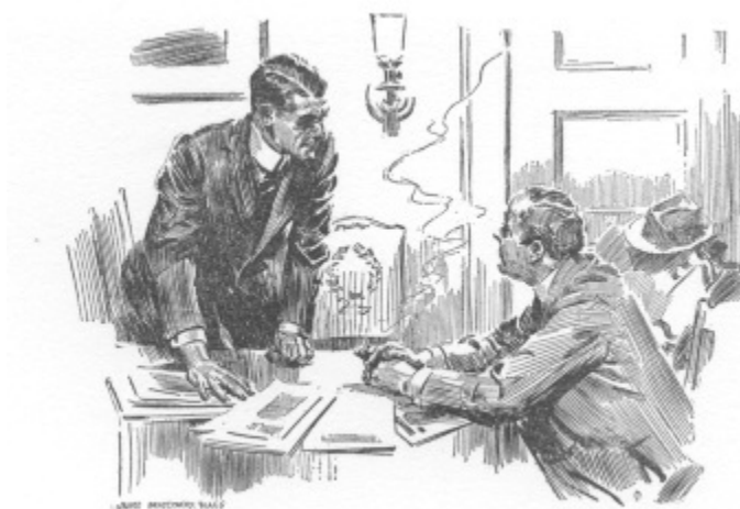
"'Let's not waste any time,' he said"—Page 122

"Nothing." Jock had cleared the center table and was opening his flat bundle of papers. He drew up two chairs. "Let's not waste any time," he said. "I've had a twelve-hour wait for this." He seemed to control the situation. Obediently Ben Griebler hung up the receiver, came over, and took the chair very close to Jock.