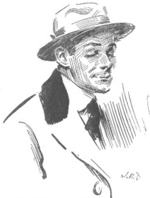
"'Well, raw-thah!' he drawled"—Page 45

Jock McChesney laughed a little, pleased, conscious laugh. "Well, raw-thah!" he drawled, and opened the door leading into the main office. He had been loath to lose one crumb of the savor of it.