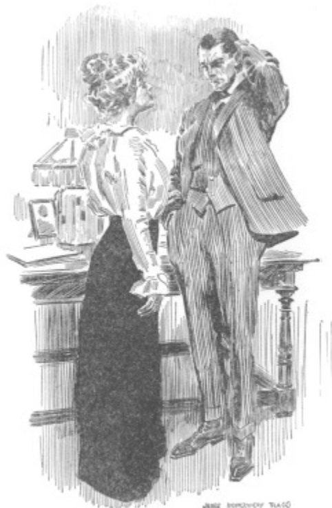
"She laid one hand very lightly on his arm and looked up into the sullen, angry young face"—Page 103

"I've seen older men than you are, Jock, and better men, and bigger men, wearing that same look, and for the same reason. Every ambitious man or woman in business wears it at one time or another. Sooner or later, Jock, you'll have your chance at the money end of this game. If you don't care about the thing you call ethics, it'll be sooner. If you do care, it will be later. It rests with you, but it's bound to come, because you've got the stuff in you."