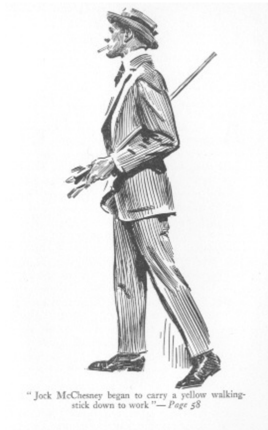
"Jock McChesney began to carry a yellow walking-stick down to work"—Page 58

ginger, she would listen, eyebrows raised, lower lip caught between her teeth--a trick which gives a distorted expression to the features, calculated to hide any lurking tendency to grin. Besides, though Emma McChesney was forty she looked thirty-two (as business women do), and knew it. Her hard-working life had brought her in contact with people, and things, and events, and had kept her young.