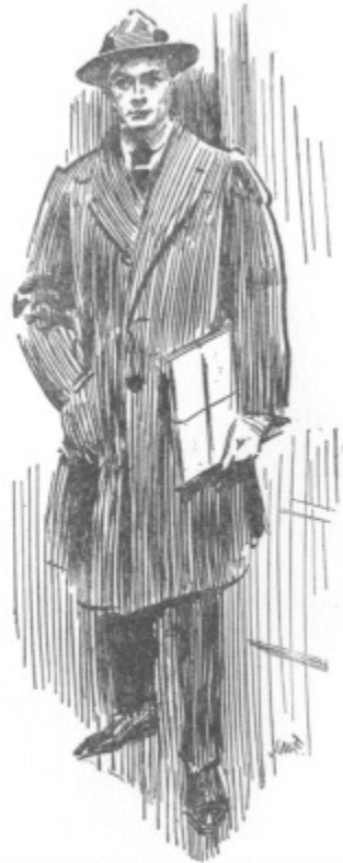
"He made straight for the main desk with its battalion of clerks"—Page 119

"Mr. Griebler in? Mr. Ben Griebler, St. Louis?"