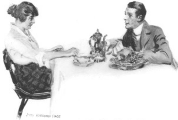
"You're a jealous blond," he said"—Page 8

Mrs. McChesney folded her napkin and rose. She looked unbelievably young, and trim, and radiant, to be the mother of this boasting boy.