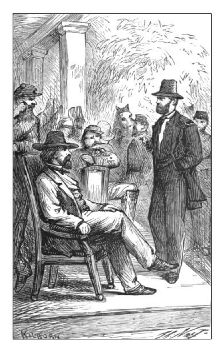
GRANT AND PEMBERTON IN VICKSBURG.-Page 236.

Grant notified Banks, at Port Hudson, of the capture of Vicksburg, and offered to send him an army corps of "as good troops as ever trod American soil; no better are found on any other." Four days after the surrender, Port Hudson followed the example of Vicksburg. This event virtually completed the conquest of treason in the West. The Father of Waters rolled "unvexed to the sea," in the expressive language of President Lincoln. To sum up the results, in the words of Pollard, who is not particularly amiable at this point of his struggles through "The Lost Cause,"--"It was the loss of one of the largest armies which the Confederates had in the field; the decisive event of the Mississippi Valley; and the severance of the Southern Confederacy."