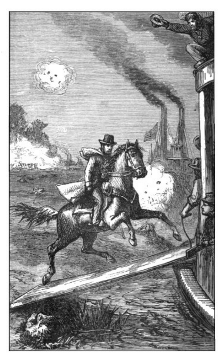
GRANT'S ESCAPE.-Page 123.

Grant superintended the execution of his own orders in the embarkation of his force; and, when most of them were on board of the steamers, he sent out a party to pick up the wounded. In the morning he had posted a reserve in a suitable place for the protection of the fleet, and as soon as the main body were secure on the decks of the transports, Grant, attended by a single member of his staff, rode out to withdraw this force. This guard, ignorant of the requirement of good discipline, had withdrawn themselves, and the general found himself uncovered in the presence of the advancing foe. Riding up on a hillock, he found himself confronting the whole rebel force, now again increased by fresh additions from the other side of the river. It was a time for an ordinary man to put spurs to his steed; but Grant had an utter contempt for danger. He stood still for a moment to examine the situation, during which he was a shining mark for rebel sharp-shooters. He wore a private's overcoat, the day being damp and chilly; and to this circumstance alone can his miraculous escape be attributed.