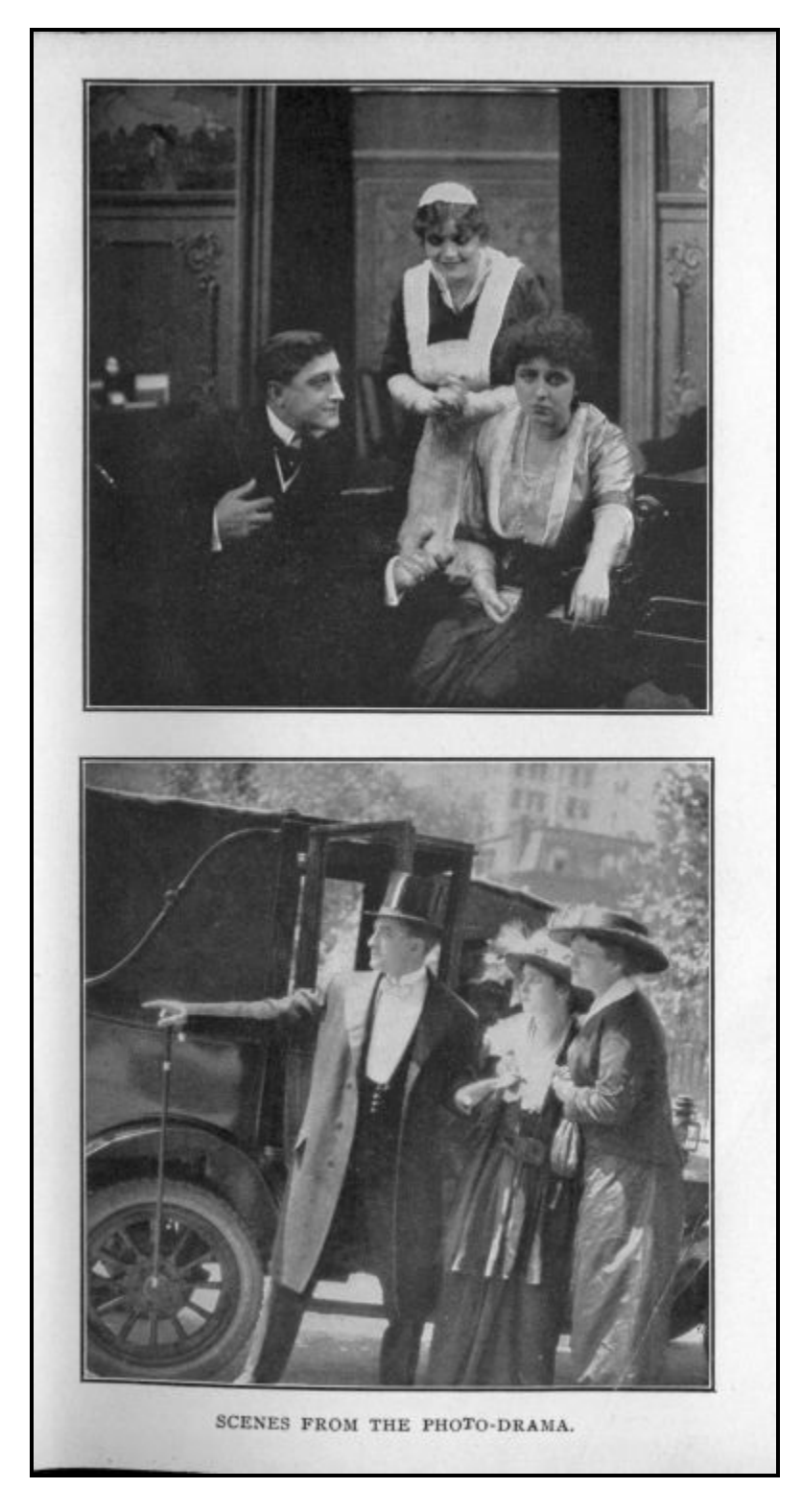
[Illustration: Scenes from the photo-drama.]

"My wife and I have been detained in New York this evening unexpectedly," explained Curtis to the hotel clerk. "We want a suite of rooms, a sitting-room, three bedrooms with baths--you would like Marcelle's room to communicate with yours, wouldn't you, dear?" and he turned suddenly to Hermione.