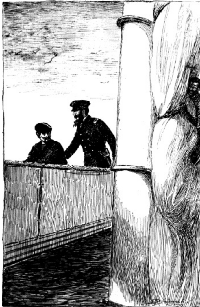
LILLYWORTH AND MULGRUM ON THE BRIDGE.

Dave listened with all his ears for any sound from the bridge; but he soon realized that if there was any, he was too far off to hear it. With the aid of the lashings of the foresail, he succeeded in climbing up on the mast to a point on a level with the bridge, and at the same time to make the mast conceal him from the eyes of Mr. Lillyworth and the scullion. The latter pretended to be at work, and occasionally the second lieutenant "jawed" at him for his clumsiness in lacing the sailcloth. Between these growls, they spoke together in a low tone, but Dave was near enough to hear what they said. Though he had never heard the voice of Pink Mulgrum before, he knew that of the second lieutenant, and he was in no danger of confounding the two. Pink used excellent language, as the steward was capable of judging, and it was plain enough that he was not what he had appeared to be.