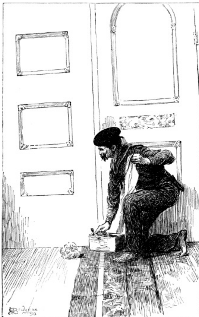
MULGRUM AT THE CAPTAIN'S DOOR.

"That is Pink Mulgrum, Captain Passford," said he, evidently to prevent his superior from misinterpreting the lightness of his conduct. "As you are aware, he is deaf and dumb."