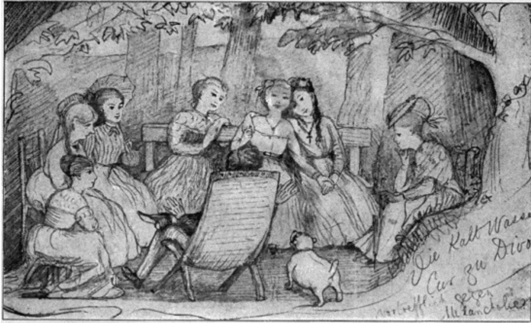
"The cold water cure at Divonne—excellent for melancholia."—From a letter of William James (page 447)