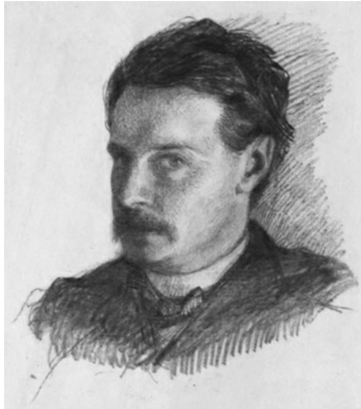
Pencil-drawn portrait of William James by himself about 1866