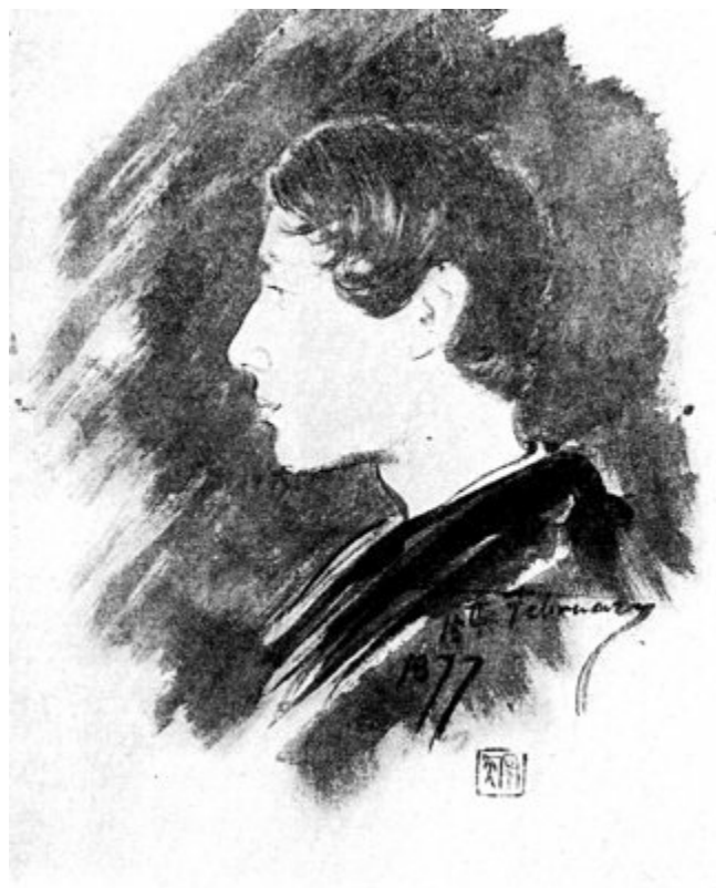
RABINDRANATH TAGORE IN 1877

A picture of one day's reading of the Ramayana comes clearly back to me.