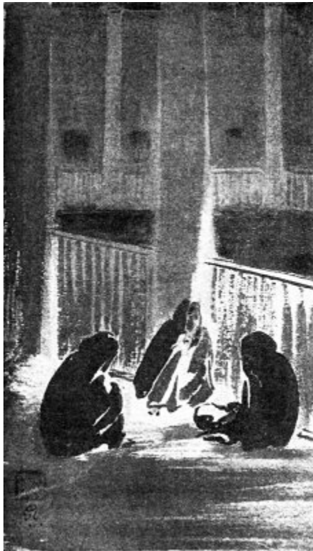
THE SERVANT-MAIDS IN THE VERANDAH

But the achievement of mine which appealed most to my mother was that while the rest of the inmates of the inner apartments had to be content with Krittivasa's Bengali rendering of the Ramayana, I had been reading with my father the original of Maharshi Valmiki himself, Sanscrit metre and all. "Read me some of that Ramayana, do! " she said, overjoyed at this news which I had given her.