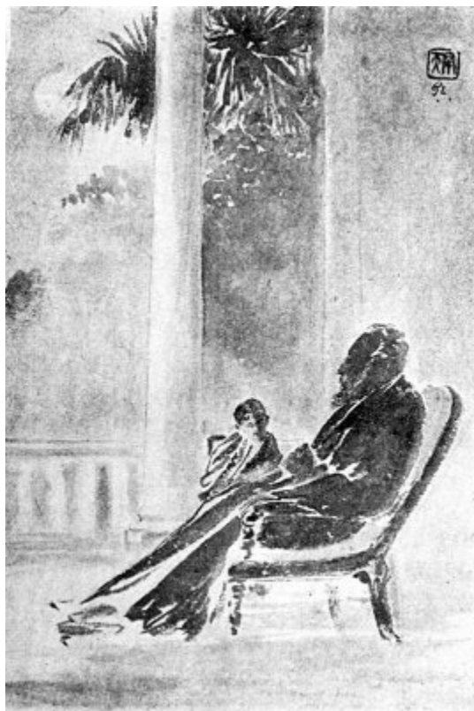
SINGING TO MY FATHER

I was never tired of roaming about among those miniature hills and dales in hopes of lighting on something never known before. I was the Livingstone of this undiscovered land which looked as if seen through the wrong end of a telescope. Everything there, the dwarf date palms, the scrubby wild plums and the stunted jambolans, was in keeping with the miniature mountain ranges, the little rivulet and the tiny fish I had discovered.