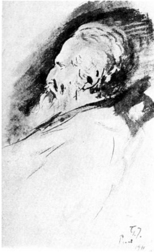
MY ELDEST BROTHER