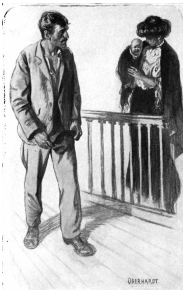
"He caught sight of the waiting Maria."

"Madonna! I am pardoned for killing Beppe? O giudici , I kiss your hands." He seized that of the interpreter and devoured it with kisses. Then with a smile he added: "Ah, you see I could not but kill him! He had ruined my home! He had deprived me of honor!"