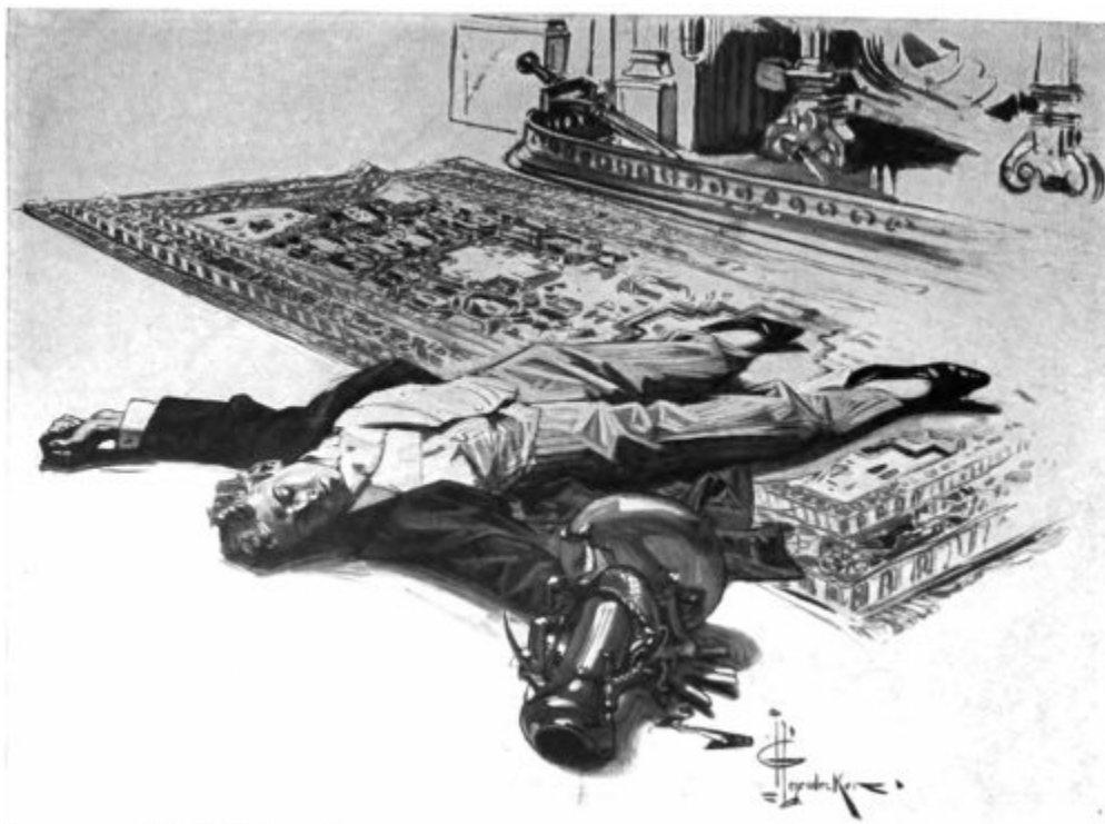
"Mortmain . . . lay motionless on the floor."

Mortmain uttered a moan and lay motionless on the floor. The little Sevres clock ticked off forty seconds and then softly chimed the quarter, while the blood from the baronet's hand spurted in a tiny stream upon the rug.