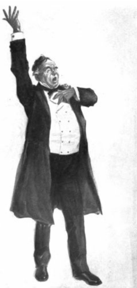
"The distinguished Flynn burst into a deluge of oratory."

The distinguished Flynn patted him on the back as he took his seat and felt greatly encouraged. These Italians were great actors--and no mistake!