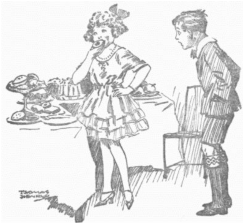
WILLIAM ACCORDED HER A CERTAIN GRUDGING ADMIRATION. ICED CAKES, CREAM CAKES, PASTRIES MELTED AWAY BEFORE HER.

They had a rehearsal of the Maypole dance and crowning the next day.