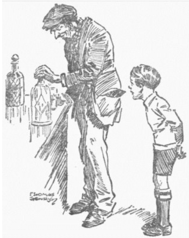
MR. BLANK MADE HIMSELF QUITE AT HOME.

Mr. Blank did. He emptied Mr. Brown's cigar-box into his pocket. He drank three glasses of Mr. Brown's whiskey and soda. While William's back was turned he filled his pockets with the silver ornaments from the mantel-piece. He began to inspect the drawers in Mr. Brown's desk. Then: