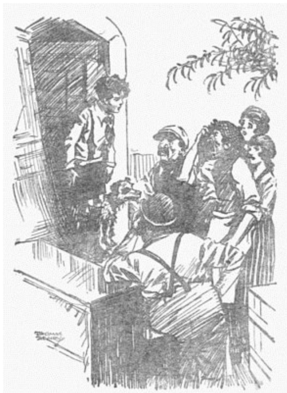
WILLIAM'S JERSEY WAS TORN FROM SHOULDER TO HEM. HE LOOKED STERN AND INDIGNANT.

"A nice thing to do!" he began bitterly. "Shuttin' me up in that ole van. How d'you expect me to breathe, shut in with ole bits of furniture. Folks can't live without air, can they? A nice thing if you'd found me dead! "