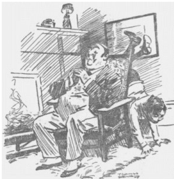
WILLIAM WAS ON THE FLOOR BEHIND UNCLE GEORGE'S CHAIR ENDEAVOURING TO TURN A SOMERSAULT IN A VERY RESTRICTED SPACE.

"Boisterous! Boisterous!" he murmured disapprovingly. "You should combine the gentleness of a Moore with the courage of a Wellington, William."