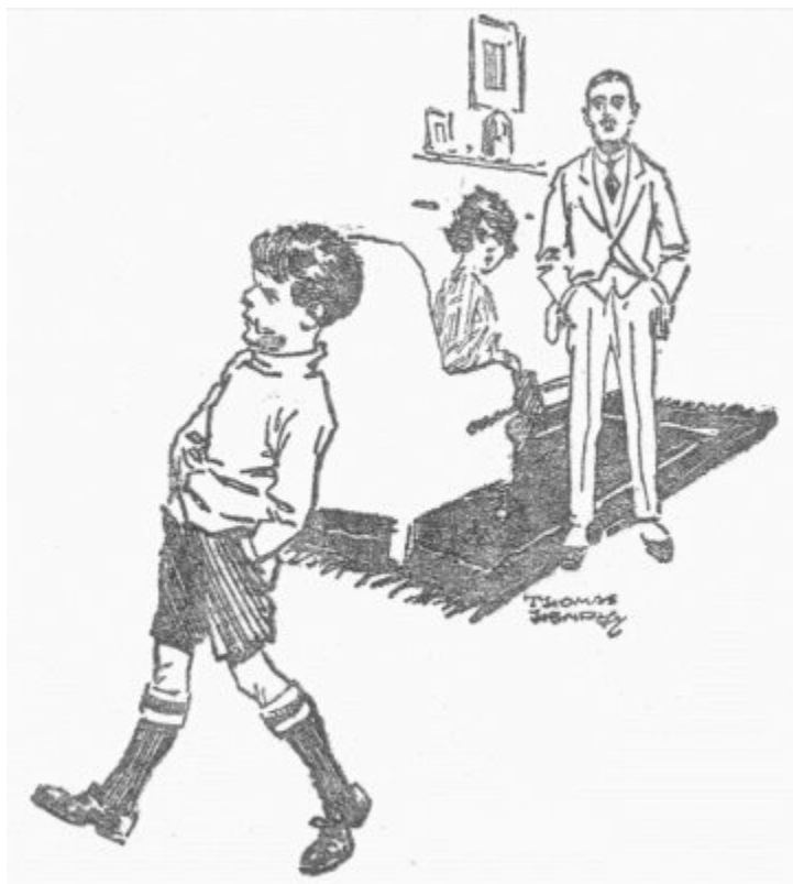
WILLIAM DEPARTED WITH AN AIR OF SCOWLING MYSTERY, LEAVING HIS PARENTS SPEECHLESS WITH AMAZEMENT.

"Yus, I will, too," said Mr. Blank. "But jus' you tell me first 'oo lives at all these 'ere nice 'ouses an' all about 'em. See?"