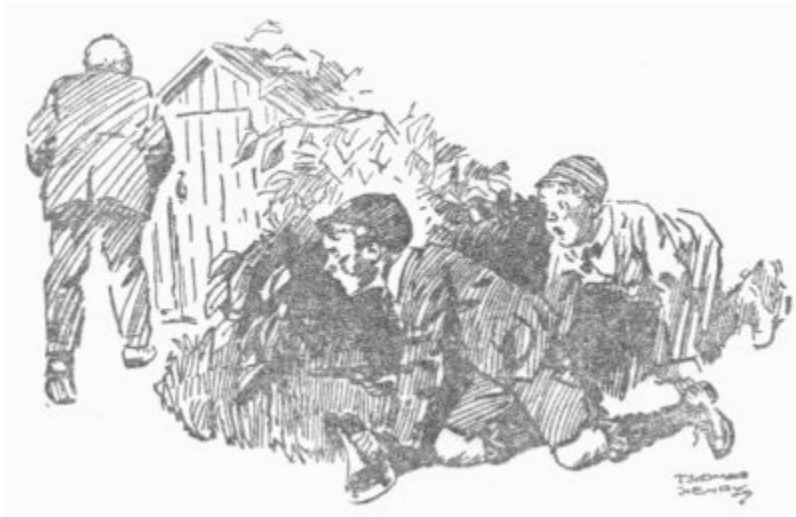
WILLIAM AND GINGER FOLLOWED ON ALL FOURS WITH ELABORATE CAUTION.

"Then I won't try killin' him not straight off. I'll think of some plansomethin' cunning'."