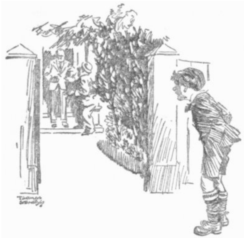
WILLIAM'S SPIRITS SANK A LITTLE AS HE APPROACHED THE GATE. HE COULD SEE THROUGH THE TREES THE FAT CARAVAN-OWNER GESTICULATING AT THE DOOR.

William decided that all things considered it was best to make a day of it.