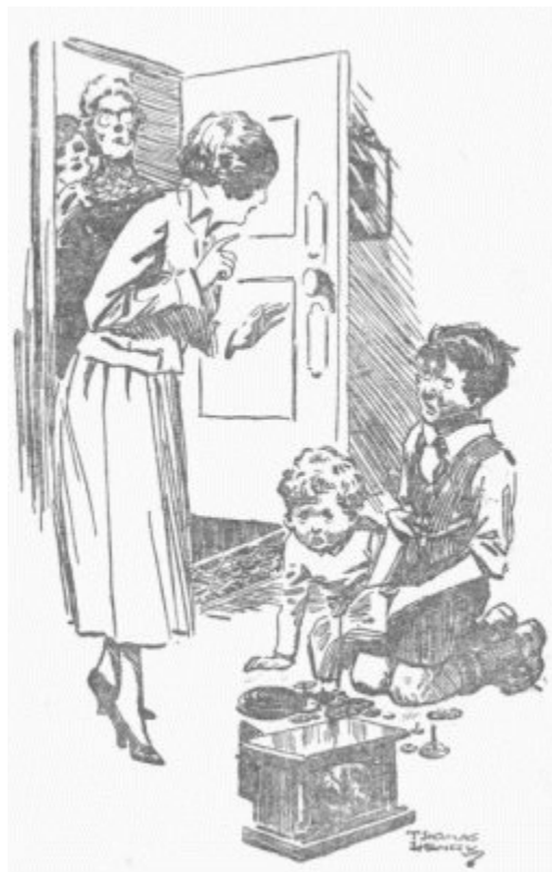
AROUND THEM LAY, MOST INDECENTLY EXPOSED, THE INTERNAL ARRANGEMENTS OF THE LIBRARY CLOCK.

"You needn't worry," had said William's mother. "It's at 10.30, and if you go to get ready when the clock in the library strikes ten it will give you heaps of time."