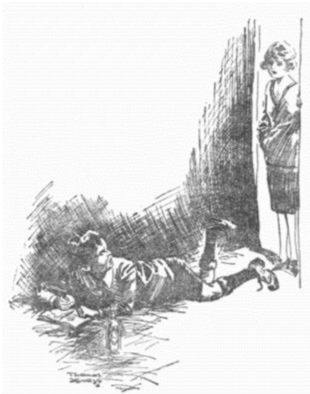
ETHEL APPEARED IN THE DOORWAY. "MOTHER WANTS YOU," SHE ANNOUNCED.

"He's reading some old book in the barn," he heard her announce, "and he says"