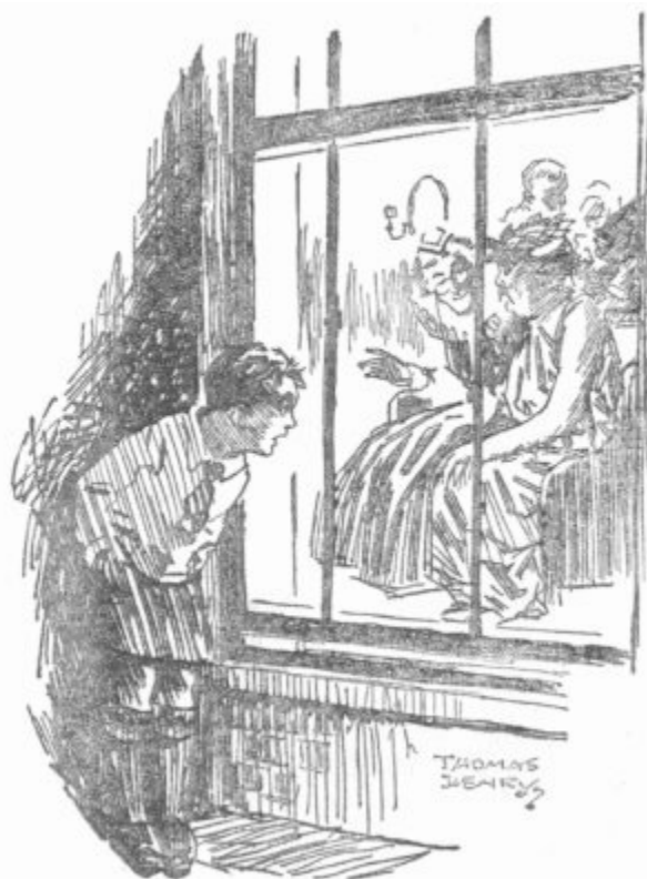
MR. LAMBKIN SAT, MISERABLE AND DEJECTED, AND YET WITH A CERTAIN PATHETIC RESIGNATION.

And Mr. Lambkin sat, miserable and dejected and yet with a certain pathetic resignation. For what can one do against Fate? Then the President caught sight of William and approached the window.