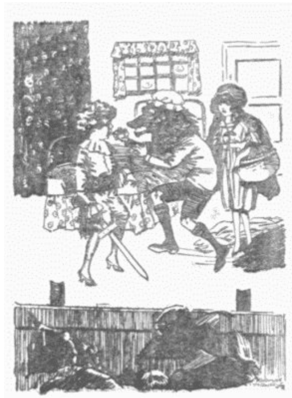
THE SIGHT OF THE HATED CUTHBERT ABOUT TO EMBRACE HIS JOAN GOADED WILLIAM TO TEMPORARY MADNESS.

Mrs. de Vere Carter had filled Red Riding-Hood's basket with packages of simple groceries, which included, among other things, a paper bag of flour and a jar of jam.