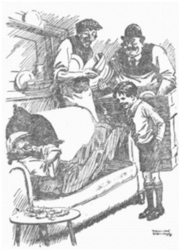
WILLIAM SURVEYED HIM WITH PLEASURE. "I'LL SHOW YOU MY DOG WHEN YOUR LEGS ARE BETTER," HE SAID.

"He's no partic'lar sort of a dog," said William honestly, "but he's a jolly fine dog. You should see him do tricks!"