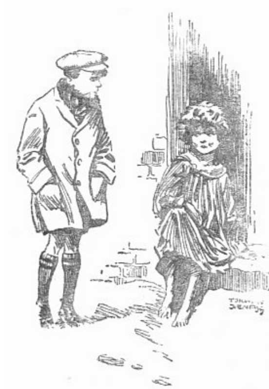
"GARN! SWANK!" WILLIAM TURNED WITH A DARK SCOWL.