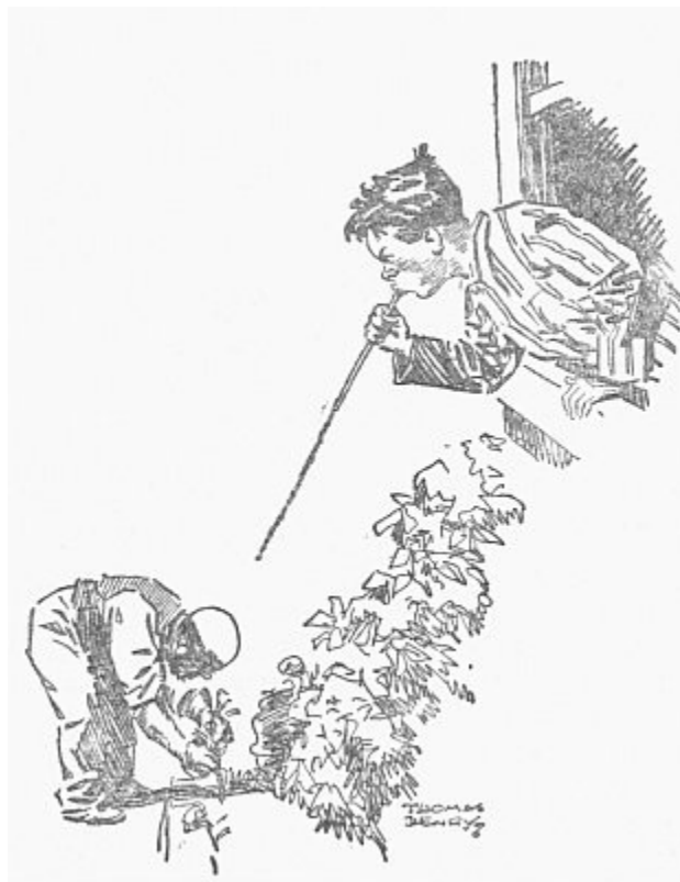
THE PEA DID NOT EMBED ITSELF INTO THE GARDENER'S