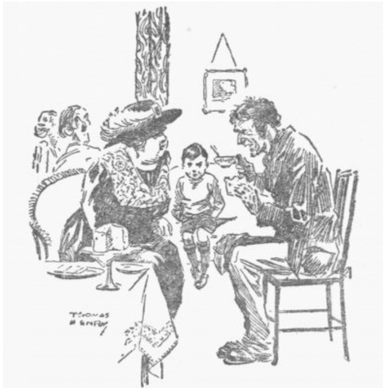
"ARE YOU LOOKING FOR WORK, MY POOR MAN?" ASKED MRS. DE VERE CARTER.

"How you must have suffered! Yes, there is suffering ingrained in your face. A piece of shrapnel? Ten inches square? Right in at one hip and out at the other? Oh, my poor man! How I feel for you. How all class distinctions vanish at such a time. How"