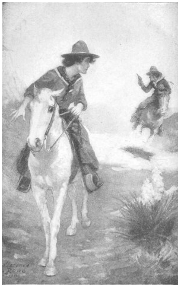
THE RIDER SLEWED IN THE SADDLE WITH HIS WHOLE ATTENTION UPON POSSIBLE PURSUIT.