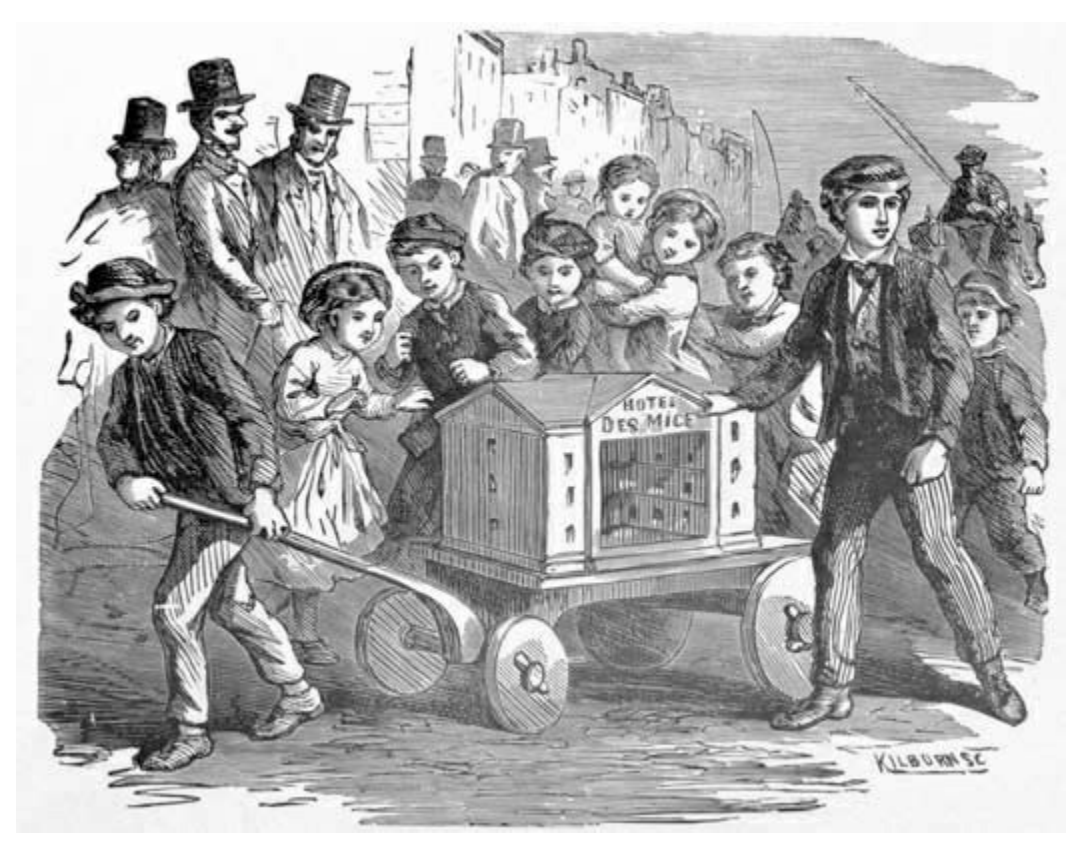
LEO STARTS FOR STATE STREET.—Page 152.

labelled in large letters on the front gable--was loaded upon a little wagon of Leo's build, and they started for the busy street, attended by a crowd of curious youngsters, of both sexes and of all conditions.