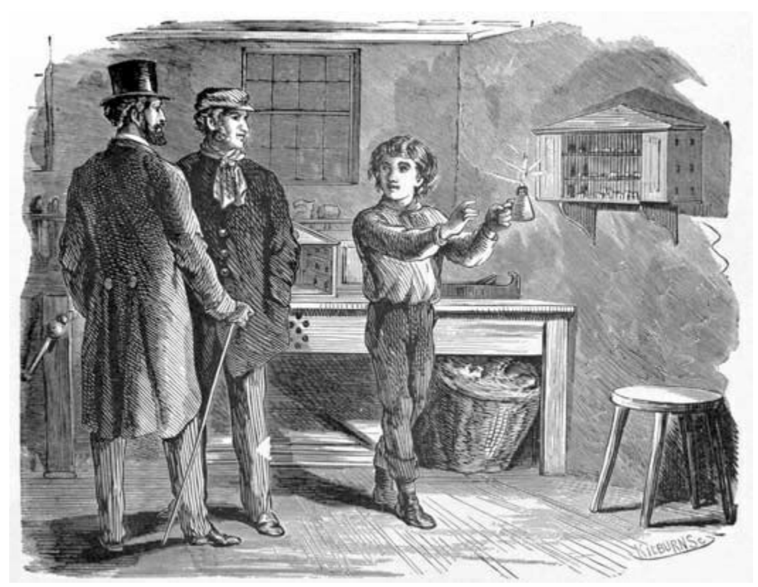
LEO'S WORKSHOP.--Page 76.

In other houses, they were chasing each other along the galleries, performing various gymnastics on the apparatus provided for the purpose, or revolving in the whirligigs that some of the cages contained. It was after dark; and, having reposed during the day, they were full of life and spirit at night. The detective was delighted, and even Mr. Checkynshaw for a few moments forgot that his valuable papers had been stolen. Both of them gazed with interest at the cunning movements and the agile performances of the little creatures.