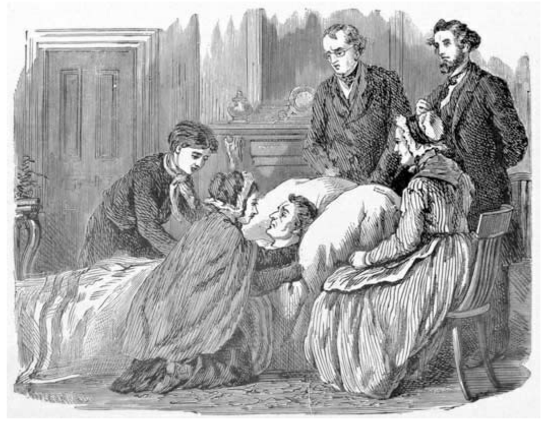
POOR MON PERE.--Page 84.

"Poor mon pere!" exclaimed Maggie, as she threw herself on her knees on the floor by the side of the sick man's couch, and kissed his pale, thin face.