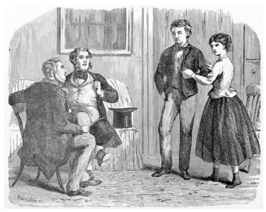
LEO ANSWERS FOR HIMSELF.-Page 248.

The truth as it was had been correctly discerned.