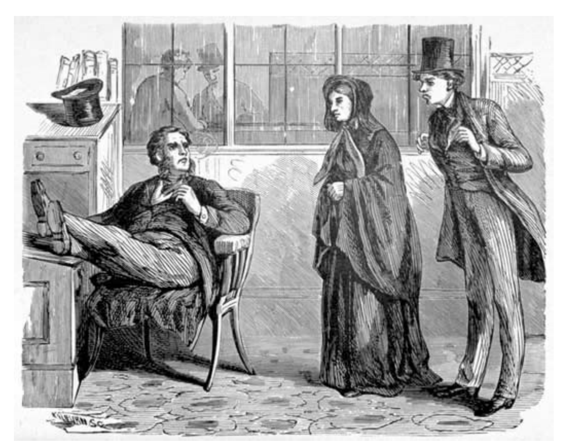
THE BANKER'S PRIVATE OFFICE.—Page 199.