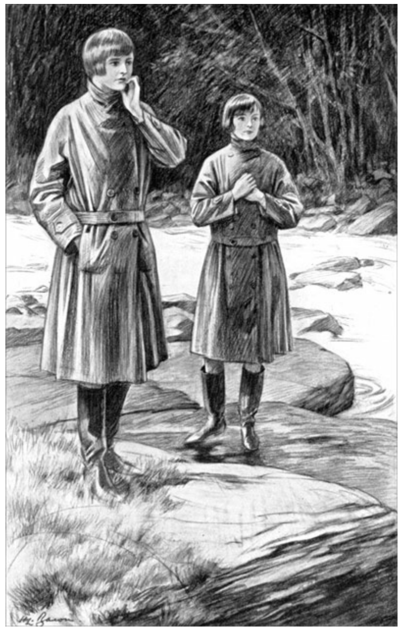
NOT A TRACE OF DERRICK <u>Page 205</u>

"Some rain certainly," agreed the Stripling cheerfully.