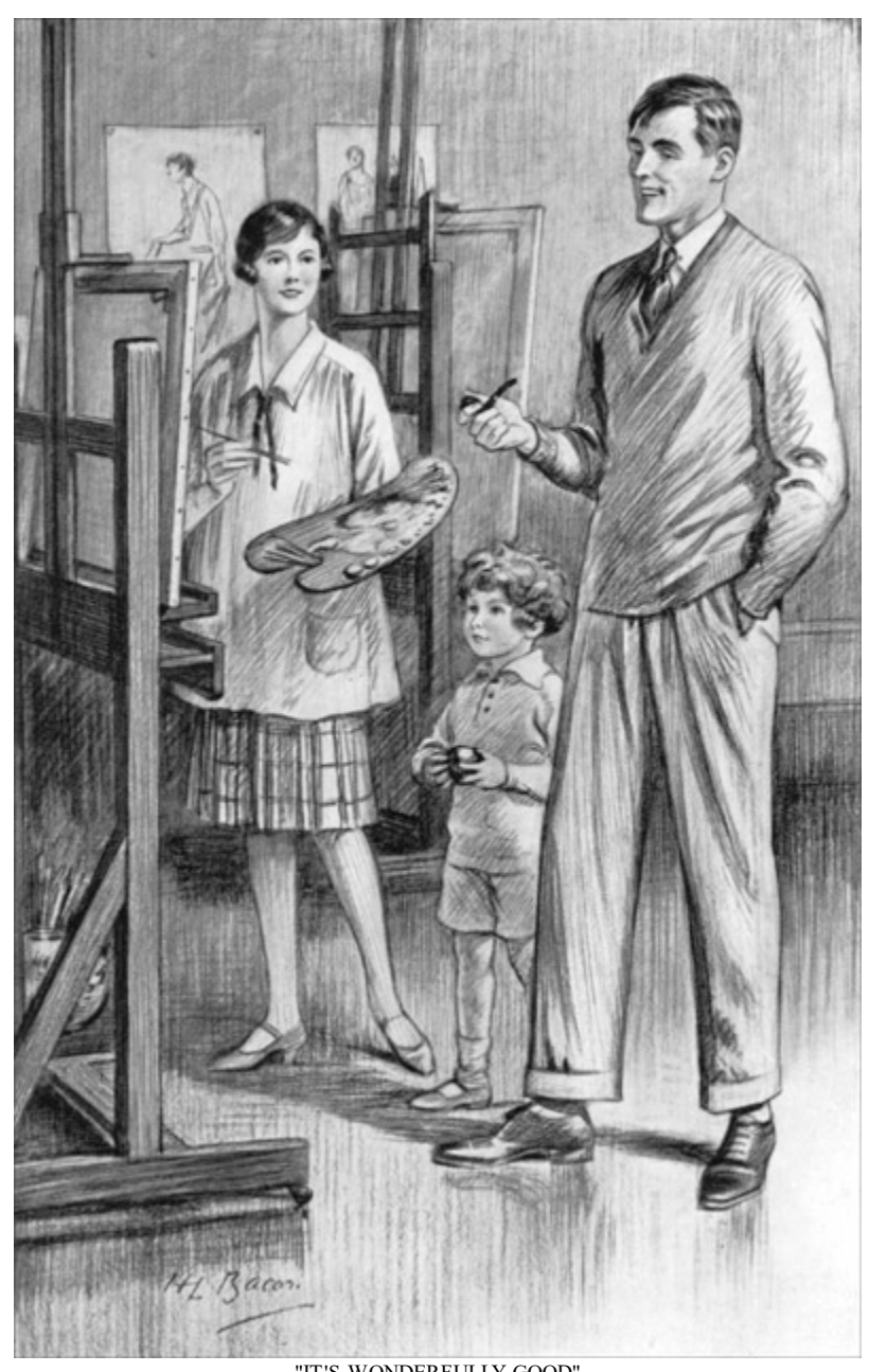
"IT'S WONDERFULLY GOOD" <u>Page 151</u> Frontispiece

BLACKIE & SON (CANADA) LIMITED 1118 Bay Street, Toronto