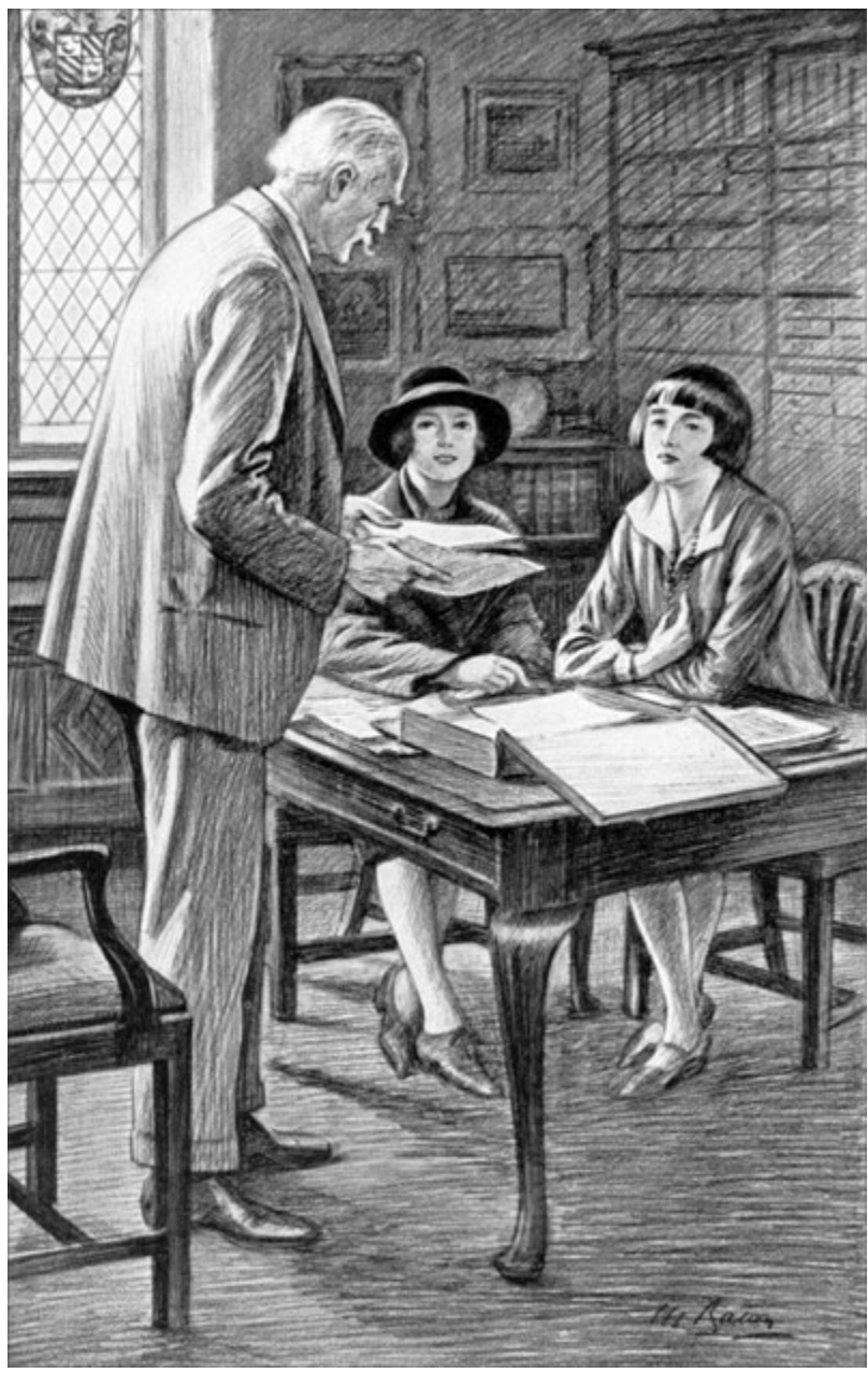
KINDLY INTEREST <u>Page 134</u>

"I'd better go and ask Miss Joyce about it," she decided.