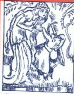
"We must find a boat," said the princess.