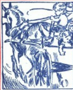
"And away went the old brown horse."