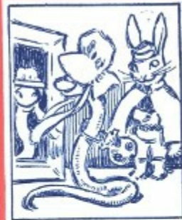
"I will go," laughed the little white snake.