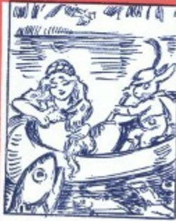
"Give me a lock of your hair."