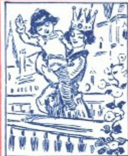
"I can speak," he shouted.