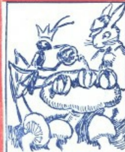
"Tell me where you come from?"