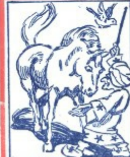
"He shouted 'presto Change!'"