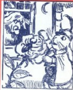
"I want to save your beautiful hair."