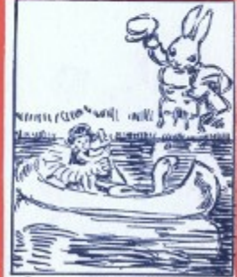
"She crawled into the fairy's boat."