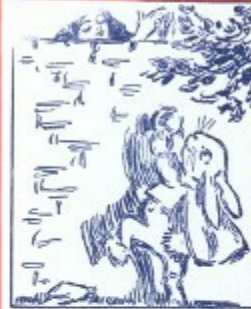
"I can't reach so far!"