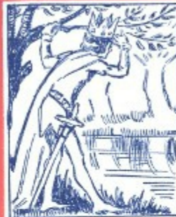
"He stood by the bank."