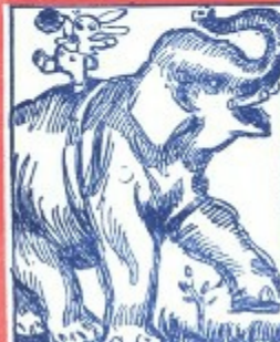
"He gave a loud trumpet and went away."