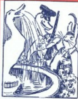
"This is Goose Fountain," said the old seirine!