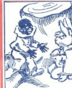
"The little black man appeared."