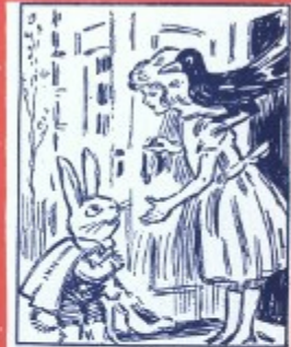
"Come in, little rabbit," she said!