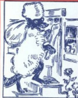
"He knocked on the front door."