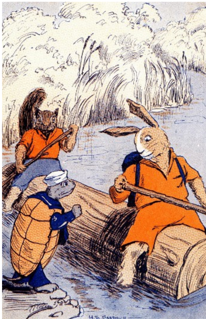
Little Jack and Chippy Chipmunk Meet Teddy Turtle.

"Oh, it's you, is it?" and the little rabbit told Teddy Turtle all about the little snail at the seashore who carries his shell house around with him. "Yes, he takes his little house with him just the way you do."