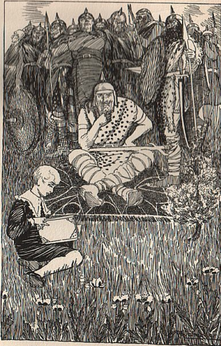
HAROLD BEGAN TO READ FROM THE RED-AND-GOLD BOOK

Long, long ago, in the days when even stranger things befell than we see nowadays, travelers brought news to the little town of Kisington-by-the-Sea. They said that the terrible Dragon of Hushby had wakened again from his fifty years' nap; had crept out of his cave in the mountain, and was terrifying the country as he had done in the grandfathers' times. Already he had destroyed ten horses; had eaten one hundred head of cattle, six fair maidens, and twelve plump little children. Besides which he had killed three brave men who had dared to fight with him. But now no one ventured near the cave where the dreadful creature lived, and the land was filled with horror for which there seemed to be no hope of relief.