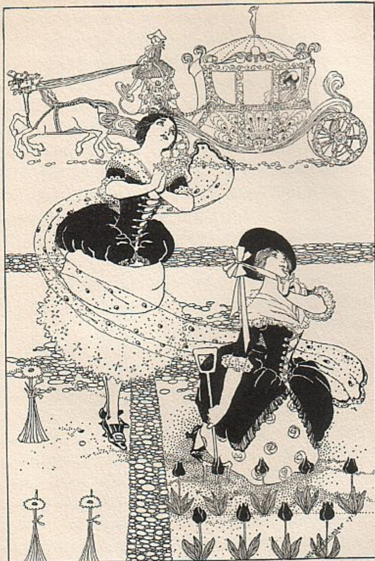
THE MAIDENS WOULD PAUSE TO LOOK AFTER THE GOLDEN COACH

[Illustration: THE MAIDENS WOULD PAUSE TO LOOK AFTER THE GOLDEN COACH]