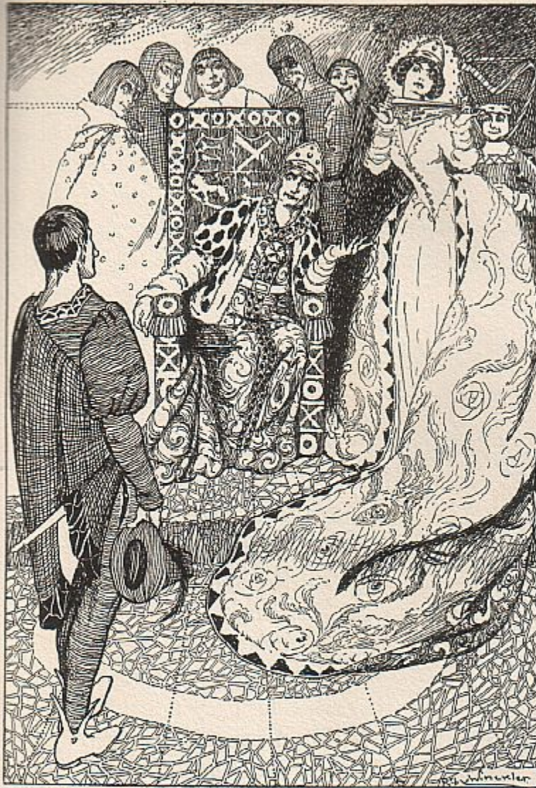
SHE LOOKED BAD-TEMPERED

Proudly Arthur set forth upon the King's errand, with the magic glass in his pocket, and the butterfly-net over his shoulder. A number of merry fellows followed him from the court to see the issue of his mad adventure. For they thought there would be a thing to laugh at ere the end of the matter. They jested with Arthur and gibed pleasantly at him. But he answered them gayly and kept his temper, for he knew that they meant no harm.