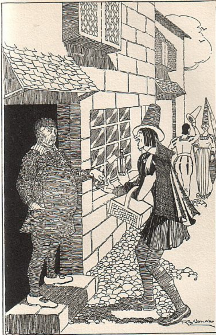
HE STOOD IN THE DOORWAY TALKING WITH THE STRANGER

[Illustration: HE STOOD IN THE DOORWAY TALKING WITH THE STRANGER]