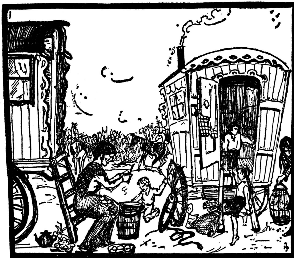
Within the cowboy's van the rat-eyed wife,

From time to time a haggard woman's face Peered at him from a van, and then withdrew;