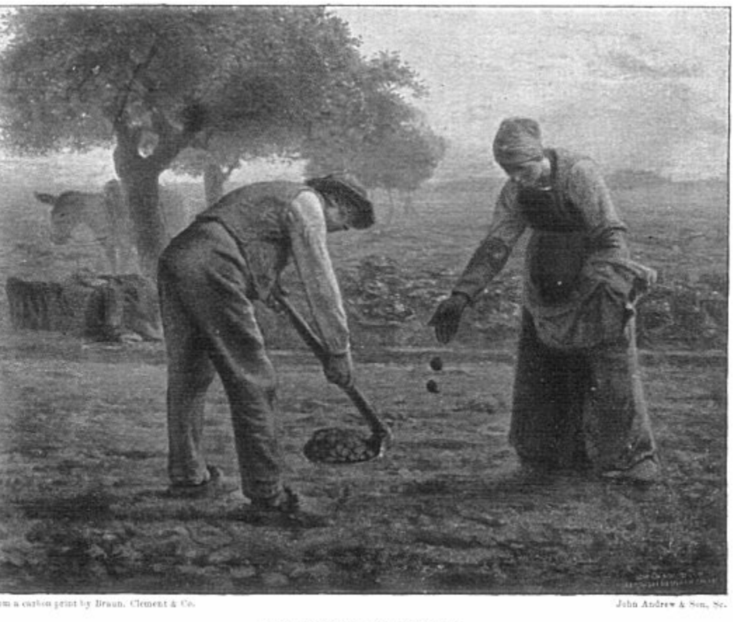
THE POTATO PLANTERS

It is evident, then, that we here see the plain of Barbizon and true Barbizon peasants of Millet's day. The villagers of the painter's acquaintance were on the whole a prosperous class, nearly all owning their houses and a few acres of ground. The big apple-tree under which the donkey rests is just such an one as grew in Millet's own little garden.