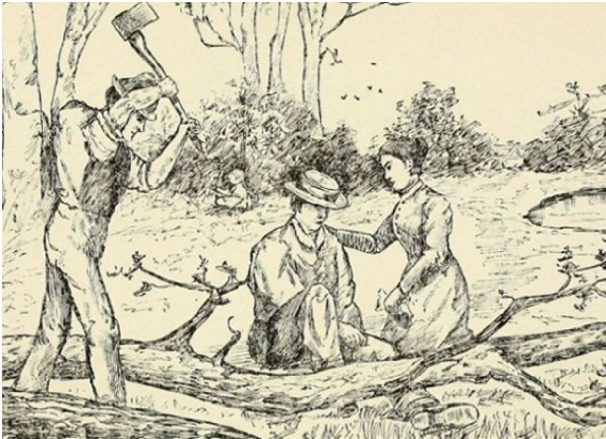
"Where are you hurt, William?" asked Aunt Nancy anxiously.--Page 252.

It required nearly half an hour of the most fatiguing labor to perform the task, and then Jack said as he threw down the axe,--