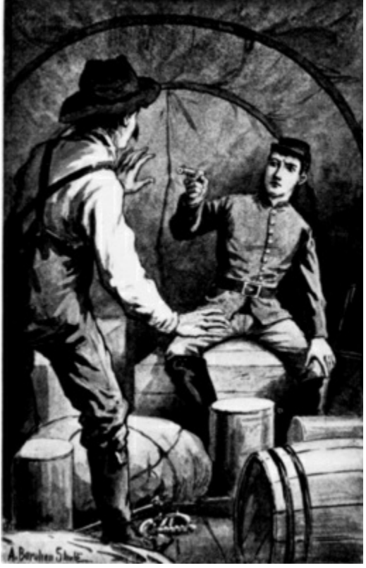
"Halt where you are, Kipps!"

"Don't shoot, sonny! I only wanted to catch you by the hand, and shake it with right good will," replied Kipps, as he halted where the carbine and sabre of the young cavalryman were lying between his two feet. "I b'lieve what you been tellin' on us; and I reckon it's right lucky some on us on this front seat ain't all ready to be put in the ground."