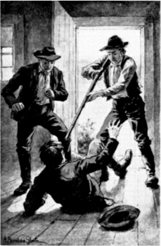
"'Help! Help!' shouted the victim."

The younger brother hastened to obey the order. Finding nothing of the description required, he rushed into the rear room of the house. The pressure of the assailant's hands upon his throat, and the hope of assistance from outside, stimulated the victim to further resistance, for the gun in the hands of Orly no longer threatened him. With a desperate struggle he threw Sandy over backwards, and sprang to his feet. His persecutor picked himself up, and was about to throw himself upon him again. Pickford, who was nearly exhausted by the struggle and the choking, rushed to the open door; and as he was about to pass out he encountered a young man in the uniform of a cavalryman, with a sabre dangling at his side, and a carbine slung on his back.