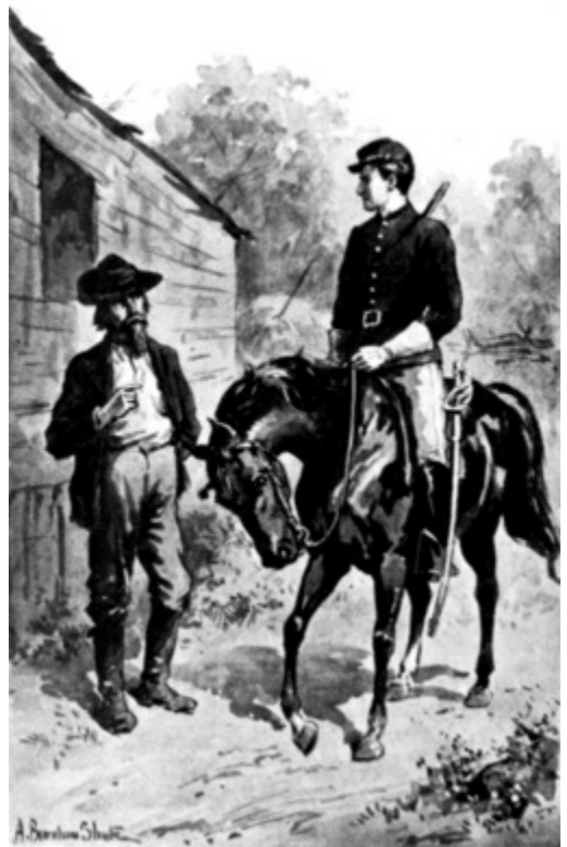
"What are you uns doing here!"

"But if we shut up that road against him, we shall leave the hill road open to him," replied Tom.