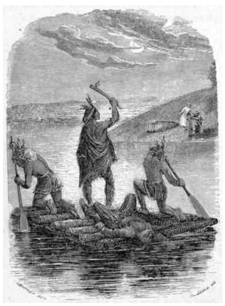
THE NIGHT ATTACK. Page 243.

"The Indians are coming--at least some one is coming, for I heard a paddle on the lake."