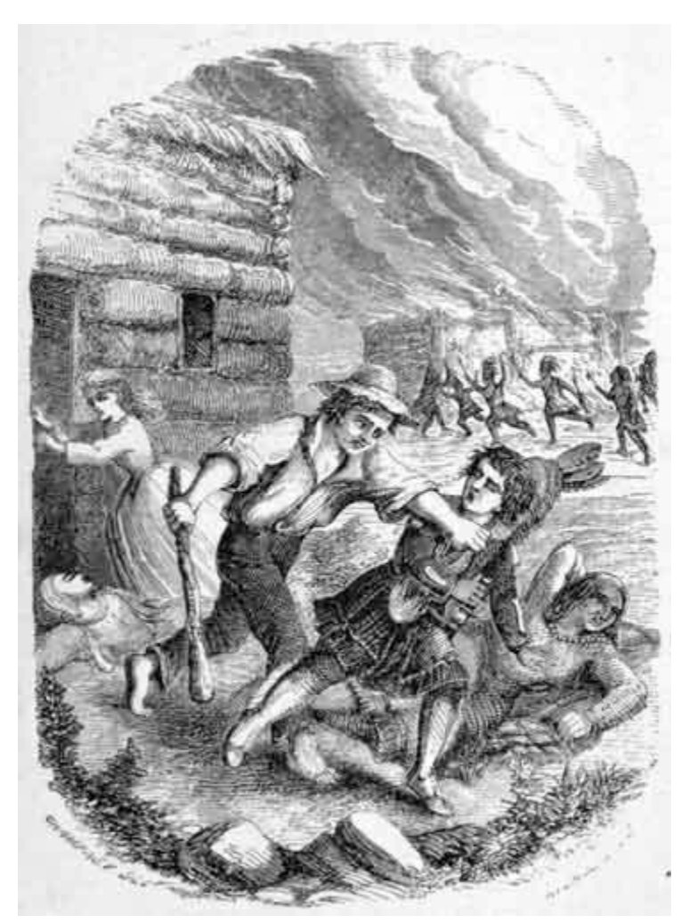
THE CAPTURE OF THE INDIAN BOY. Page 201.