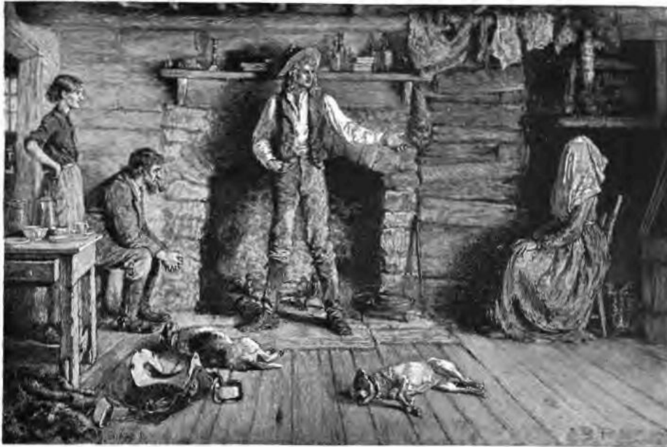
“ SHE FLUNG HER APRON OVER HER HEAD ”

The absence of the baby was not noticed for some time, and when the father's hasty and angry questions elicited the reluctant facts, the outcry for his loss was hardly less bitter among the Kittredges than among the Quimbeys. The fugitives were shielded from capture by the enveloping mist, and when Absalom returned from the search he could do naught but indignantly upbraid his mother.