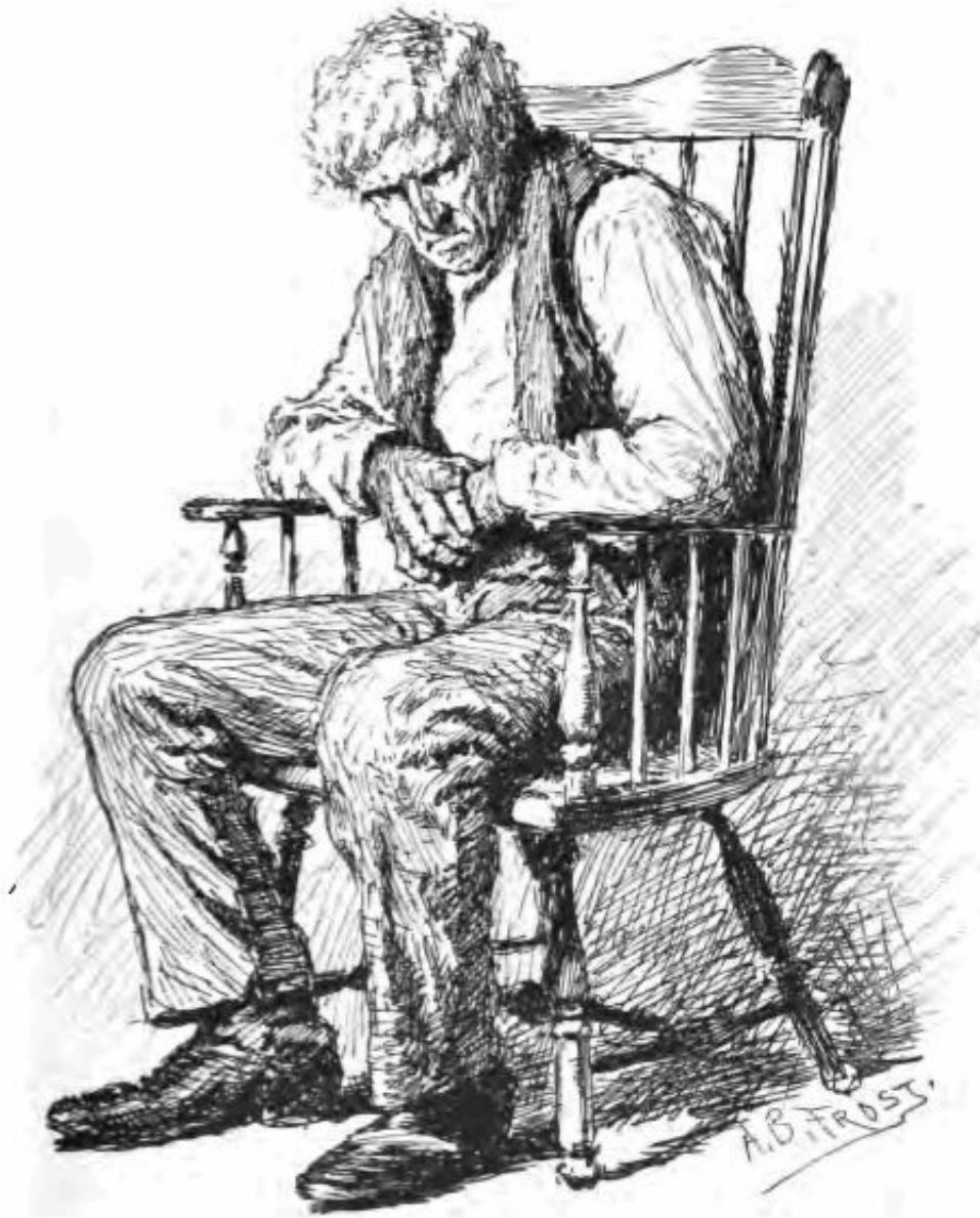
“ OLD JOEL QUIMBEY ”

Old Joel Quimby, in his arm-chair in the chimney-corner, suddenly lifted his head—a thin head with fine white hair, short and sparse, upon it. His thin, lined face was clear-cut, with a pointed chin and an aquiline nose. He maintained an air of indignant and rebellious grief, and had hitherto sat silent, a gnarled and knotted hand on either arm of his chair. His eyes gleamed keenly from under his heavy brows as he turned his face upon his sons. "How could we know thar warn't but one, eh?"