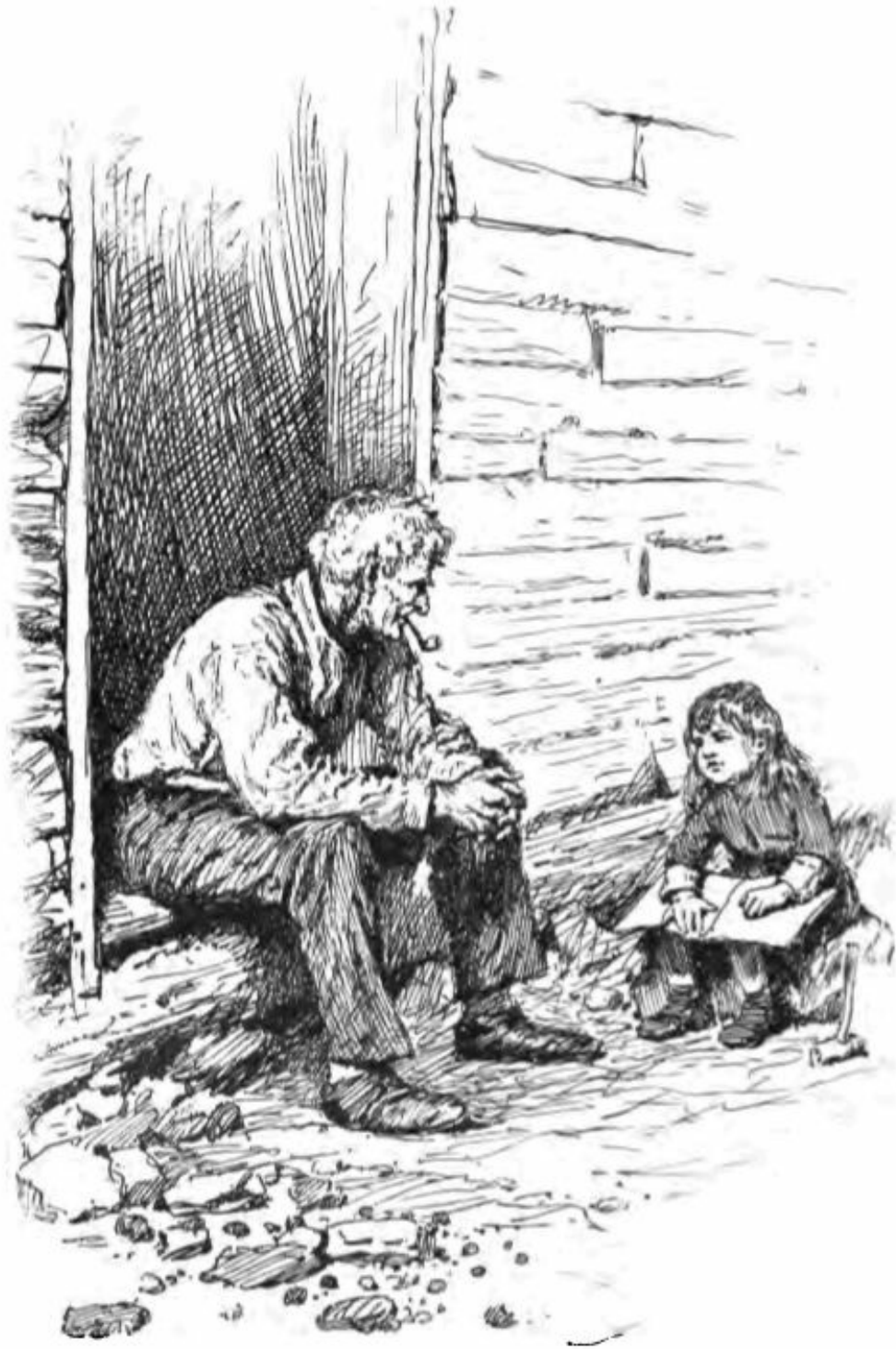
OLD QUIMBEY AND HIS GRANDSON

And when Tim mounted his horse and rode up the mountain with the youngster on the pommel of the saddle, lest Evelina should be out of her mind with fright because of his absence, how should he and old Mrs. Kittredge differ in their respective opinions of his vigorous growth, and grace of countenance, and peartness of manner? On the strength of this concurrence Tim was induced to "light an' hitch," and he even sat on the cabin porch and talked over the crops with Absalom, who, the next time he went to town, stopped at the cabin in the Cove to bring word how El-nathan Daniel was "thrivin'!" The path that Evelina had worn to the crag in those first homesick days on the mountain rapidly extended itself into the Cove, and widened and grew smooth, as the grandfather went up and the grandson came down.