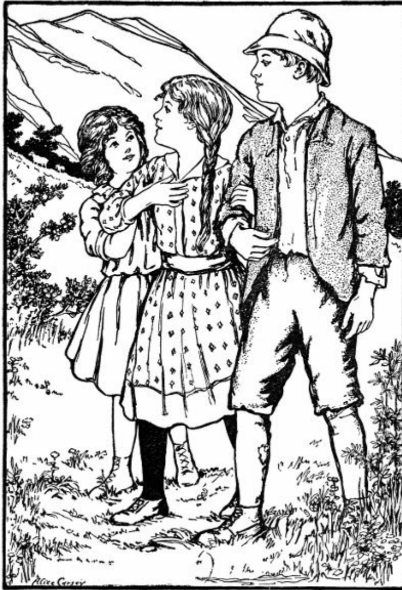
THE LITTLE INVALID FINDS THAT SHE IS ABLE TO WALK