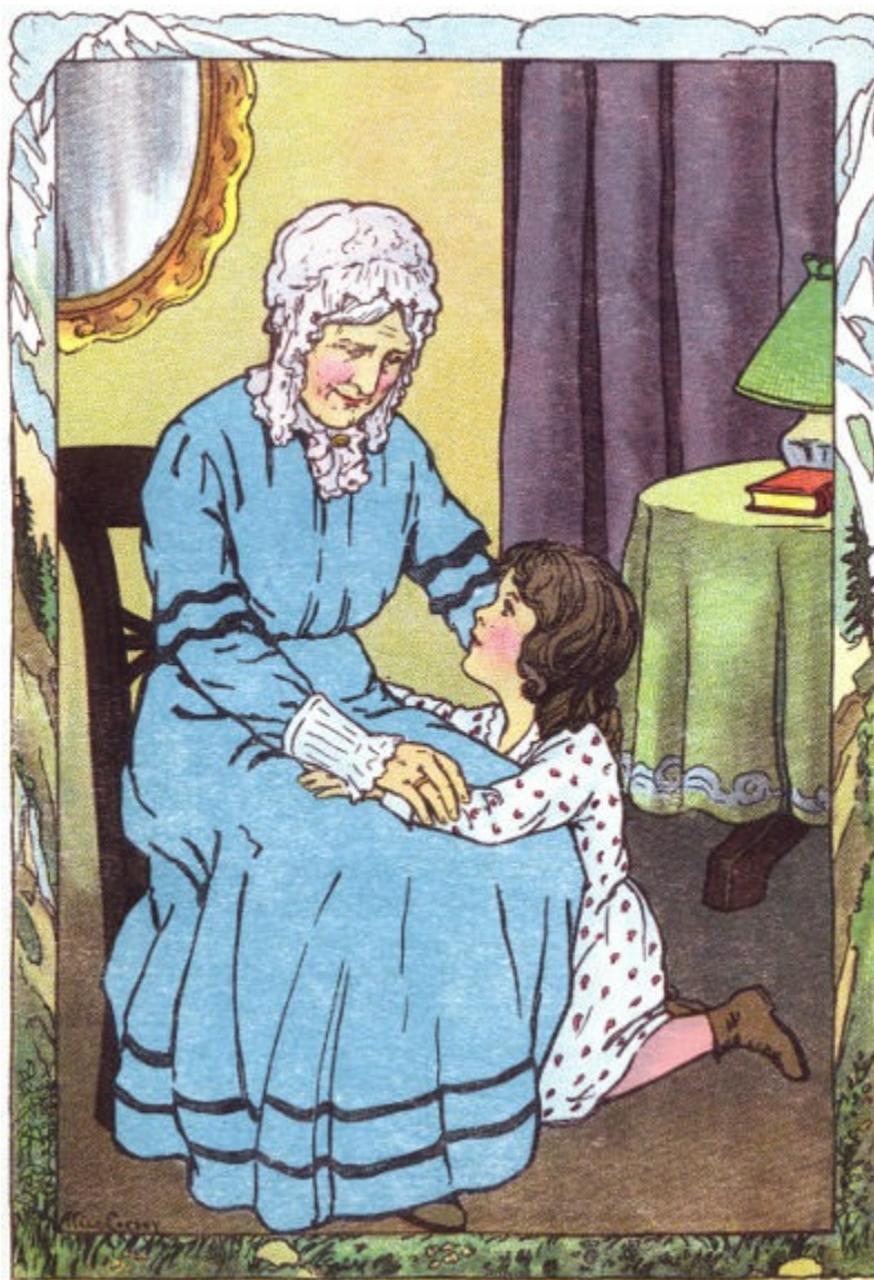
GRANDMOTHER'S KIND ADVICE BRINGS COMFORT TO HEIDI

It was about a week after this that the tutor informed Mrs. Sesemann that Heidi had really learnt to read at last.