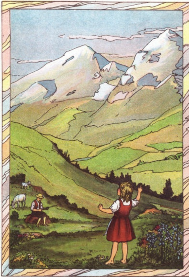
HEIDI DRANK IN THE GOLDEN SUNLIGHT, THE FRESH AIR AND THE SWEET SMELL OF THE FLOWERS

"Yes," replied Peter, "and the two large pieces of bread and cheese are yours also, and when you have drunk up that milk, you are to have another bowlful from the white goat, and then it will be my turn."