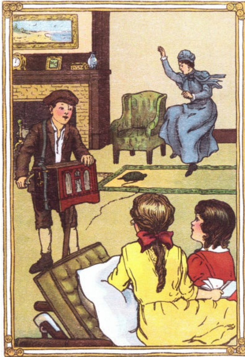
MISS ROTTERMAYER JUMPED HIGHER THAN SHE HAD FOR MANYLONG YEARS

But soon another knock came to the door, and Sebastian again stepped in, this time to say that someone had brought a large basket with orders that it was to be given at once to Miss Clara.