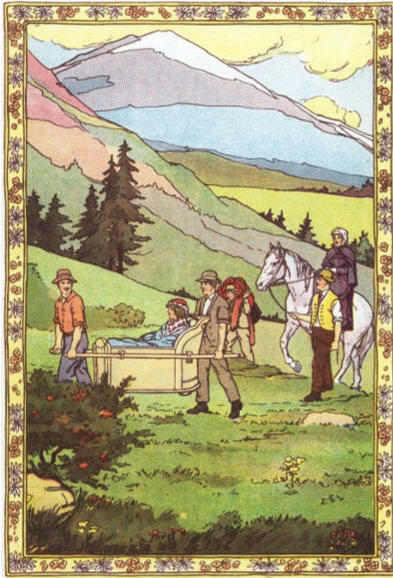
A STRANGE-LOOKING PROCESSION WAS MAKING ITS WAY UP THE MOUNTAIN

Peter was accustomed to give immediate obedience to Uncle, and he marched off with his goats, but with a turn of the head and roll of the eye that showed he had some thought in reserve. The goats carried Heidi along with them a little way, which was what Peter wanted. "You will have to come with them," he called to her, "for I shall be obliged to follow Little Swan."