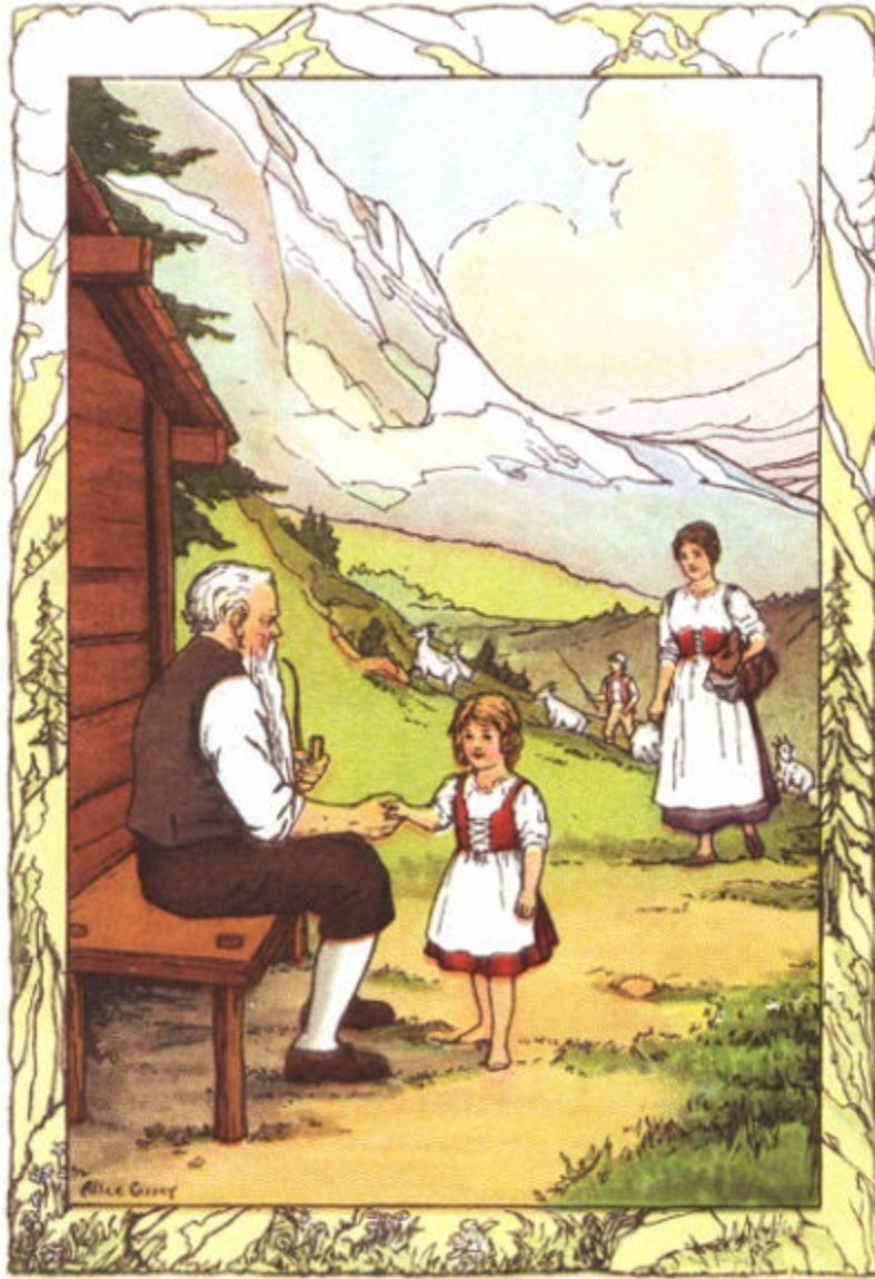
UP THE MOUNTAIN TO GRANDFATHER