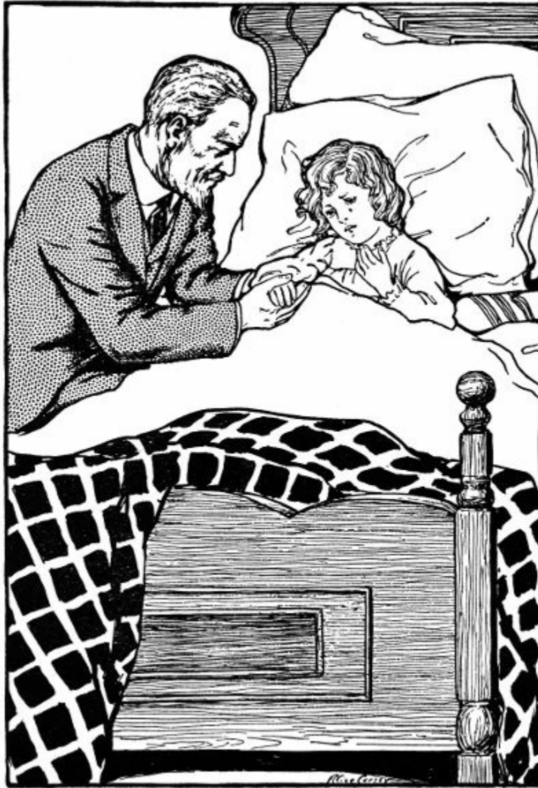
THE DOCTOR DISCOVERS HEIDI'S HOME-SICKNESS

"Yes, I dream every night, and always about the same things. I think I am back with grandfather, and I hear the sound in the fir trees outside, and I see the stars shining so brightly, and then I open the door quickly and run out, and it is all so beautiful! But when I wake I am still in Frankfurt." And Heidi struggled as she spoke to keep back the sobs which seemed to choke her.