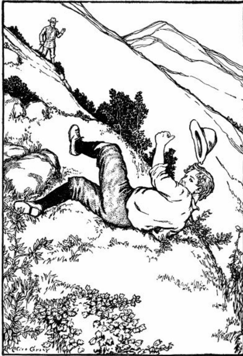
PETER WENT ROLLING AND BUMPING DOWN THE SLOPE

But this was not the most terrible part of his sufferings at the moment, for far worse was the fear and horror that possessed him, feeling sure, as he did now, that the policeman had really come over for him from Frankfurt. He had no doubt at all that the stranger who had asked him the way was the very man himself. Just as he had rolled to the edge of the last high slope above Doerfli he was caught in a bush, and at last able to keep himself from falling any farther. He lay still for a second or two to recover himself, and to think over matters.