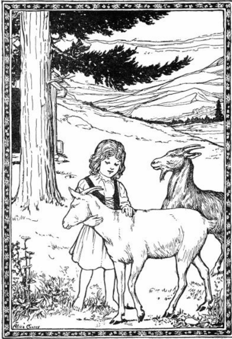
HEIDI TENDERLY STROKED THE TWO GOATS IN TURN

Suddenly a shrill whistle was heard. Down from the heights above, the goats came springing one after another, with Peter in their midst. Heidi sprang forward with a cry of joy and rushed among the flock, greeting first one and then another of her old friends of the morning. As they neared the hut the goats stood still, and then two of their number, two beautiful, slender animals, one white and one brown, ran forward to where the grandfather was standing and began licking his hands, for he was holding a little salt which he always had ready for his goats on their return home. Peter went on down the mountain with the remainder of his flock. Heidi tenderly stroked the two goats in turn, jumping about in her glee at the pretty little animals. "Are they ours, Grandfather? Are they both ours? Are you going to put them in the shed? Will they always stay with us?"