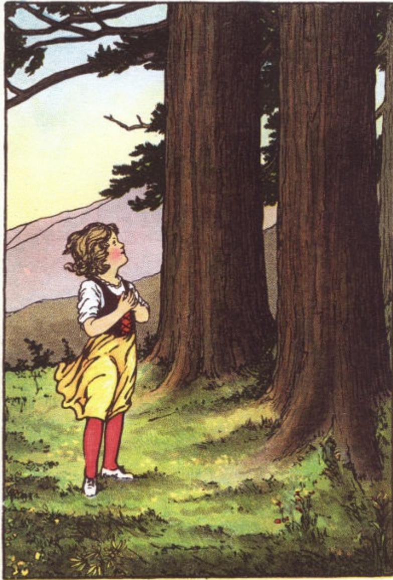
IT WAS NOT LONG BEFORE THE FIR TREES BEGAN THEIR OLD SONG

The doctor was no stranger to the grandfather, for the child had talked to him so much about her friend. The old man held out his hand to his guest in friendly greeting. Then the two men sat down in front of the hut. The doctor whispered to Heidi that there was something being brought up the mountain which had traveled with him from Frankfurt, and which would give her even more pleasure than seeing him. Heidi got into a great state of excitement on hearing this, wondering what it could be. The old man urged the doctor to spend as many of the beautiful autumn days on the mountain as he could, and at least to come up whenever it was fine; he could not offer him a lodging, as he had no place to put him; he advised the doctor, however, not to go back to Ragatz, but to stay at Doerfli, where there was a clean, tidy little inn. Then the doctor could come up every morning, which would do him no end of good, and if he liked, he, the grandfather, would act as his guide to any part of the mountains he would like to see. The doctor was delighted with this proposal, and it was settled that it should be as the grandfather suggested.