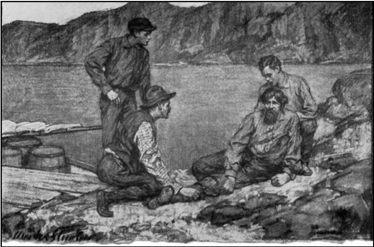
"Aye, feel of un and rub the numbness out!"

"Aye," laughed Davy, "we'll let un come fast as ever you and Pop can lift un."