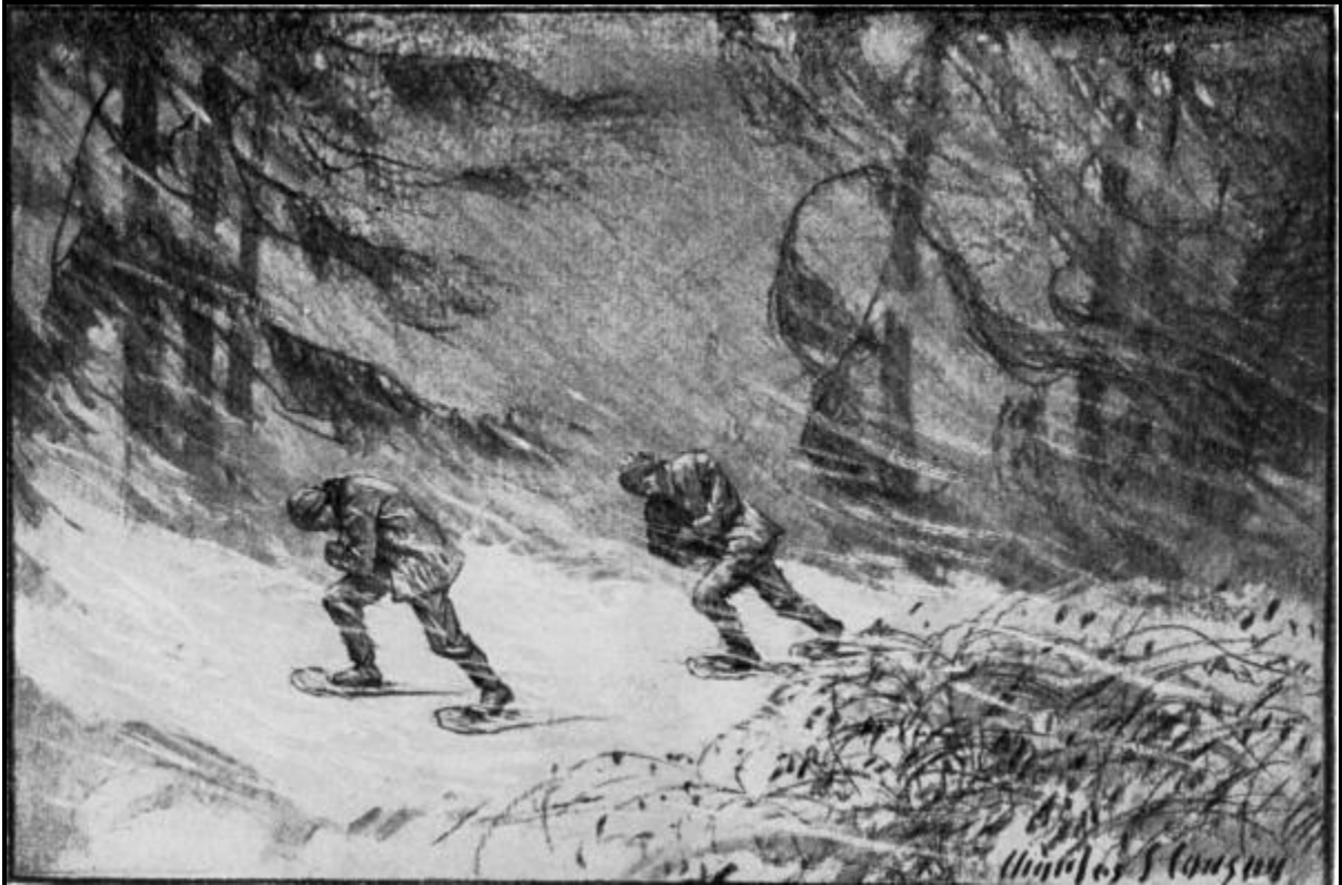
"We've been goin' long enough to be at the tilt," said David

With the end of February and coming of March the cold gradually, though reluctantly, lessened. The animals began again to stir more actively and the traps to yield, as in earlier winter. There were still the storms to contend against, however. They came now with even less warning than formerly, and David and Andy found themselves in many a tight pinch, and had adventures a-plenty, but adventure is the daily portion of the trapper. They suffered with frost-bitten cheeks and noses now and again, but they never thought of this as a hardship. Every one who ventures forth in a Labrador winter expects sooner or later to have frost-bitten cheeks and nose, and seldom is he disappointed.