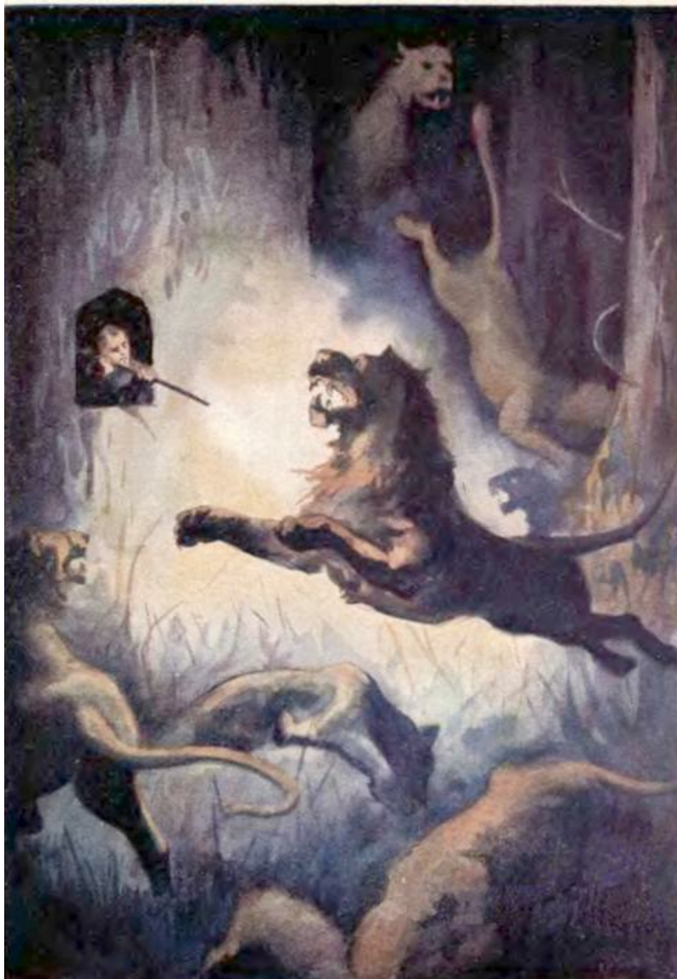
Of lions and tigers quite a score.

There, in the enclosure, roaring with rage, howling at the reports, rolling beneath the bullets which struck many of them, leapt of lions and tigers, and hyaenas and panthers, at least a score. To their roarings and growlings which reverberated from afar, there echoed back those of other ferocious beasts running up to join them. Already the now distant roaring could be heard as they approached the environs of Will Tree. It was as though quite a menagerie of wild animals had been suddenly set free on the island!