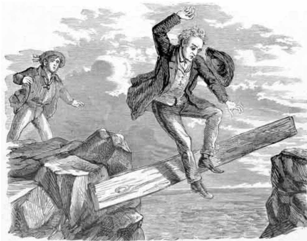
DOCK VINCENT'S VICTIM.—PAGE 54.

"I guess your hips aren't broke; you couldn't stand up if they were," suggested Dock.