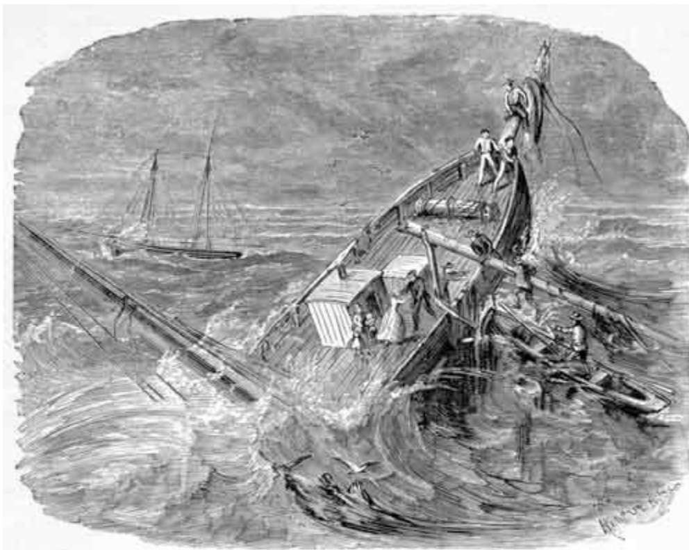
THE WRECK OF THE CARIBBEE.—PAGE 273.