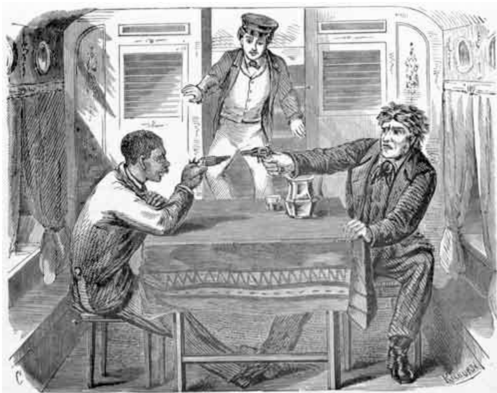
IN THE CABIN OF THE YACHT.--PAGE 182.

"Why don't you fire, Captain Dock Vincent?" taunted the steward. "If you move you are a dead man!"