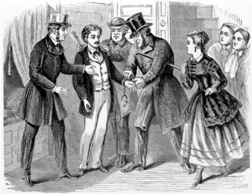
LEVI IN IRONS.—PAGE 96.

Mr. Watson and the ladies were shocked and alarmed; but not one of them for a moment doubted the innocence of Levi, who suffered himself to be ironed without resistance.