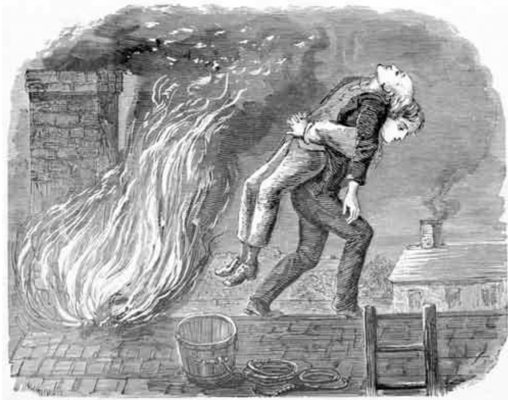
A PERILOUS POSITION.—PAGE 24.

It was not an easy matter to descend the ladder with such a load, though Levi would have carried his uncle down alone if no help had arrived. Before he reached the ladder, two men had mounted the roof, and while one of them was directed to pour water on the fire, the other assisted in bearing the miser down the ladder. He was carried to Mr. Mogmore's house, and aunt Susan followed, having satisfied herself that her husband was not dead, but had fainted.