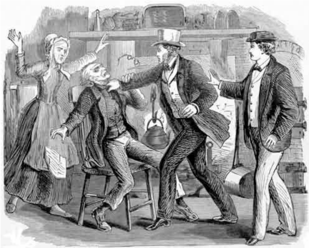
MR. WATSON IS EXCITED.—PAGE 227.

"I tell you I don't know nothin' at all about it. I hain't seen your darter, nor Cap'n Vincent nuther," whimpered the miser.