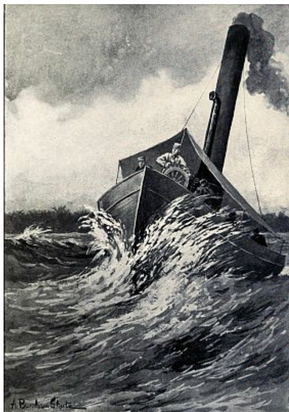
THE BOAT ROSE GRACEFULLY ON THE BILLOWS.

The tide was going out, and they made a quick passage to the sea. On their arrival there they found a stiff south-west wind blowing, and the bay covered with white-caps. They had not tried the Blanchita in anything like a heavy sea, though the rajah had declared that she was a very able and weatherly sea-boat. Captain Scott was very glad of the opportunity to test her behavior in rough weather. He went to the helm himself as the boat came out of the Sadong. The very first wave that broke on her bow scattered the spray from stem to stern.