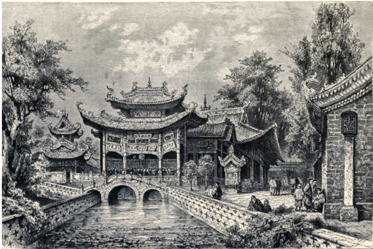
TEMPLE AND GARDEN IN CHINA.

who had been invited to tell the company something about the place. "It is surrounded by a wall nine miles in length, built of brick and sandstone, twenty-five to forty feet high, and twenty feet thick, and divided by a partition wall into two unequal parts. There are twelve outer gates, and also gates in the partition wall. The names of these are curious, as Great Peace Gate, Eternal Rest Gate, and others like them. There are more than six hundred streets, lanes you will call them; for they are not often more than eight feet wide, very crooked, and very dirty. This is the general idea of the city, and the details you will see for yourselves."