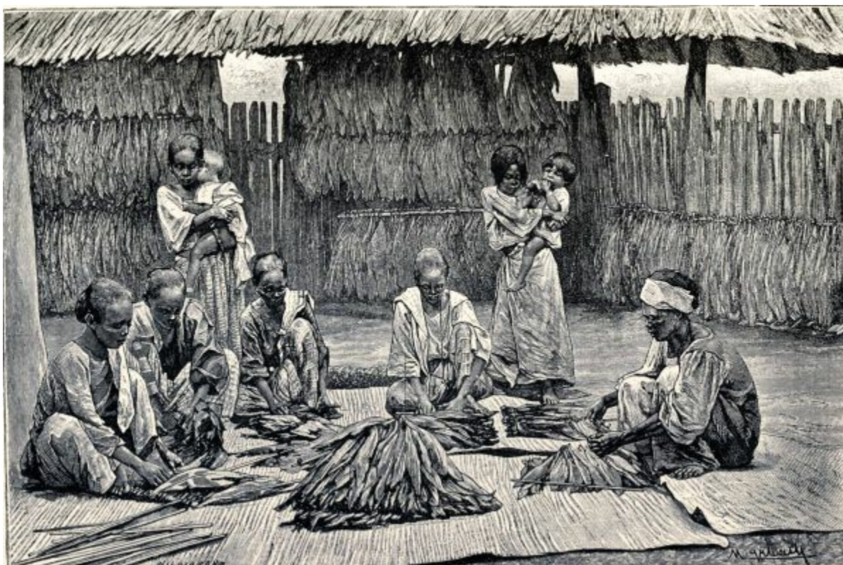
NATIVES PREPARING TOBACCO IN MANILA.

The consuls then conducted the party to a stand for carriages, and enough of them were engaged to accommodate all. They were taken for two hours, with the proviso that the passengers were to be set down at the landing by the bridge.