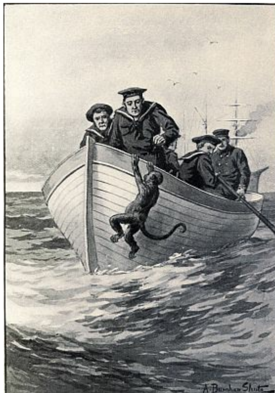
SHE MADE A VIGOROUS LEAP INTO THE FORE-SHEETS.

The ship went along as before; and when the passengers turned out the next morning Manila was in sight, and not five miles distant.