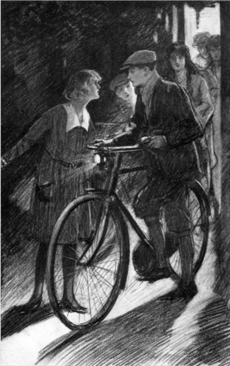
WHO COULD SAY HOW MUCH MIGHT DEPEND ON THEIR SPEED?

"I'm afraid it's no use in a court of law, Pamela," said Captain Harper, as he showed her the copy of the paper. "It's the merest scrap. By imagining the missing words we might make it into something like this; but imagination won't give it legal value. Here's what I fancy it may have been:"