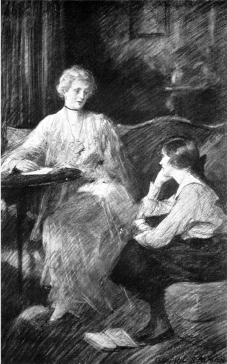
AVELYN AND THE LAVENDER LADY

"And Gideon said, 'Wherewithal shall I save Israel? I am the least in my father's house'," quoted Miss Carrington. "On the contrary, I think it's the chance of a lifetime. I believe you're the one girl to do it. It would be something worth accomplishing, wouldn't it, to unite the school?"