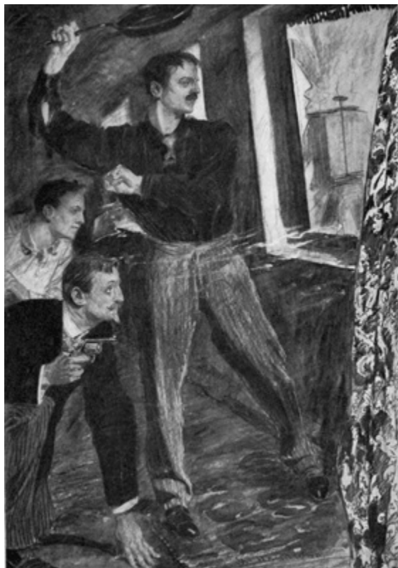
Brissac hurled the skillet like a clumsy discus

Then he sprang afoot, secured his ax, and sent Brissac to the pantry to rummage for other weapons. "A rush is the next thing in order," he suggested; and they prepared as they could to meet it.