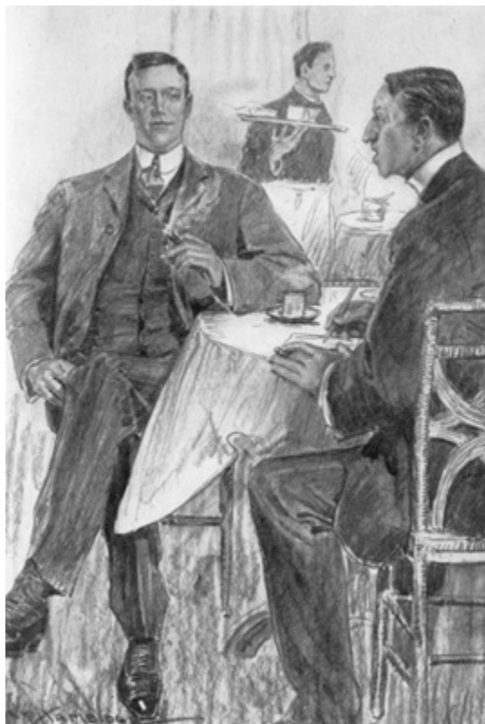
Eckstein's pencil had stopped and he was gasping for breath

"Why not?" was the cool inquiry. "You said it was perfectly legitimate, didn't you?"