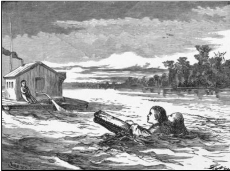
AFTER THE EXPLOSION.—Page 221.

He stood there, jumping up and down on both feet, bewildered and helpless.