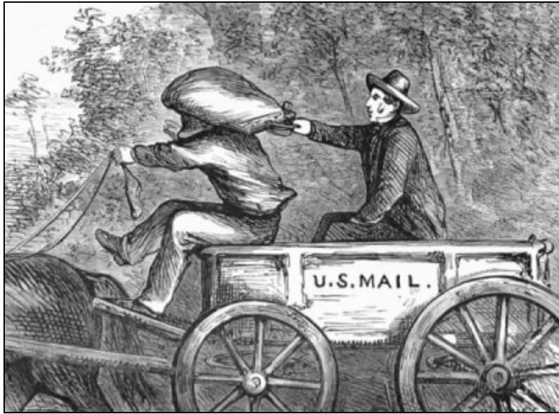
THE SETTLEMENT.—Page 52.