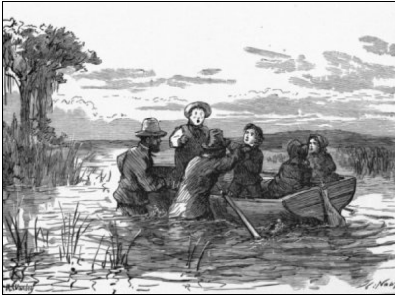
THE ARREST OF BUCK BRADFORD.—Page 277.

After breakfast we embarked, with a plentiful supply of luncheon on board, for we did not mean to return till the middle of the afternoon. I proposed to go up the creek, and then up the branch to the swamp, where we had started on our long voyage upon the raft. Sim and I pulled cheerfully, and our passengers were delighted with the trip. We entered the gloomy swamp; but the river had fallen, so that its banks were no longer covered with water. I showed Emily the place where Sim and I had built the raft. We landed, and walked up the slope far enough for her to see the house and store of the Fishleys. In the cool shade of the swamp we lunched, and enjoyed ourselves to the utmost. My fair companion was an interested listener, and wished to know every particular in regard to the raft, which had been the means of saving her life.