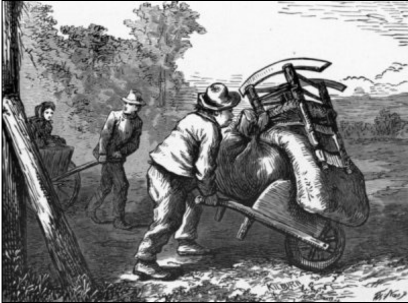
DOWN THE RIVER.—Page 178.

FIRST steps are always full of interest, at least to those who take them; and, as I look back upon the eventful time when our little procession left the back of the barn, it looms up as the most exciting moment of my life, if I except the instant when I was struggling with Sim Gwynn in the water. I was leaving the only home I had known for years, and was going on a strange voyage down the river on a raft. I shall not soon forget the emotions which agitated me.