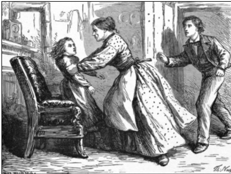
SHE RUSHED TOWARDS FLORA.—Page 22.

As she did not tell me what she should like to know, I did not tell her. I stood upon the defensive between the virago and my sister's chair.