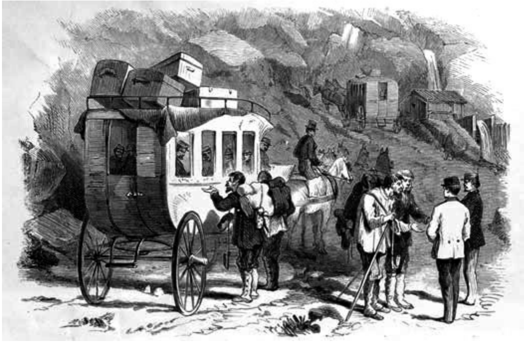
THE TRAVELLING JOURNEYMEN.—PAGE 217.