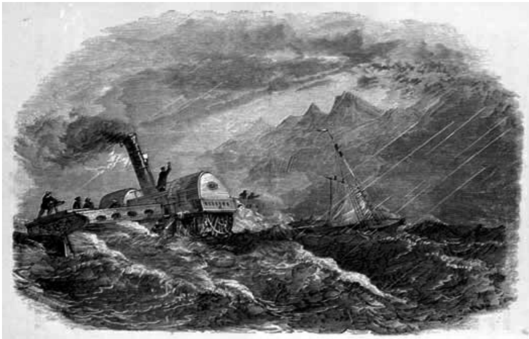
THE ADVENTURE ON LAKE CONSTANZE.—PAGE 227.

"The lake is forty-four miles long and nine miles wide. Its greatest depth is nine hundred and sixty-four feet. Its waters are dark-green in color, and very clear. Twenty-five different kinds of fish are mentioned as caught in the lake. It is navigated by steamers, eight or ten of which ply between the various ports, and carry on considerable commerce. It is thirteen hundred and forty-four feet above the level of the sea.