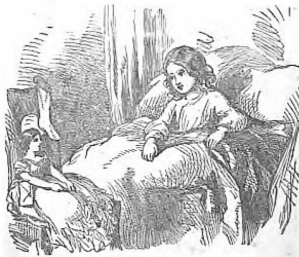
The Christmas Present.

Nellie said she would not say it again, only she wanted to have Miss Fanny do just as the big folks did. And so they played all the afternoon, though Lady Jane did not honor them with her company. All the dollies paid lots of visits; and Flora went home.