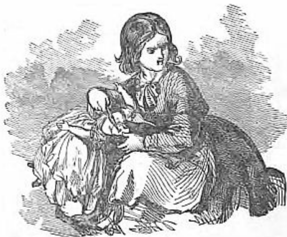
What Katy did.