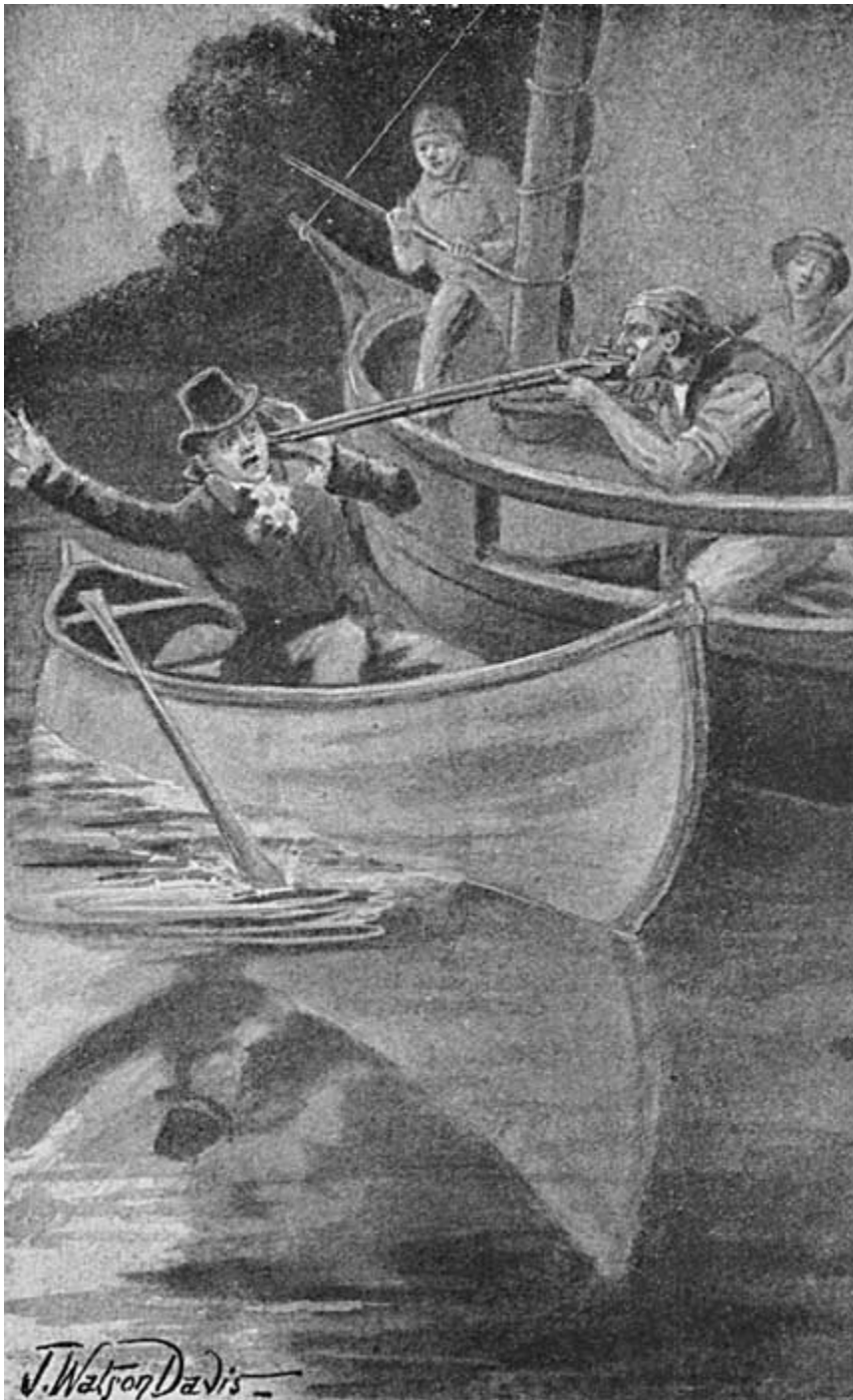
"Pass up your painter, or I'll shoot!" Cried Darius. Page 56.

Five minutes later our prisoner was snugly stowed aft, near the cabin bulkhead, and we had brought the pungy to anchor lest she over-run the port we counted on making.