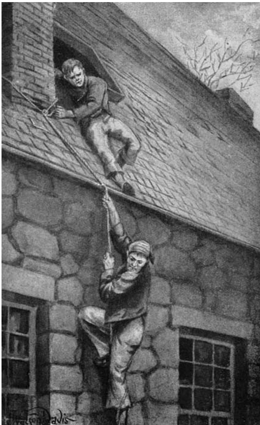
As soon as the line was made fast a man slipped down quickly followed by another. P. 335.

My comrades were ready for the work on hand immediately I gave the alarm, and swiftly the three of us crossed over, I wondering if it would be possible for us to throw the rope to the roof where the sailors could catch it.