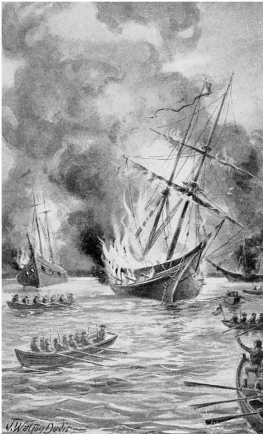
As we pulled away I glanced back at our fleet and saw that the vessels were well on fire. P. 233.

"Have your canoe ready!" the old man cried, addressing Dody Wardwell, who was holding the painter of a small craft which lay under the stern. "I allow that we'll need to leave here in mighty quick time, for when the fire starts it'll run from stem to stern like a flash."