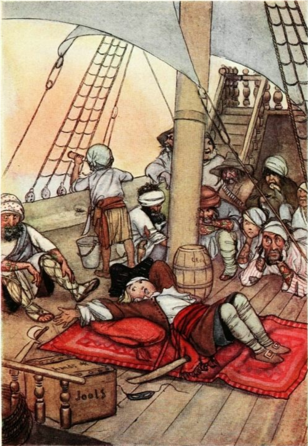
"His crew lay grouped around him"