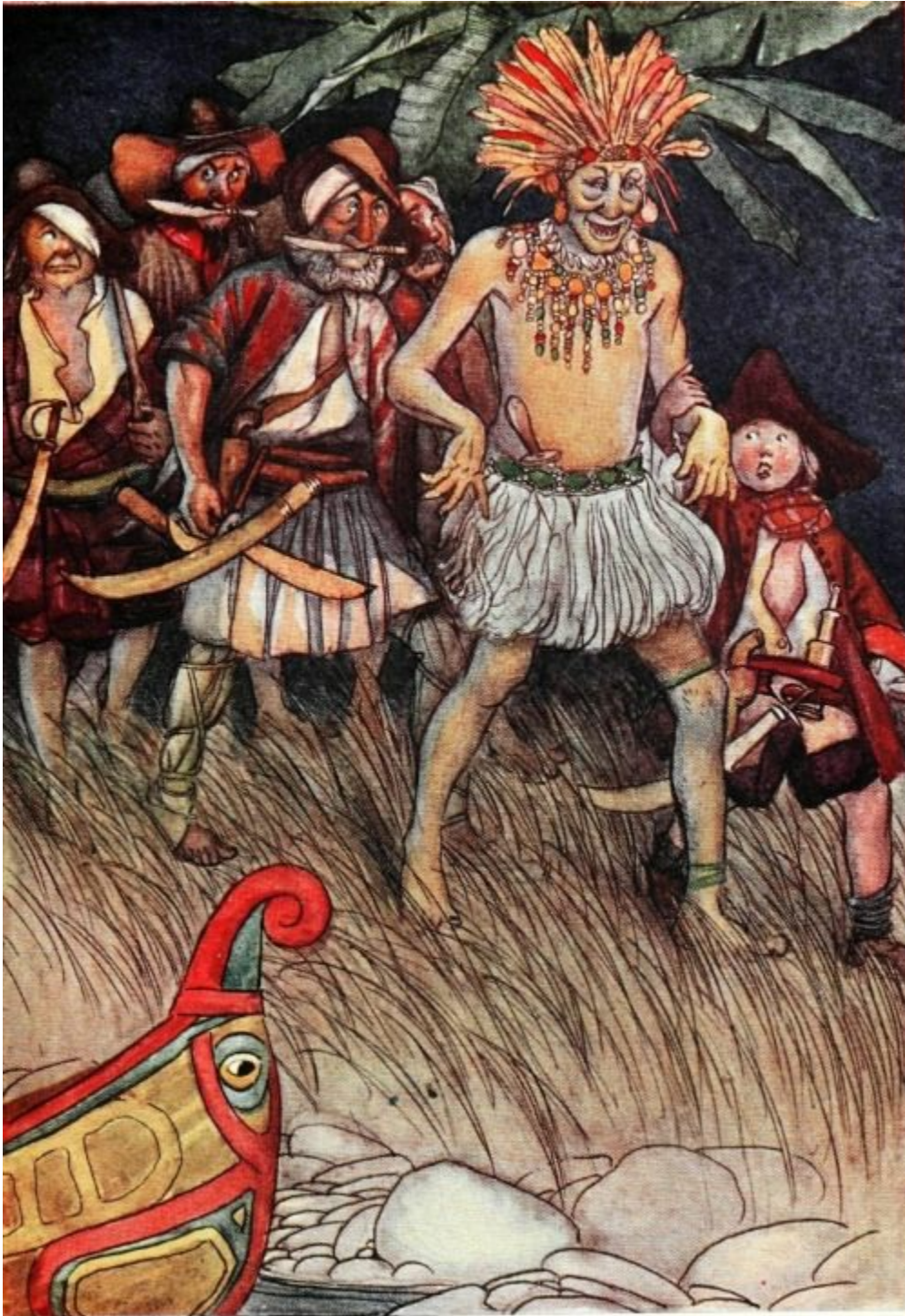
"Arm-in-arm with the Chief"

Turtles and oysters were now produced in astonishing numbers, and on these and yams the people made a hearty meal. After dinner the Chief told Captain Boldheart that there was better feeding up at the village, and that he would be glad to take him and his officers there. Apprehensive of treachery, Boldheart ordered his boat's crew to attend him completely armed. And well were it for other commanders if their precautions-