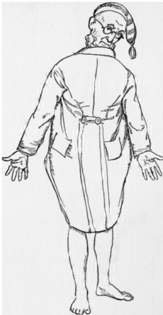
"The Latin-Grammar-Master Had A Spare Nightcap Lent Him And A Longtail Coat Which He Wore Hind Side Before."

The ringing voice of Boldheart was lost in the report of the guns and the screeching of the savages. Volley after volley awakened the numerous echoes. Hundreds of savages were killed, hundreds wounded, and thousands ran howling into the woods. The Latin-Grammar-Master had a spare night-cap lent him, and a longtail coat which he wore hind side before. He presented a ludicrous though pitiable appearance, and serve him right.