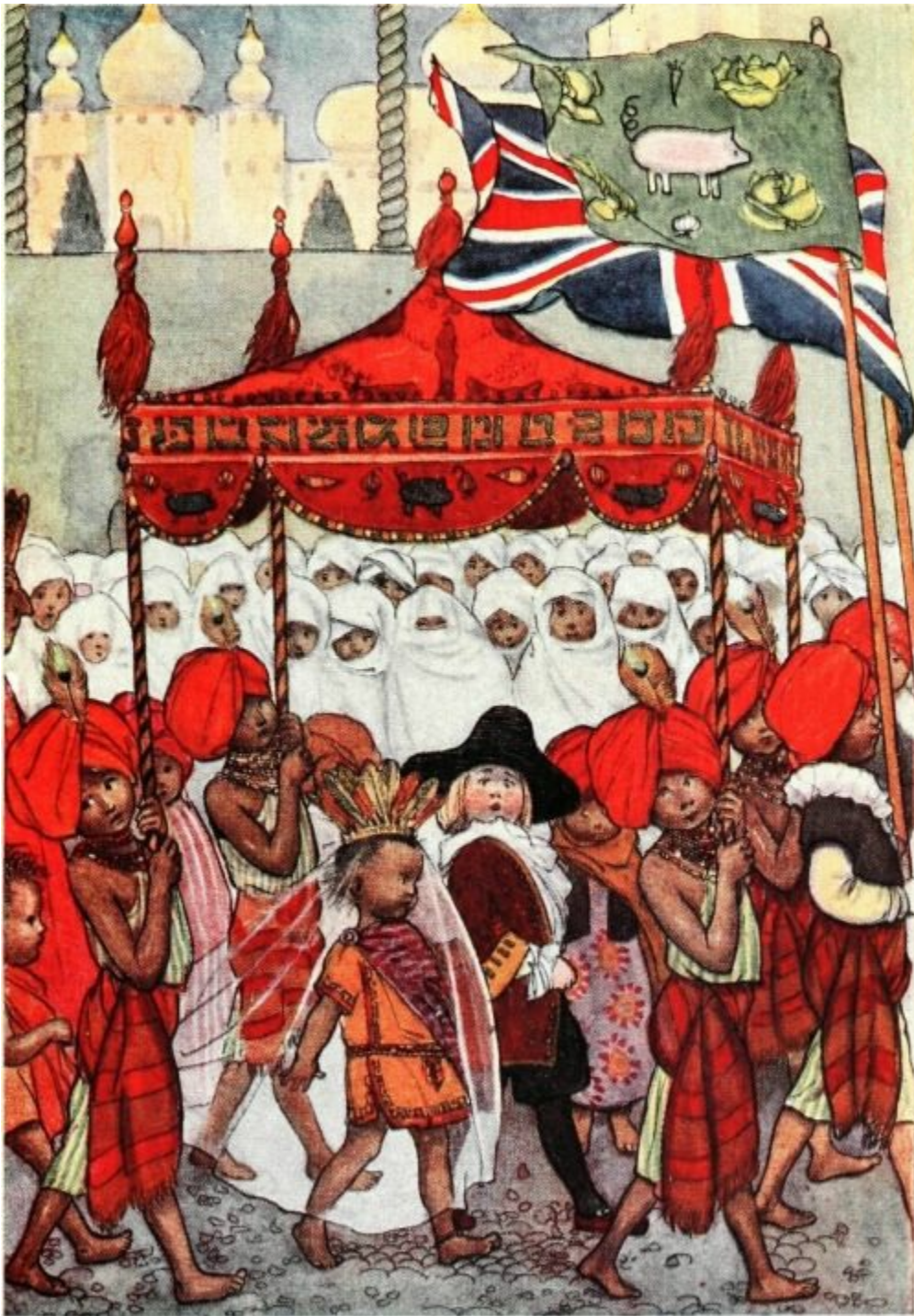
"Married the Chief's daughter"

Inferring from this, that his father had put to sea to seek his long-lost son, the captain sent his own boat on board the stranger, to inquire if this was so, and if so, whether his father's intentions were strictly honourable. The boat came back with a present of greens and fresh meat, and reported that the stranger was The Family of twelve hundred tons, and had not only the captain's father on board, but also his mother, with the majority of his aunts and uncles, and all his cousins. It was further reported to Boldheart that the