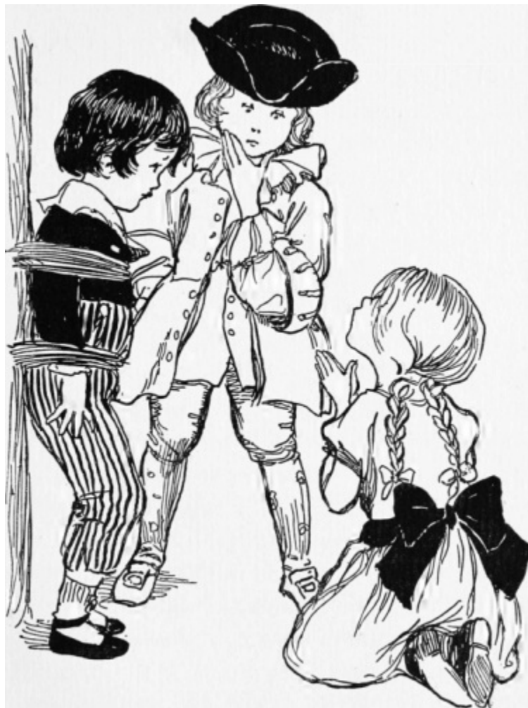
"Captain Boldheart's Lady Begged For Him And He Was Spared."

Only one thing further happened before the good ship Family was dismissed, with rich presents to all on board. It is painful to record (but such is human nature in some cousins) that Captain Boldheart's unmannerly cousin Tom was actually tied up to receive three dozen with a rope's end "for cheekyness and making games," when Captain Boldheart's lady begged for him and he was spared. The Beauty then refitted, and the Captain and his Bride departed for the Indian Ocean to enjoy themselves for evermore.