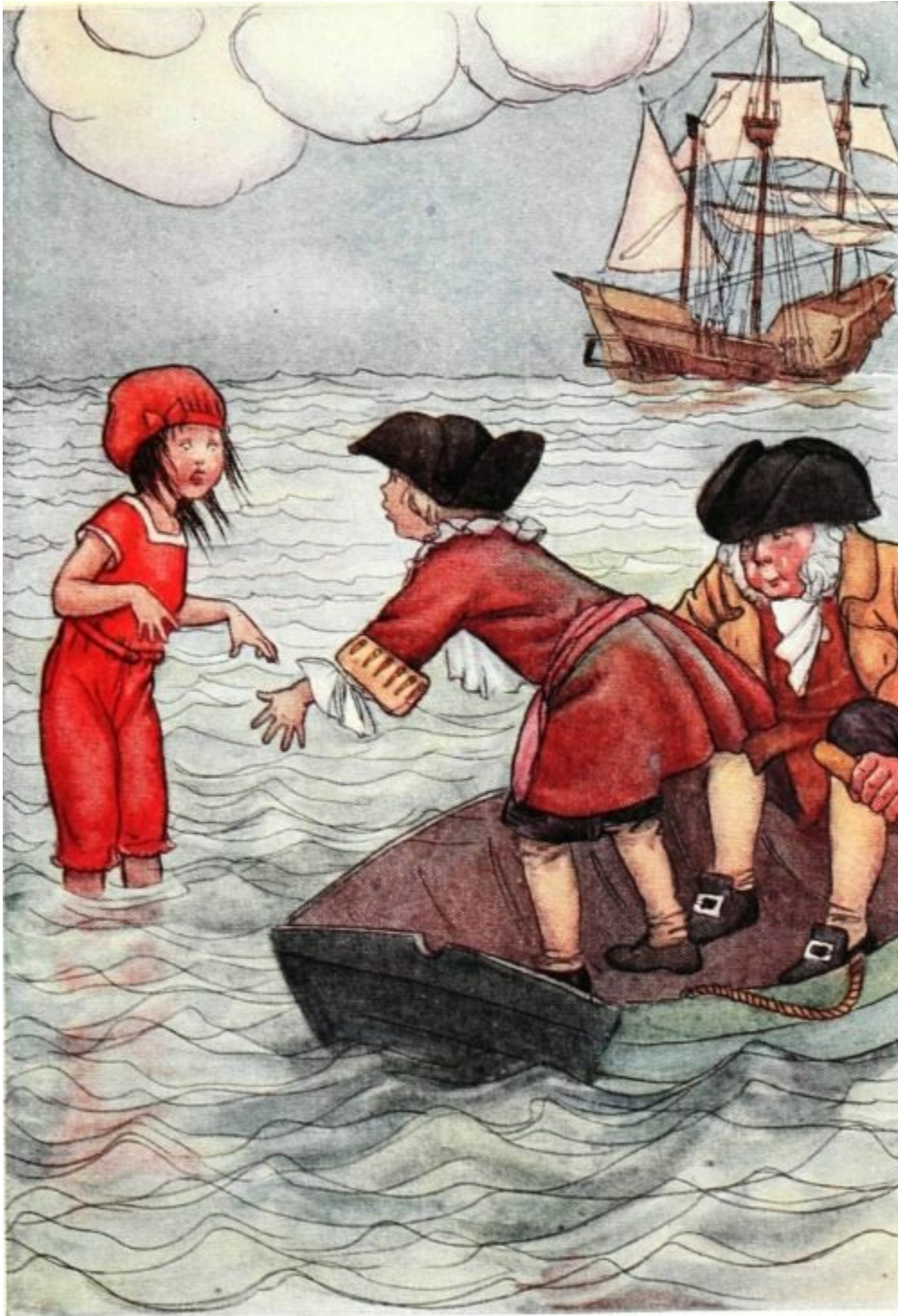
"His lovely Bride came forth"

"Captain," said the Mayor, "I have ascertained that the young lady is going to bathe. Even now she waits her turn for a machine. The tide is low, though rising. I, in one of our town-boats, shall not be suspected. When she comes forth in her bathing-dress into the shallow water from behind the hood of the machine, my boat shall intercept her and prevent her return. Do you the rest."