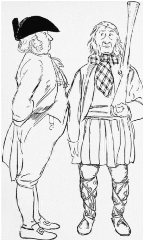
Standing Sentry Over Him

The Mayor begged for two hours' grace, in which to make inquiries respecting the young lady. Boldheart accorded him but one; and during that one placed William Boozey sentry over him, with a drawn sword and instructions to accompany him wherever he went, and to run him through the body if he showed a sign of playing false.