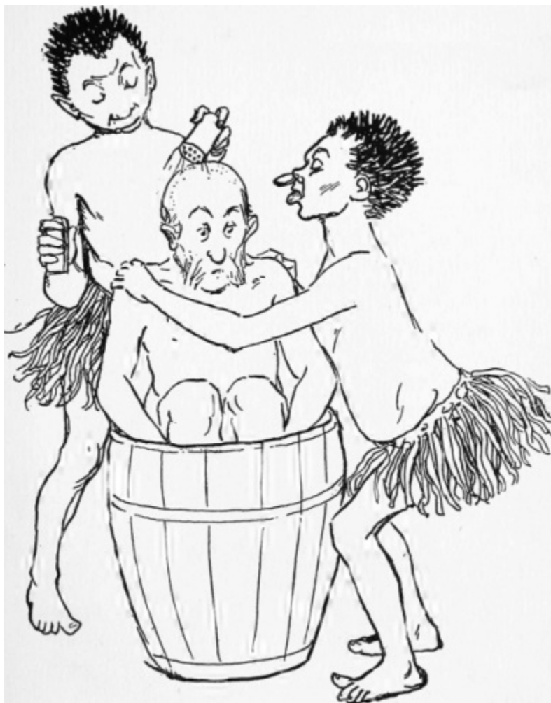
"Two Savages Floured Him Before Putting Him To The Fire."

When the canoes arrived at the beach, the darkness of the night was illumined by the light of an immense fire. Ordering his boat's crew (with the intrepid though illiterate William at their head) to keep close and be upon their guard, Boldheart bravely went on, arm-in-arm with the Chief.