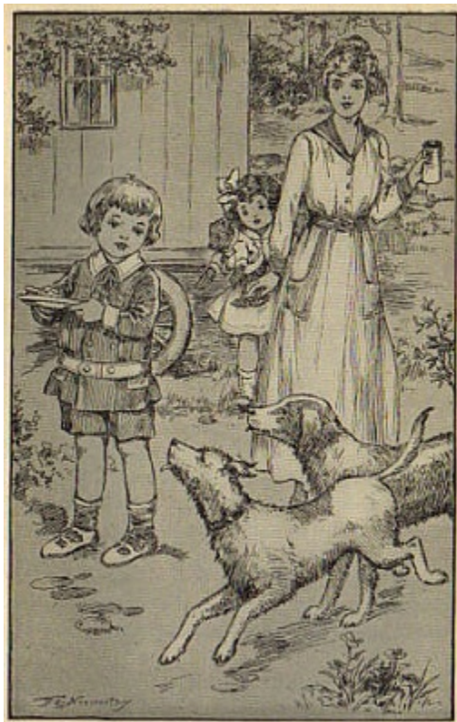
THE TWO DOGS CAME WITH A RUSH.

Bunny Brown and His Sister Sue on an Auto Tour. Page 79.