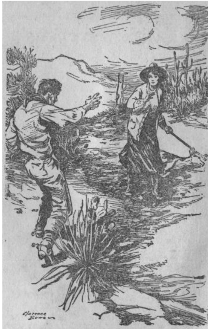
WHO ARE YOU? WATER! HE GASPED. Page 20.