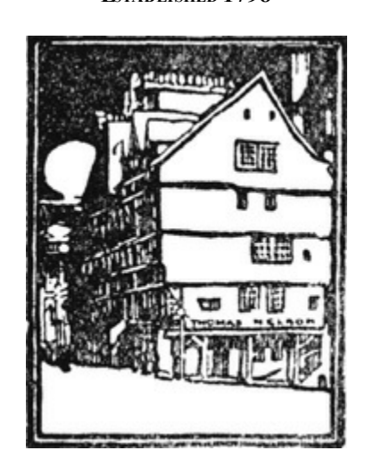
T. NELSON & SONS, Ltd. PRINTERS AND PUBLISHERS