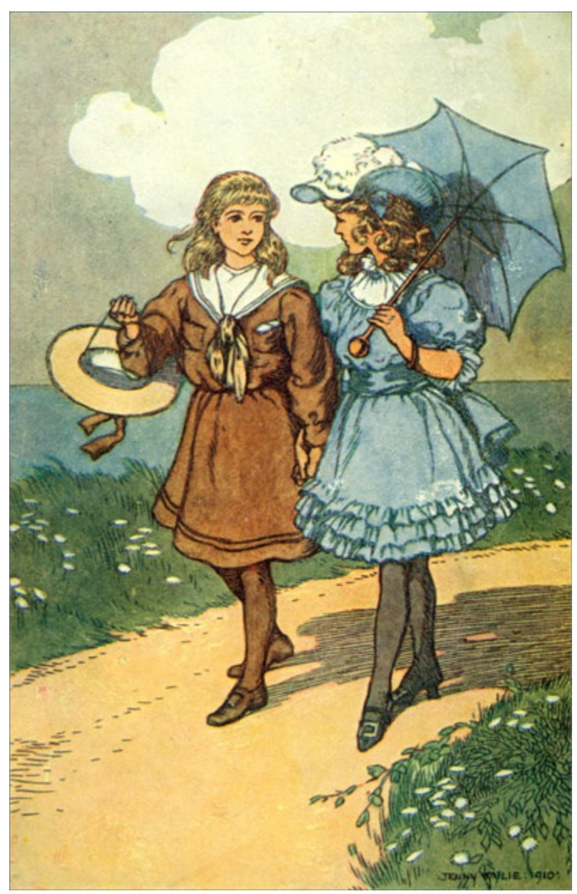
The namesakes (page 48).