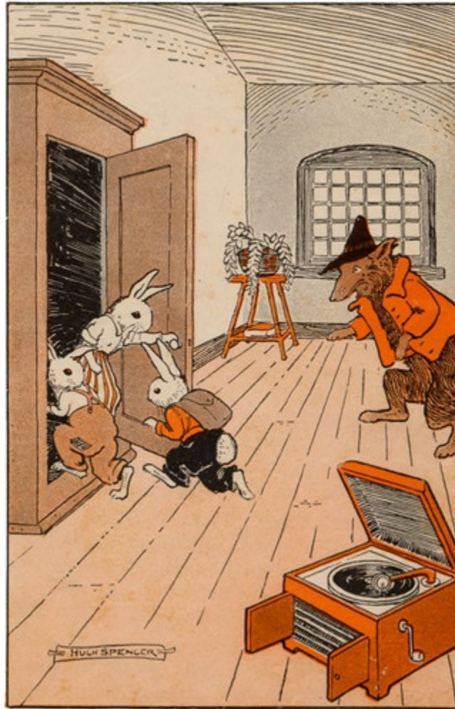
THE RABBITS JUMPED INTO THE CUPBOARD AND CLOSED THE DOOR.

Well, sir, this was a very cheap price, don't you think so? And Billy Bunny thought so, too, for he opened his knapsack and took out five million carrot cents and gave them to the old gray-haired bunny, and after that all the farmer bunnies loaded a big freight car just full of lettuce leaves and marked on the outside in chalk: