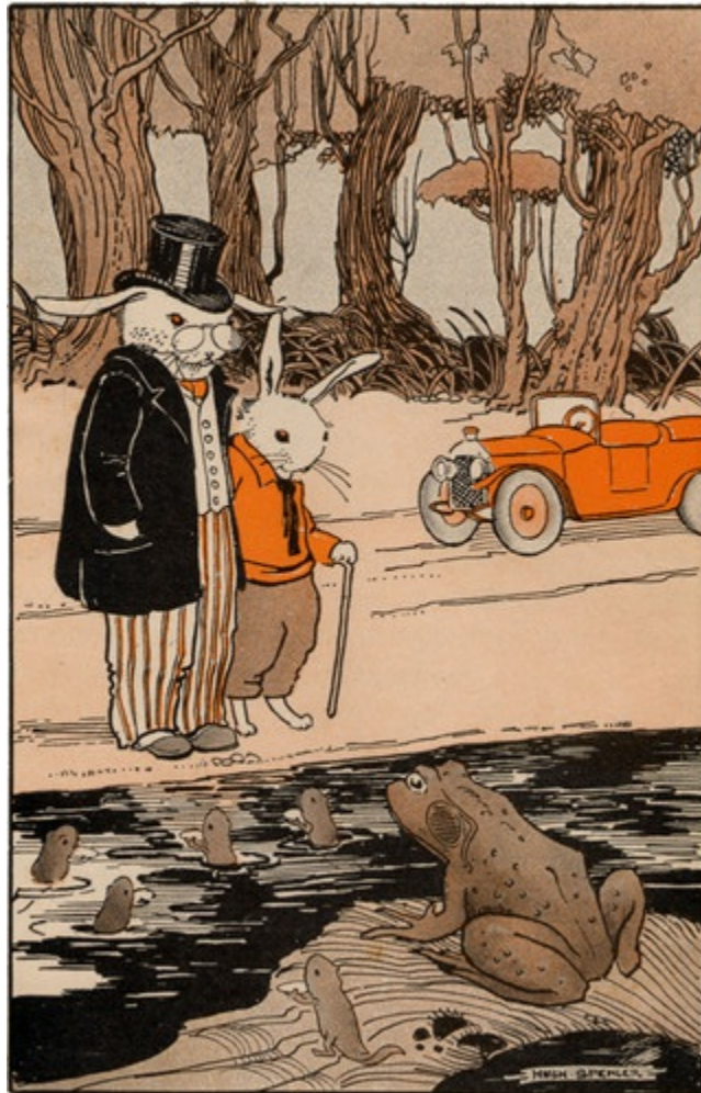
THE TADPOLE CAME BACK WITH WATERCRESS SANDWICHES AND POND-LILY MILK.

Well, while the ugly red-faced turkey was chasing dear Uncle Lucky all around the back yard, Billy Bunny backed the automobile out of the bake shop, and after he had scraped custard pie off the cabaret and lemon pie off the left front wheel and squash pie off the right front wheel and a dozen other kinds of pie off the two front lights, Uncle Lucky came hopping around the corner of the bake shop with the ugly red-faced turkey gobbler baker close behind him.