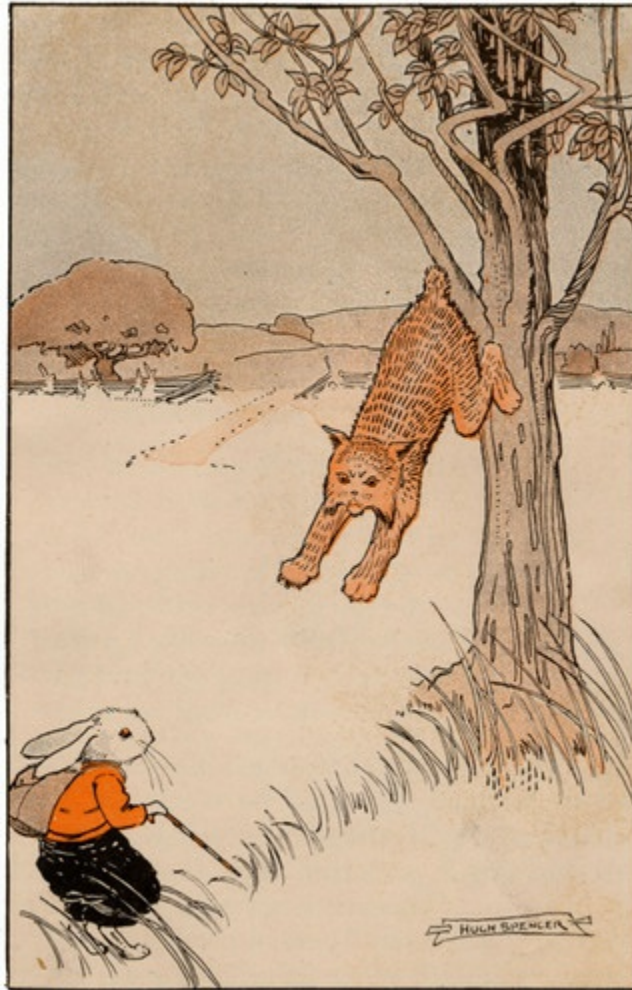
DOWN FROM THE TREE JUMPED THE WILDCAT.

Well, sir, that's just what happened to Billy Bunny. He no sooner stood right in front of the cave than a great blast of air knocked him off his feet and rolled him over thirty-three times and a half, and he would have rolled over thirty-four times even if a big log hadn't been in the way.