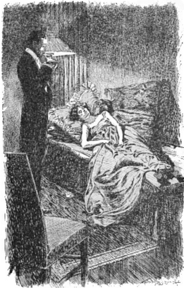
Berenice was lying in a crumpled heap on the low couch