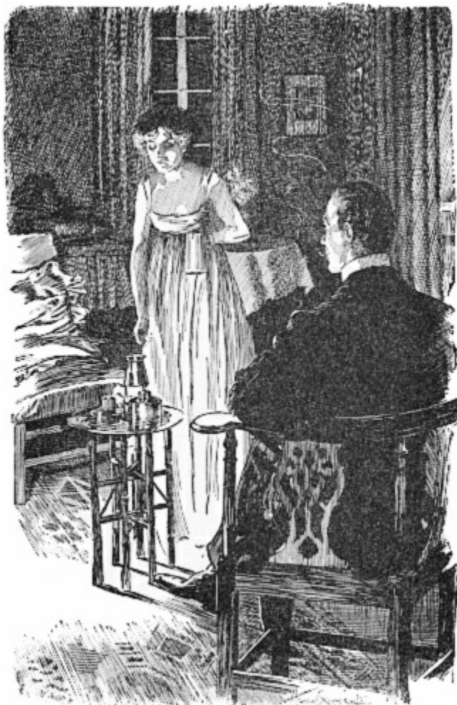
Matravers found himself wondering at this new and very natural note of domesticity in her

Matravers took the seat to which she motioned him, and obeyed her, watching, whilst she stooped down over the fire and poured water into a brazen coffee-pot, and took another cup and saucer from a quaint little cupboard. She made the coffee carefully and well, and Matravers, as he lit his cigarette, found himself wondering at this new and very natural note of domesticity in her.