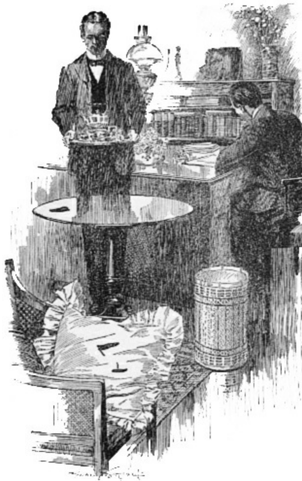
At half-past four his servant brought in a small tea-equipage

For several hours he worked at the revision of a certain manuscript, polishing and remodelling with infinite care and pains. Not even content with the correct and tasteful arrangement of his sentences, he read them over to himself aloud, lest by any chance there should have crept into them some trick of alliteration, or juxtaposition of words not entirely musical. In his work he gained, or seemed to gain, a complete absorption. The cloudy disquiet of the last few hours appeared to have passed away,—to have been, indeed, only a fugitive and transitory thing.