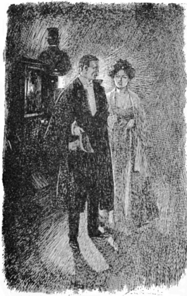
With an old-fashioned courtesy ... he offered her his arm

"I thought that you were to be late," he said, looking down at her with a shade of anxiety in his clear, grave face. "Was not this Lady Truton's night?"