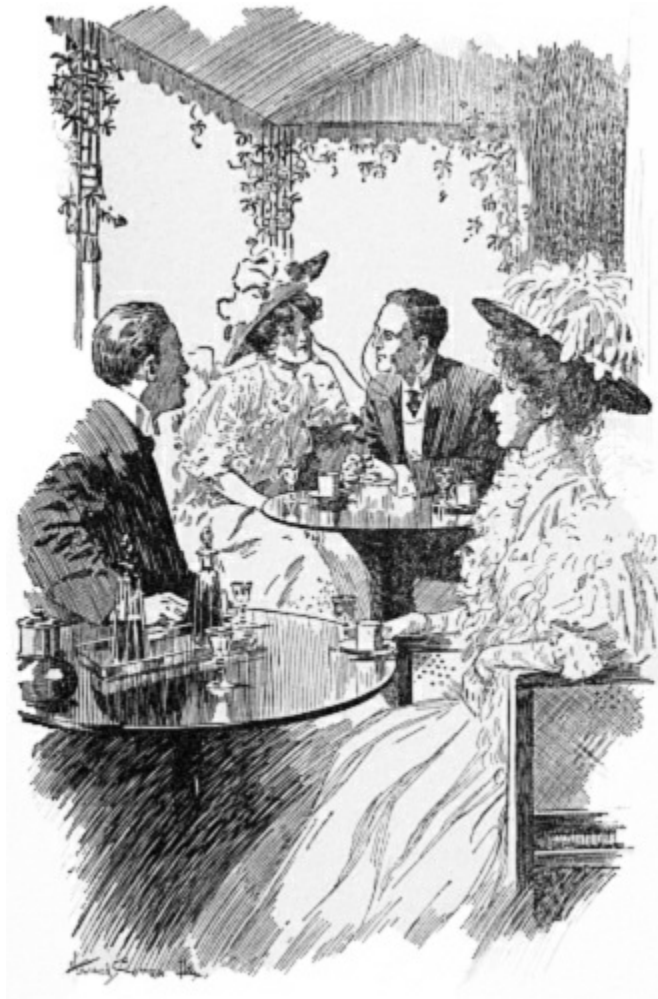
Matravers was suddenly conscious of an odd sense of disturbance

"In a sense, that is quite true," he admitted. "I wrote it without any definite idea of offering it to any London manager. My doing so was really only an impulse."