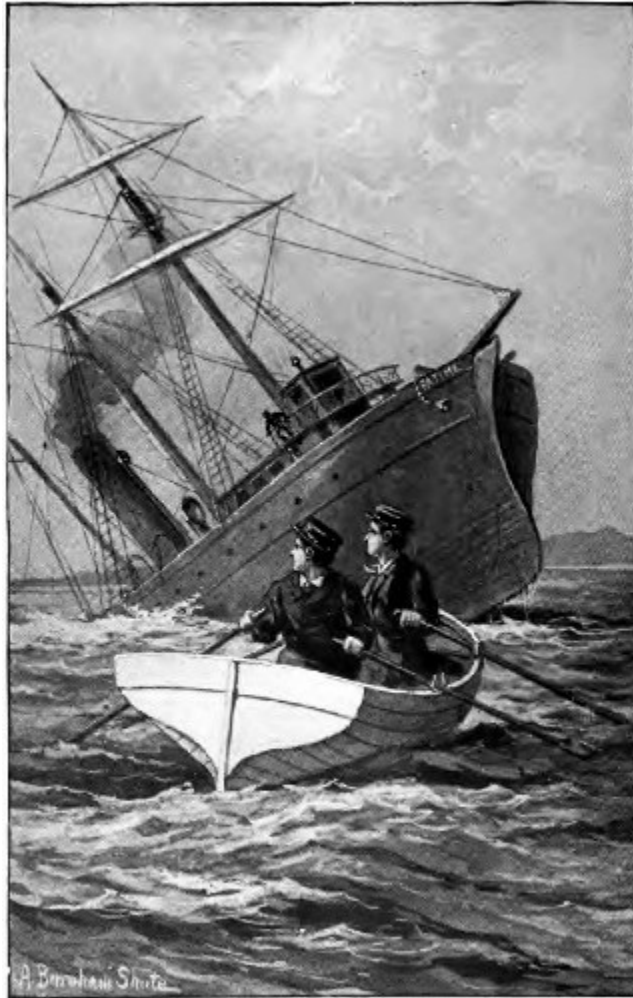
"The stern of the Fatima suddenly went down." Page 127 .

All-Over-the-World Library—Second Series