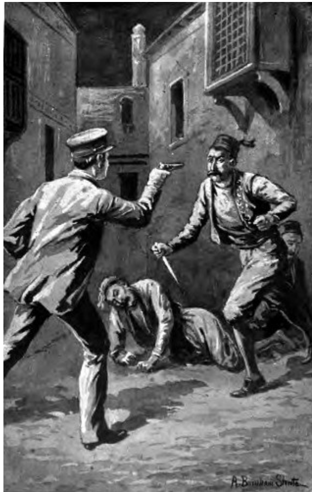
"My shot brought down one of the bandits." Page 351 .

"As I entered the street that leads from the Corso Cavour to the shore I heard the yells of a man in trouble. I always carried my revolver with me, and I had handled a good many rough villains in my day. I started at a run, and soon reached the scene of the fight. I found two men had attacked one; and though the latter was bravely defending himself, he was getting the worst of it. I saw that he was going under, and I fired just as the man attacked dropped on the pavement.