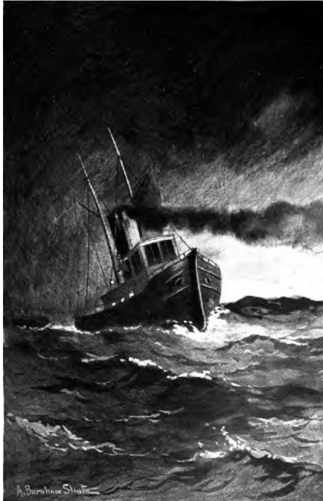
"It had been a stormy night." Page 51 .