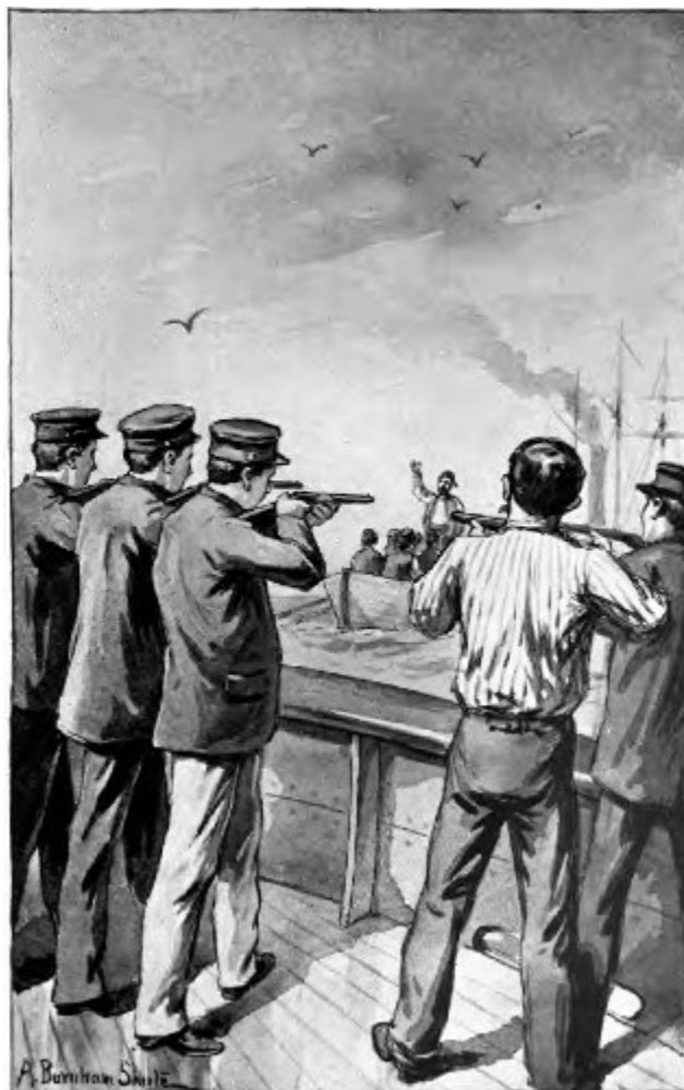
"Stop where you are or I shall order my men to fire!" Page