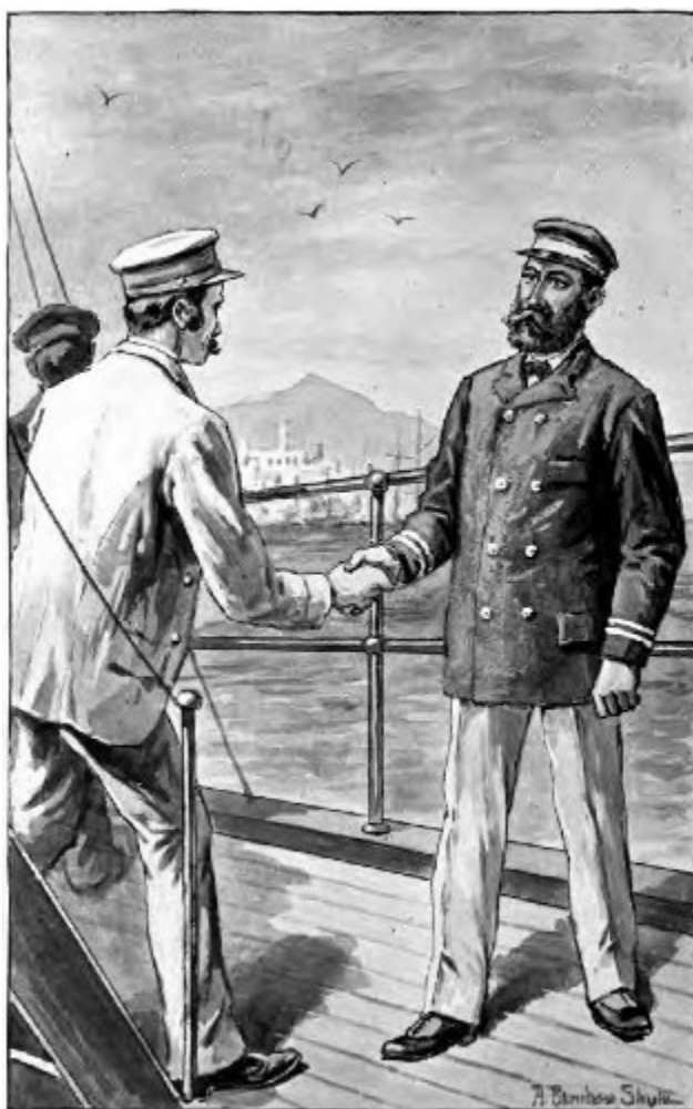
"Captain Ringgold, I am delighted to see you." Page 337 .

"The Blanche!" exclaimed the captain of the Guardian-Mother, starting back as though a red-hot shot had struck him.