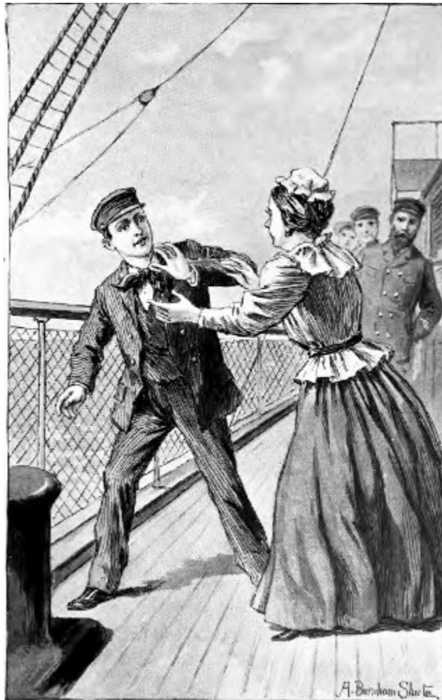
"She spread out her arms and rushed upon him." Page