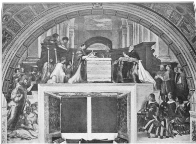
Plate 17.--Raphael. "The Mass of Bolsena." In the Vatican.

Yet even in what seems this decadence of his talent Raphael only needed a new problem to revive his admirable powers in their full splendor. In 1514 he painted the "Sibyls" (Pl. 19) of Santa Maria della Pace, in a frieze-shaped panel cut by a semicircular arch, and the new shape given him to fill inspired a composition as perfect in itself and as indisputably the only right one for the place as anything he ever did. Among his latest works were the pendentives of the Farnesina, with the story of Cupid and Psyche--works painted and even drawn by his pupils, coarse in types and heavy in color but altogether astonishing in freedom and variety of design. The earlier painters covered their vaulting with ornamental patterns in which spaces were reserved for independent pictures, like the rectangles of the Stanza della Segnatura.