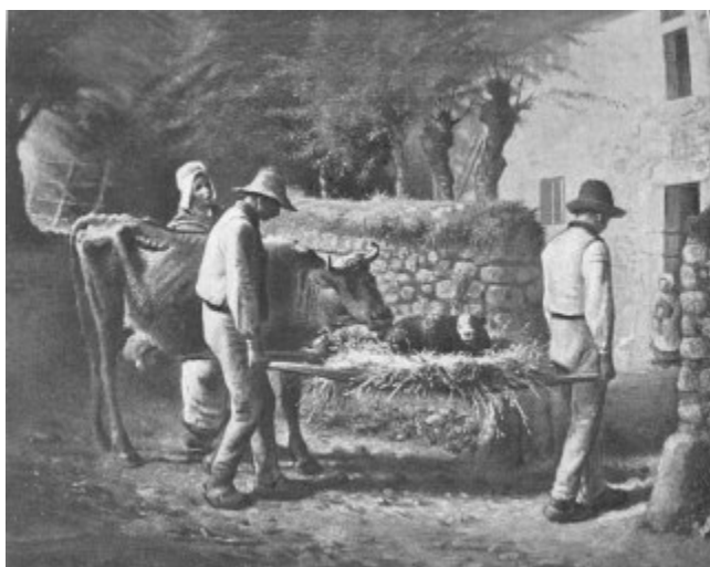
Plate 7.—Millet. "The New-Born Calf." In the Art Institute, Chicago.

The especial study of the nineteenth century was landscape, and Millet was so far a man of his time that he was a great landscape painter; but his treatment of landscape was unlike any other, and, like his own treatment of the figure, in its insistence on essentials, its elimination of the accidental, its austere and grand simplicity. I have heard, somewhere, a story of his saying, in answer to praise of his work or inquiry as to his meaning: "I was trying to express the difference between the things that lie flat and the things that stand upright." That is the real motive of one of his masterpieces—one that in some moods seems the greatest of them all—"The Shepherdess" (Pl. 9), that is, or used to be, in the Chauchard collection. In this nobly tranquil work, in which there is no hint of sadness or revolt, are to be found all his usual inevitableness of composition and perfection of draughtsmanship—note the effect of repetition in the sheep, "forty feeding like one"—but the glory of the picture is in the infinite recession of the plain that lies flat, the exact notation of