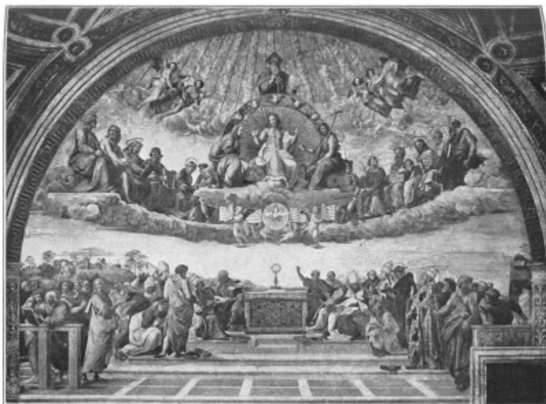
Plate 13.--Raphael. The "Disputa." In the Vatican.

Opposite, in the "School of Athens" (Pl. 14), the treatment is different but equally successful. The hieratic majesty of the "Disputa" was here unnecessary, but a tranquil and spacious dignity was to be attained, and it is attained through the use of vertical and horizontal lines--the lines of stability and repose, while the bounding curve is echoed again and again in the diminishing arches of the imagined vaulting. The figures, fewer in number than in the "Disputa" and confined to the lower half of the composition, are ranged in two long lines across the picture; but the nearer line is broken in the centre and the two figures on the steps, serving as connecting-links between the two ranks, give to the whole something of that semicircular grouping so noticeable in the companion picture.