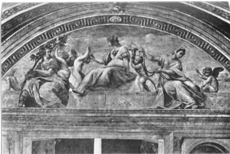
Plate 16.--Raphael. "Jurisprudence." In the Vatican.

Yet even in what seems this decadence of his talent Raphael only needed a new problem to revive his admirable powers in their full splendor. In 1514 he painted the "Sibyls" (Pl. 19) of Santa Maria della Pace, in a frieze-shaped panel cut by a semicircular arch, and the new shape given him to fill inspired a composition as perfect in itself and as indisputably the only right one for the place as anything he ever did. Among his latest works were the pendentives of the Farnesina, with the story of Cupid and Psyche--works painted and even drawn by his pupils, coarse in types and heavy in color but altogether astonishing in freedom and variety of design. The earlier painters covered their vaulting with ornamental patterns in which spaces were reserved for independent pictures, like the rectangles of the Stanza della Segnatura.