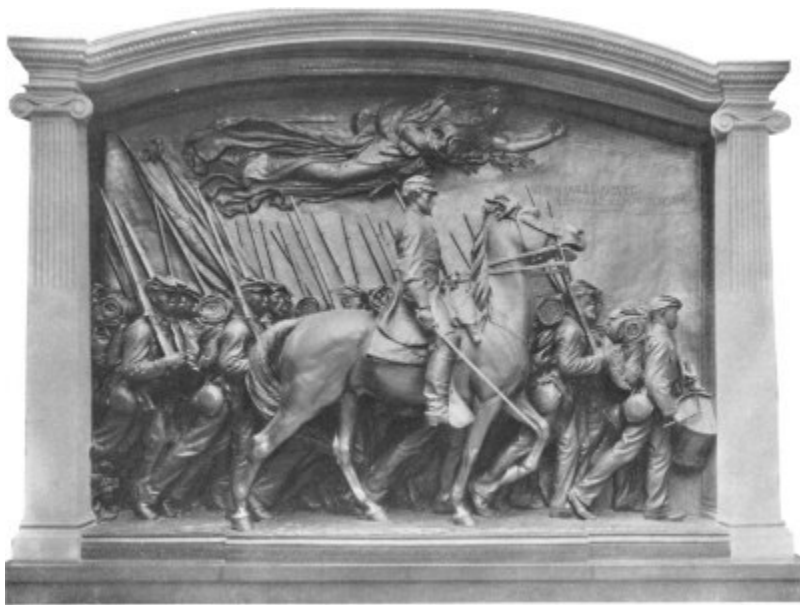
Plate 31.--Saint-Gaudens. "Shaw Memorial."

bust. The sculptor had thus an unusual knowledge of his subject, a perfect sympathy with his theme; and he has produced a work of epic sweep and significance. Tall and erect, the general sits his horse, his military cloak bellying out behind him, his trousers strapped down over his shoes, his hat in his right hand, dropping at arm's length behind his knee, his bare head like that of an old eagle, looking straight forward. The horse is as long and thin as his rider, with a tremendous stride; and his big head, closely reined in, twitches viciously at the bridle. Before the horse and rider, upon the ground, yet as if new-lighted there from an aerial existence, half walks, half flies, a splendid winged figure, one arm outstretched, the other brandishing the palm--Victory leading them on. She has a certain fierce wildness of aspect, but her rapt gaze and half-open mouth