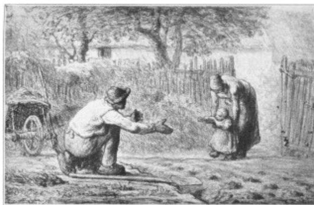
Plate 8.—Millet. "The First Steps."

have seen that he was a supremely able technician in his pot-boiling days and that the color and handling of his early pictures were greatly admired by so brilliant a virtuoso as Diaz. But this "flowery manner" would not lend itself to the expression of his new aims and he had to invent another. He did so stumblingly at first, and the earliest pictures of his grand style have a certain harshness and ruggedness of surface and heaviness of color which his critics could not forgive any more than the Impressionists, who have outdone that ruggedness, can forgive him his frequent use of a warm general tone inclining to brownness. His ideal of form and of composition he possessed complete from the beginning; his mastery of light and color and the handling of materials was slower of acquirement; but he did acquire