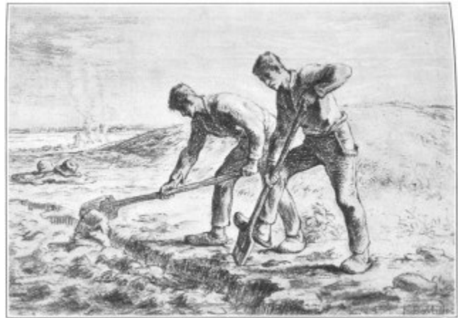
Plate 4.--Millet. "The Spaders."

The comparison with Michelangelo is inevitable and has been made again and again by those who have felt the elemental grandeur of Millet's work. As a recent writer has remarked: "An art highly intellectualized, so as to convey a great idea with the lucidity of language, must needs be controlled by genius akin to that which inspired the ceiling paintings of the Sistine Chapel." [A] This was written of the Trajanic sculptors, whose works both Michelangelo and Millet studied and admired, and indeed it is to this old Roman art, or to the still older art of Greece, that one must go for the truest parallel of Millet's temper and his manner of working. He was less impatient, less romantic and emotional than Michelangelo; he was graver, quieter, more serene; and if he had little of the Greek sensuousness and the Greek love of physical beauty, he had much of the antique clarity and simplicity. To express his idea clearly, logically, and forcibly; to make a work of art that should be "all of a piece" and in which "things should be where they are for a purpose"; to admit nothing for display, for ornament, even for beauty, that did not necessarily and inevitably grow out of his central theme, and to suppress with an iron rigidity everything useless or superfluous--this was his constant and conscious effort. It is an ideal eminently austere and intellectual--an ideal, above all, especially and eternally classic.