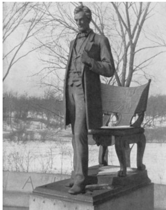
Plate 28.--Saint-Gaudens. "Lincoln."

To the boyish Saint-Gaudens Sherman had seemed the typical American hero. To the matured artist he had sat for an admirable