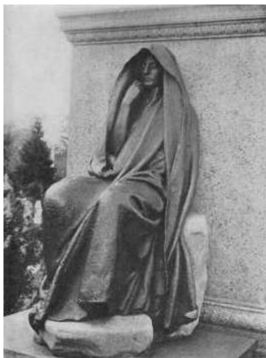
Plate 30.--Saint-Gaudens. "Adams Memorial."