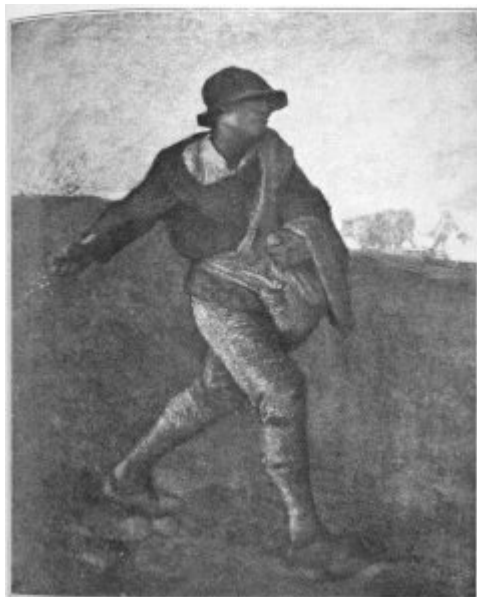
Plate 2.—Millet. "The Sower." In the Metropolitan Museum of Art. Vanderbilt collection.

It was the work of this time that Diaz admired for its color and its "immortal flesh painting"; that caused