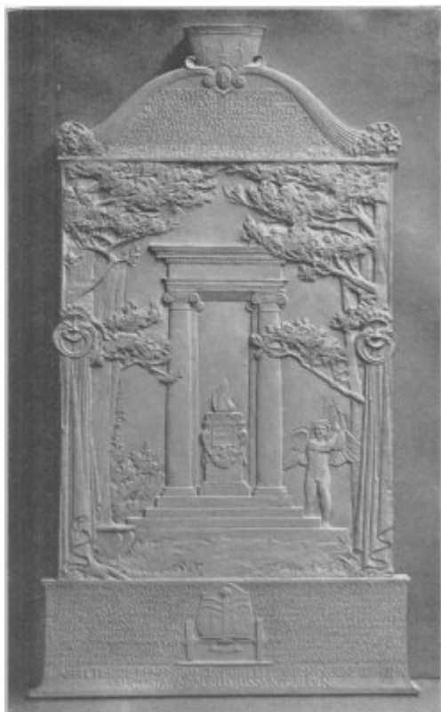
Plate 23.—Saint-Gaudens. "Plaque Commemorating Cornish Masque."

to any one who ever came in contact with him—to any one, even, who ever saw his portrait. In his spare but strong-knit figure, his firm but supple hands, his manner of carrying himself, his every gesture, one felt the abounding vitality, the almost furious energy of the man. That extraordinary head, with its heavy brow beetling above the small but piercing eyes, its red beard and crisp, wiry hair, its projecting jaw and great, strongly modelled nose, was alive with power—with power of intellect no less than of will. His lack of early education gave him a certain diffidence and a distrust of his own gifts of expression. He was apt to overrate the mere verbal facility of others and to underestimate himself in the comparison—indeed, a certain humility was strongly marked in him, even as regards his art, though he was self-confident also. When he was unconstrained his great powers of observation, his shrewdness of judgment, his bubbling humor, and a picturesque vivacity of phrase not uncommon among artists made him one of the most entrancing of talkers.