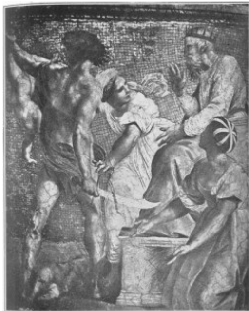
Plate 12.--Raphael. "The Judgment of Solomon." In the Vatican.