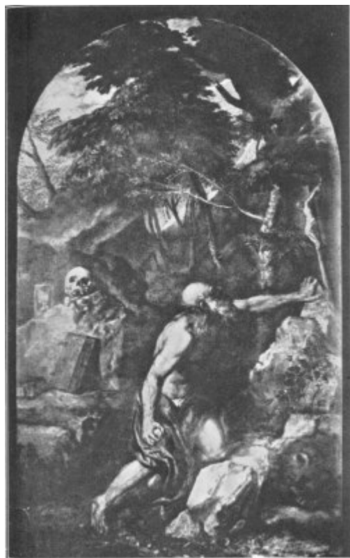
Plate 22.--Titian. "St. Jerome in the Desert." In the Brera Gallery, Milan.