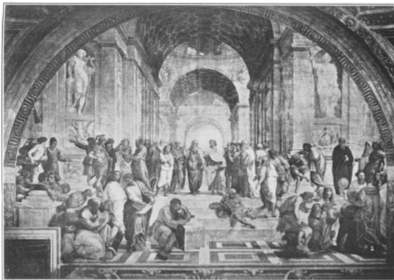
Plate 14.--Raphael. "The School of Athens." In the Vatican.

At first sight the design seems less symmetrical and formal than the others, with a lyrical freedom befitting the subject, but in reality it is no less perfect in its ponderation. The group of trees above Apollo and the reclining figures either side of him accent the centrality of his position. From this point the line of heads rises in either direction to the figures of Homer and of the Muse whose back is turned to the spectator, and the perpendicularity of these two figures carries upward into the arch the vertical lines of the window. From this point the lateral masses of foliage take up the drooping curve and unite it to the arch, and this curve is strongly reinforced by the building up toward either side of the foreground groups and by the disposition of the arms of Sappho and of the poets immediately behind her, while, to disguise its formality, it is contradicted by the long line of Sappho's body, which echoes that of the bearded poet immediately to the right of the window and gives a sweep to the left to the whole lower part of the composition. It is the immediate and absolute solution of the problem, and so small a thing as the scarf of the back-turned Muse plays its necessary part in it, balancing, as it does, the arm of the Muse who stands highest on the left and establishing one of a number of subsidiary garlands that play through and bind together the wonderful design.