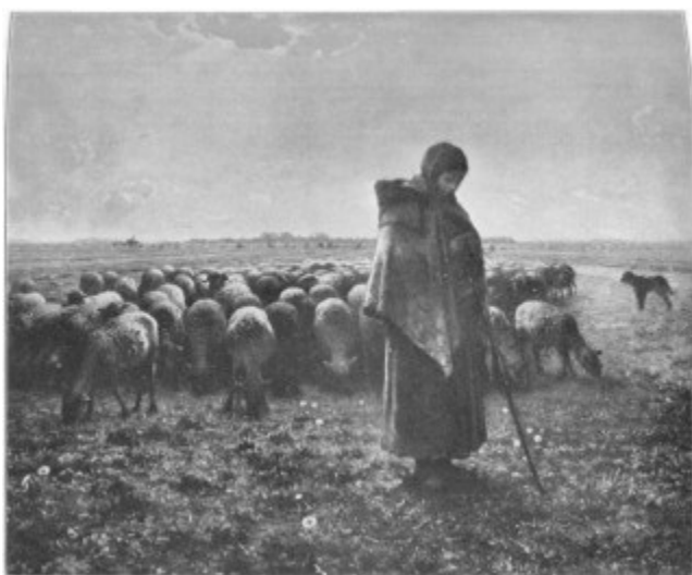
Plate 9.—Millet. "The Shepherdess." In the Chauchard collection, Louvre.

it, and in the end he is as absolute a master of painting as of drawing. He did not see nature in blue and violet, as Monet has taught us to see it, and little felicities and facilities of rendering, and anything approaching cleverness or the parade of virtuosity he hated; but he knew just what could be done with thick or thin painting, with opaque or transparent pigment, and he could make his few and simple colors say anything he chose. In his mature work there is a profound knowledge of the means to be employed and a great economy in their use, and there is no approach to indiscriminate or meaningless loading. "Things are where they are for a purpose," and if the surface of a picture is rough in any place it is because just that degree of roughness was necessary to attain the desired effect. He could make mere paint express light as few artists have been able to do—"The Shepherdess" is flooded with it—and he could do this without any sacrifice of the sense of substance in the things on which the light falls. If some of his canvases are brown it is because brown seemed to him the appropriate note to express what he had to say; "The Gleaners" glows with almost the richness of a Giorgione, and other pictures are honey-toned or cool and silvery or splendidly brilliant. And in whatever key he painted, the harmony of his tones and colors is as large, as simple, and as perfect as the harmony of his lines and masses.