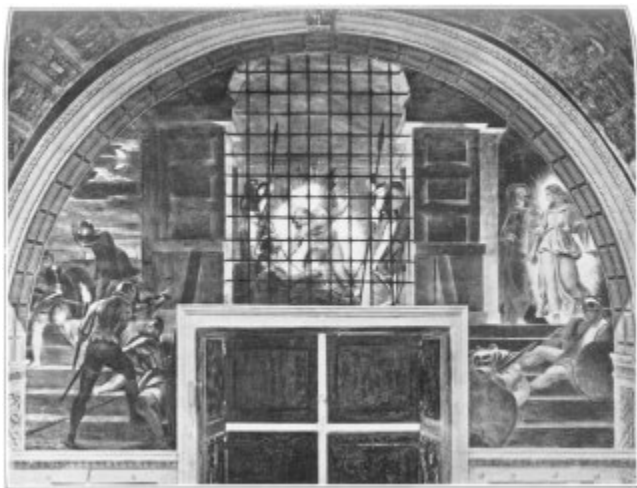
Plate 18.--Raphael. "The Deliverance of Peter." In the Vatican.