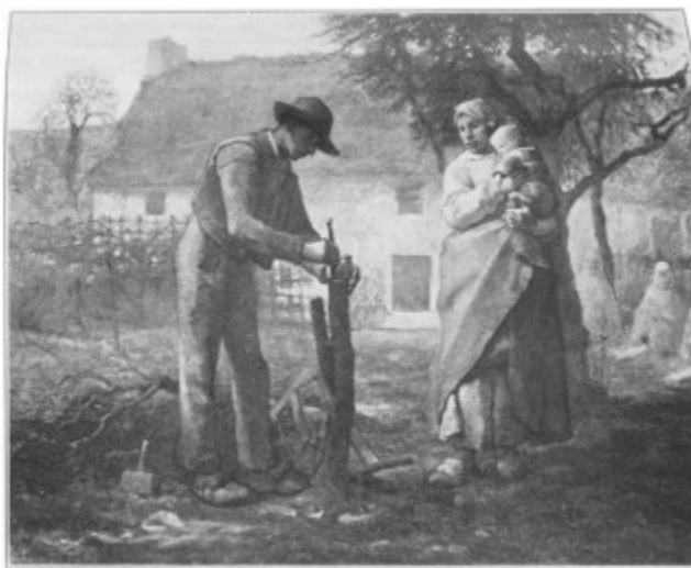
Plate 6.--Millet. "The Grafter." In the collection of William Rockefeller.

Oftener than anything, perhaps, it was the sense of weight that interested Millet. It is the adjustment of her body to the weight of the child she carries that gives her statuesque pose to the wife of the grafter. It is the drag of the buckets upon the arms that gives her whole character to the magnificent "Woman Carrying Water," in the Vanderbilt collection. It is the erect carriage, the cautious, rhythmic walk, keeping step together, forced upon them by the sense of weight, which gives that gravity and solemnity to the bearers of "The New-Born Calf" (Pl. 7), which was ridiculed by Millet's critics as more befitting the bearers of the bull Apis or the Holy Sacrament. The artist himself was explicit in this instance as in that of the "Woman Carrying Water." "The expression of two men carrying a load on a litter," he says, "naturally depends on the weight which rests upon their arms. Thus, if the weight is equal, their expression will be the same, whether they bear the Ark of the Covenant or a calf, an ingot of gold or a stone." Find that expression, whether in face or figure, render it clearly, "with largeness and simplicity," and you have a great, a grave, a classic work of art. "We are never so truly Greek," he said, "as when we are simply painting our own impressions." Certainly his own way of painting his impressions was more Greek than anything else in the whole range of modern art.