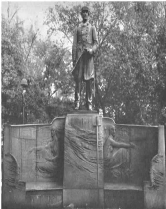
Plate 27.--Saint-Gaudens. "Farragut."

hero. He showed it again, and with ampler maturity, in that august figure of "Lincoln" (Pl. 28), grandly dignified, austere, sorrowfully human, risen from the chair of state that marks his office, but about to speak as a man to men, his bent head and worn face filled with a sense of power, but even more with the sadness of responsibility--filled, above all, with a yearning, tender passion of sympathy and love. In imaginative presentation of character, in nobility of feeling and breadth of treatment, no less than in perfection of workmanship, these are among the world's few worthy monuments to its great men.