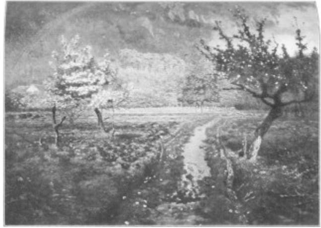
Plate 10.—Millet. "Spring." In the Louvre.