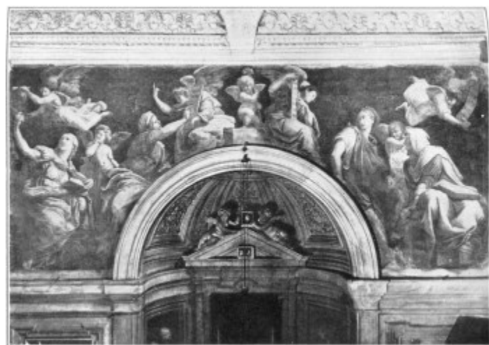
Plate 19.--Raphael. "The Sibyls." Santa Maria della Pace, Rome.

Raphael's portraits alone, had he done nothing else, would justify a great reputation, but they form so relatively small a part of his work that they may almost be neglected in examining his claims to the rank that used to be assigned him among the world's greatest artists. It is, after all, his unique mastery of composition that is his chief title to fame, and his glory must always be in proportion to the estimation in which that quality is held. It was because composition was to him a comparatively unimportant part of painting that Velazquez thought little of Raphael. It is because, for them, composition, as a distinct element of art, has almost ceased to exist that so many modern painters and critics decry Raphael altogether. The decorators have always known that design is the essence of their art, and therefore they have always appreciated the greatest of designers. That