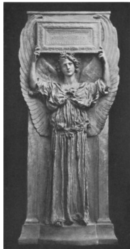
Plate 24.-- Saint-Gaudens. "Amor Caritas."