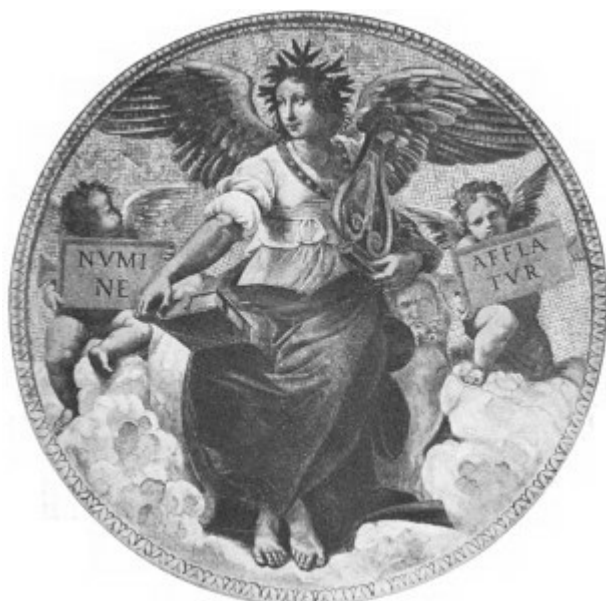
Plate 11.--Raphael. "Poetry." In the Vatican.

If the composition of the rectangles is less inevitable it is only because the variety of ways in which such simple rectangles may be filled is almost infinite. Composition more masterly than that of the "Judgment of Solomon" (Pl. 12), for instance, you will find nowhere; so much is told in a restricted space, yet with no confusion, the space is so admirably filled and its shape so marked by the very lines that enrich and relieve it. It is as if the design had determined the space rather than the space the design. If you had a tracing of the figures in the midst of an immensity of white paper you could not bound them by any other line than that of the actual frame. One of the most remarkable things about it is the way in which the angles, which artists usually avoid and disguise, are here sharply accented. A great part of the dignity and importance given to the king is due to the fact that his head fills one of these angles, and the opposite one contains the hand of the executioner and the foot by which the living child is held aloft, and to this point the longest lines of the picture lead. The dead child and the indifferent mother fill the lower corners. In the middle, herself only half seen and occupying little space, is the true mother, and it