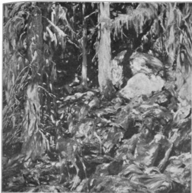
Plate 21.--Sargent. "The Hermit." In the Metropolitan Museum of Art.

head with tangled beard and unkempt hair; then of an emaciated body. There is a man in the wood! And then--did they betray themselves by some slight movement?--there are a couple of slender antelopes who were but now invisible and who melt into their surroundings again at the slightest inattention. It is like a pictorial demonstration of protective coloring in men and animals.