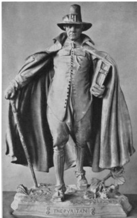
Plate 29.--Saint-Gaudens. "Deacon Chapin."

perfectly rendered, and the guns fill the middle of the panel in an admirable pattern, without confusion or monotony. The heads are superb in characterization, strikingly varied and individual, yet each a strongly marked racial type, unmistakably African in all its forms.