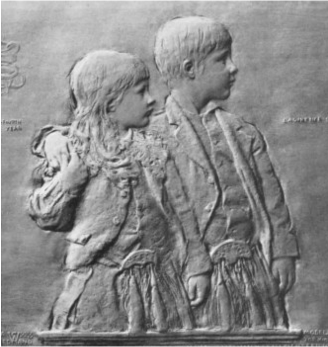
Plate 25.—Saint-Gaudens. "The Butler Children."

genius—if it was, even, in his earlier work, a trifle picturesque, so that, as he said himself, he had "to fight against picturesqueness," his work was never pictorial. He never indulged in perspective or composed his reliefs on more than one plane; never took such liberties with the traditions of sculpture as did Ghiberti, or painted pictures in bronze or marble as more than one modern has done. His very feeling for decoration kept him from pictorial realism, and his fight against picturesqueness was nobly won. His design becomes ever cleaner and more classic; by years of work and of experience he becomes stronger and stronger in the more purely sculptural qualities—attains a grasp of form and structure only second to his mastery of composition. He is always a consummate artist—in his finest works he is a great sculptor in the strictest sense of the word.