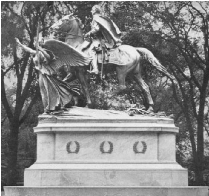
Plate 32.--Saint-Gaudens. "Sherman."

Where, among such minds, he will take his rank we need not ask. It is enough that he is among them. Such an artist is assuredly a benefactor of his country, and it is eminently fitting that his gift to us should be acknowledged by such tribute as we can pay him. By his works in other lands and by his world-wide fame he sheds a glory upon the name of America, helping to convince the world that here also are those who occupy themselves with the things of the spirit, that here also are other capabilities than those of industrial energy and material success. In his many minor works he has endowed us with an inexhaustible heritage of beauty--beauty which is "about the best thing God invents." He is the educator of our taste and of more than our taste--of our sentiment and our emotions. In his great monuments he has not only given us fitting presentments of our national heroes; he has expressed, and in expressing elevated, our loftiest ideals; he has expressed, and in expressing deepened, our profoundest feelings. He has become the voice of all that is best in the American people, and his works are incentives to patriotism and lessons in devotion to duty.