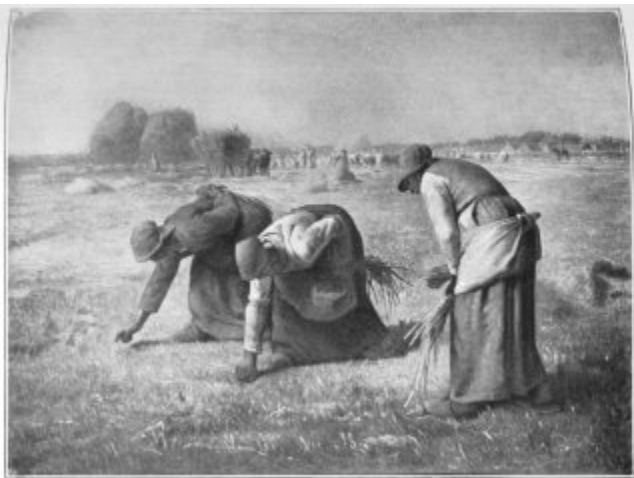
Plate 3.--Millet. "The Gleaners." In the Louvre.

At Barbizon he neither resumed the costume nor led the life of a peasant. He wore sabots, as hundreds of other artists have done, before and since, when living in the country in France. Sabots are very cheap and very dry and not uncomfortable when you have acquired the knack of wearing them. In other respects he dressed and lived like a small bourgeois, and was monsieur to the people about him. Barbizon was already a summer resort for artists before he came there, and the inn was full of painters; while others, of whom Rousseau was one, were settled there more or less permanently. It is but a short distance from Paris, and the exhibitions and museums were readily accessible. The life that Millet lived there was that of many poor, self-respecting, hard-working artists, and if he had been a landscape painter that life would never have seemed in any way exceptional. It is only because he was a painter of the figure that it seems odd he should have lived in the country; only because