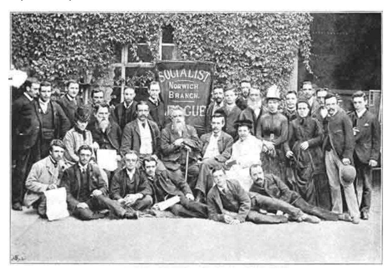
NORWICH BRANCH OF THE SOCIALIST LEAGUE.

left the victor well-nigh bankrupt in health and in purse, and sent him to a comparatively early grave. He lived long enough to justify his election, to prove his value to the House and to his country, but he did not live long enough to render to England all the services which his long training, his wide knowledge, his courage, and his honesty so eminently fitted him to yield.