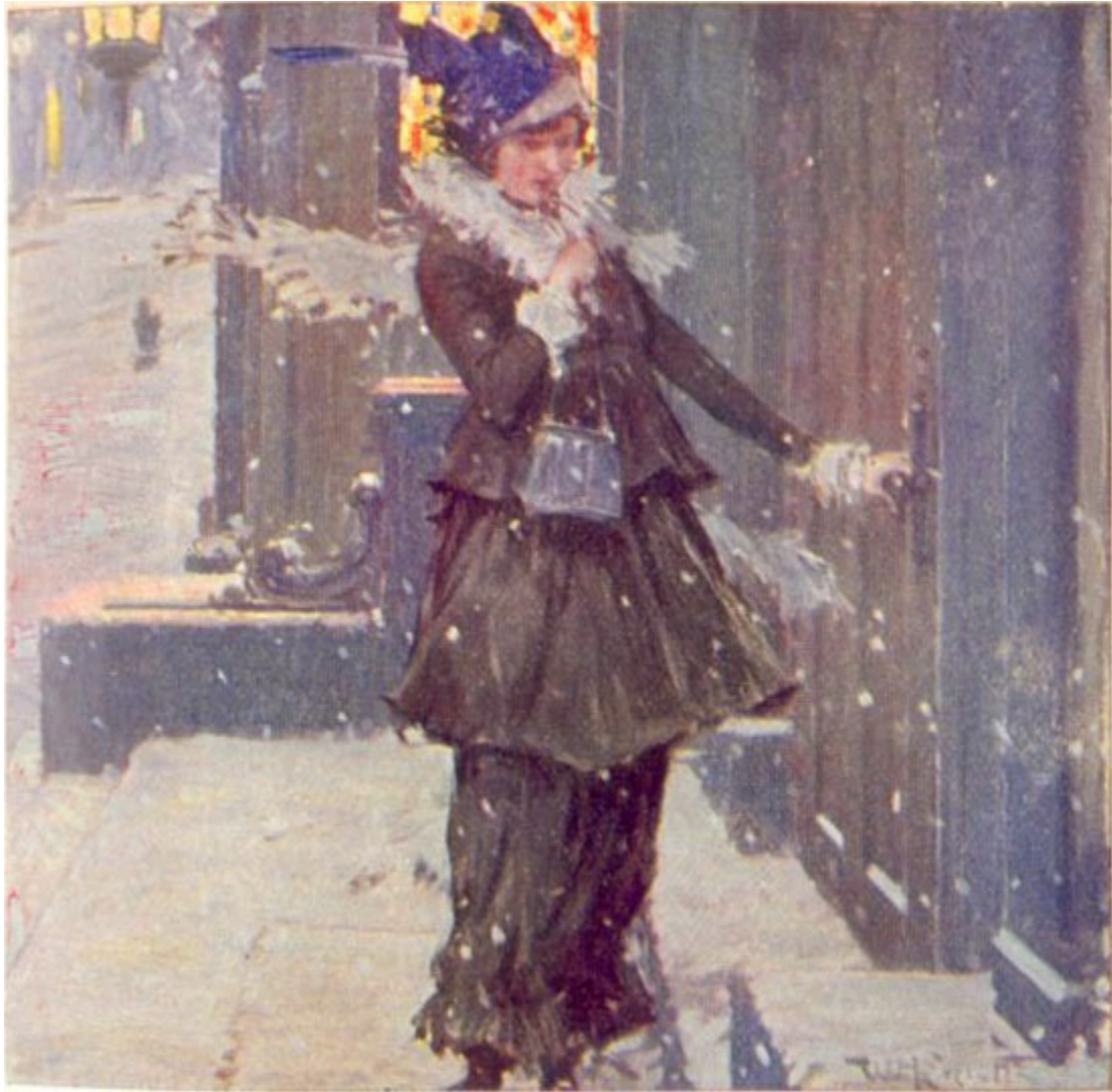
She laid her hand upon the knob of the church door.

What was this strange figure? Who was he? As she stared, the outline drew nearer. A man vested in long white draperies confronted her. He was bareheaded and appeared insensible to the cold in which she shivered. She put out her hand and something folded it back upon her breast. She opened her lips and something sealed them.