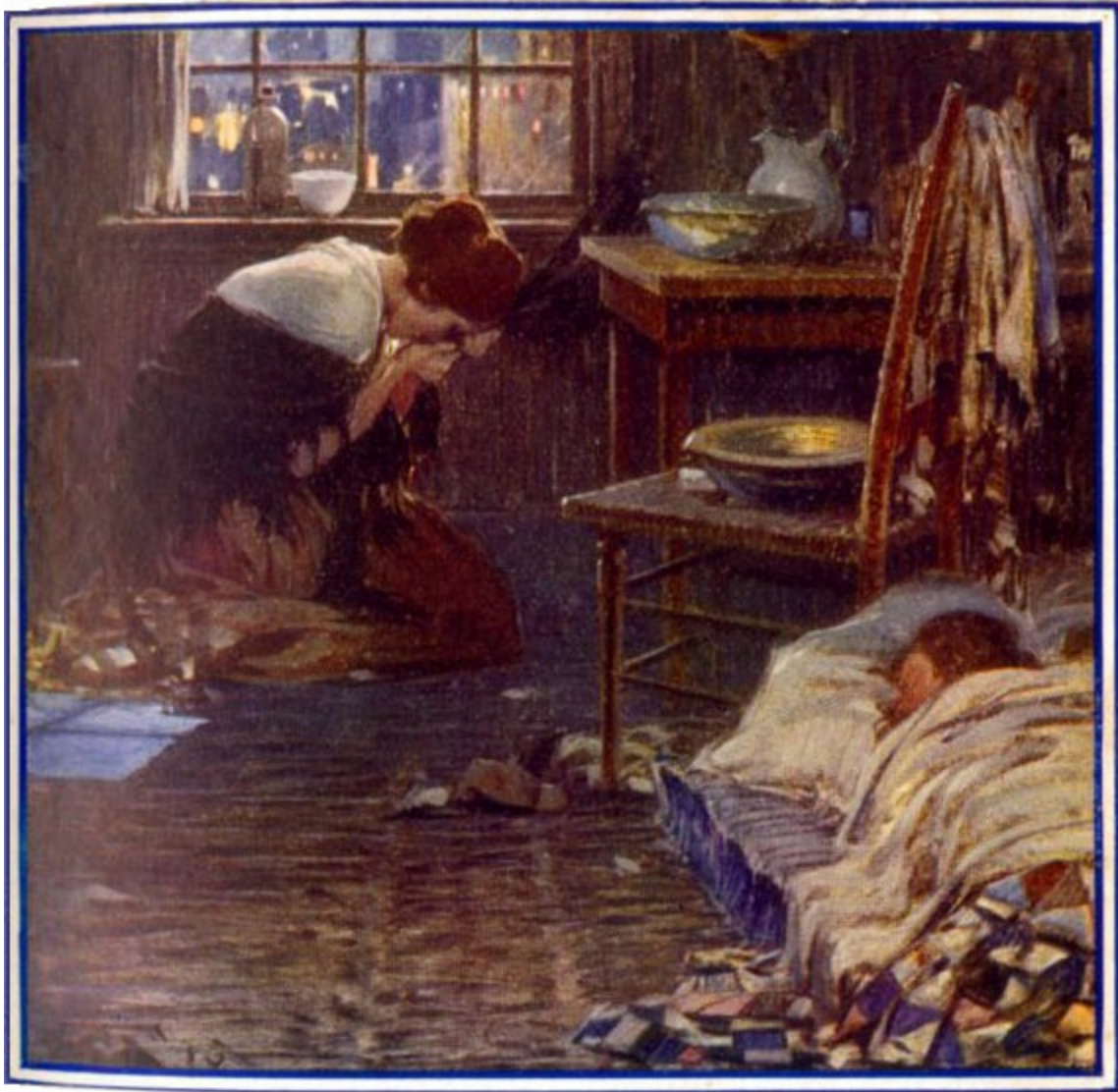
She pressed them against her face.

After a time she fell down on her knees. She pressed them against her face. She did not say anything. She could scarcely think anything. She just knelt there until something gently drew her head around. She dropped the stockings. She put her right hand on the window-ledge to steady herself and looked backward.