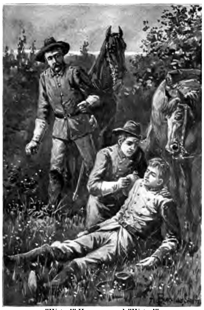
"Water!" He murmured, "Water!" Page 115