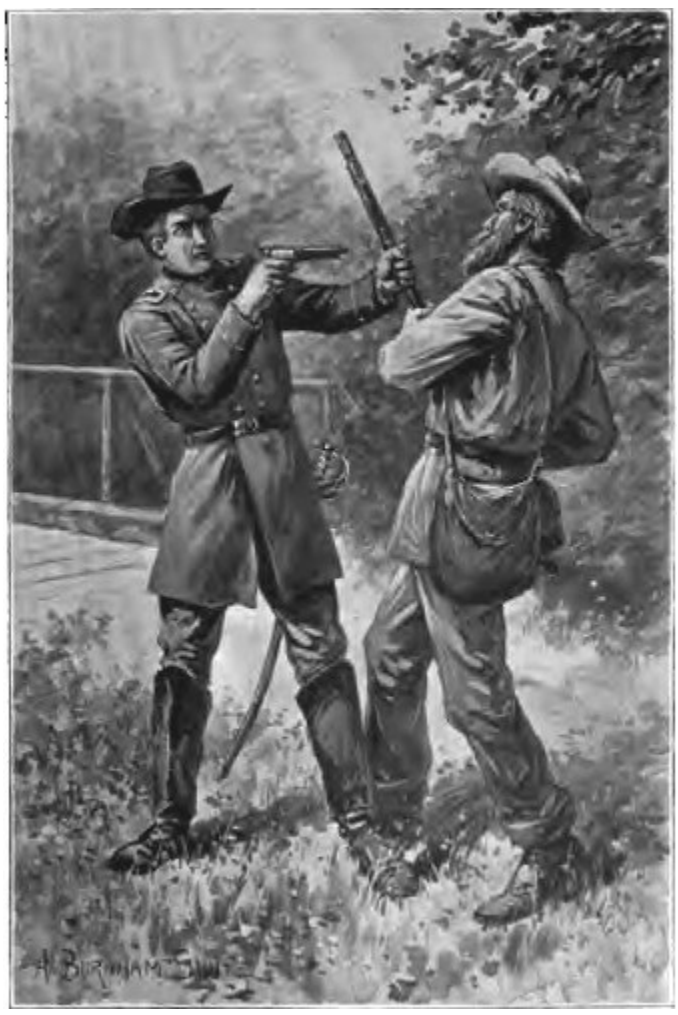
"Surrender, or You are a Dead Man!" Page 32.