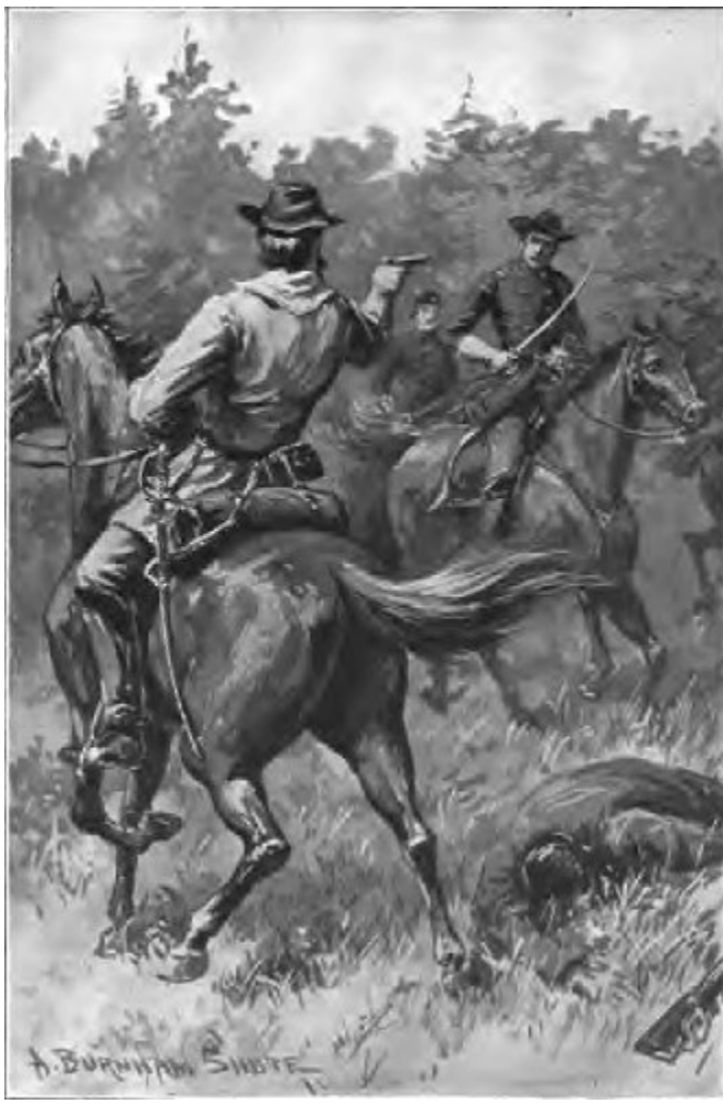
He found Himself Face to Face with the Confederate Captain. Page 428.

A lucky leap on Ceph's part saved Deck from serious injury, if not from death, and in a flash captain and major came together, and sword met sabre in strokes which brought forth flashes of fire. The captain was a heavy-built man of twice Deck's age, and as their blades came together the major realized that he had engaged an opponent worthy of his steel.