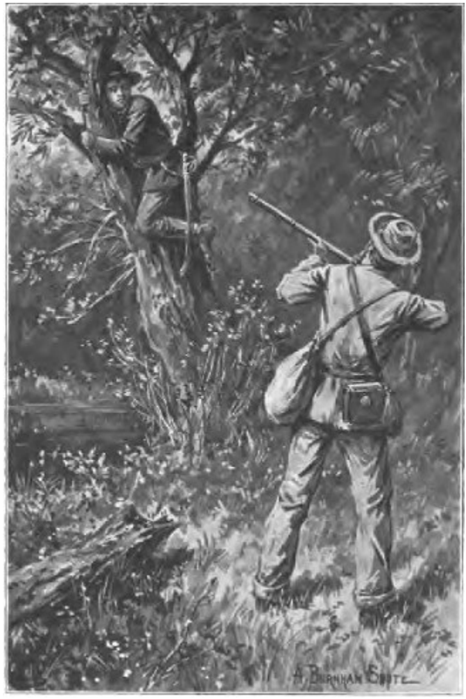
"Say, Major, tumble down right Yere!" Page 352.

The gun was still pointed at Deck's head while the sharpshooter remained partly screened by some brush. As there seemed no help for it Deck threw down his pistol and also an extra revolver he had lately taken to carrying. His sabre had been left in Life Knox's charge.