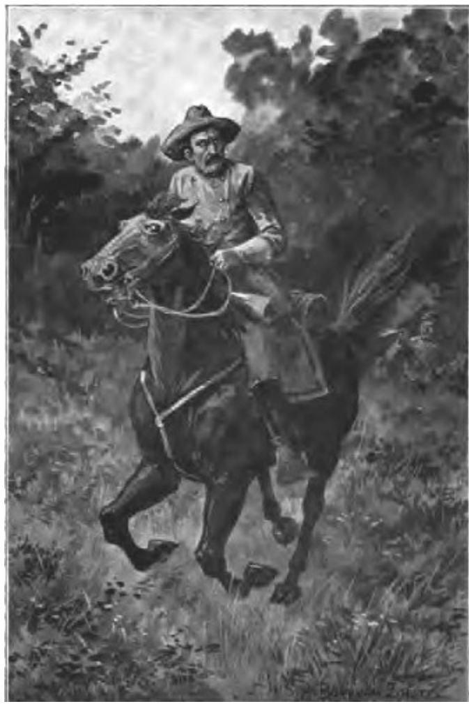
Captain Vallingham attempting to escape. Page 308.

"Escaping, is he!" cried Life, and just then the rifle of the first of the sharpshooters rang out, and another ballet increased the ventilation in the daring man's head-covering. The second and the third sharpshooters tried to urge their horses up the rocks, but this could not be done, and they made the leaps alone, directly from their saddles.