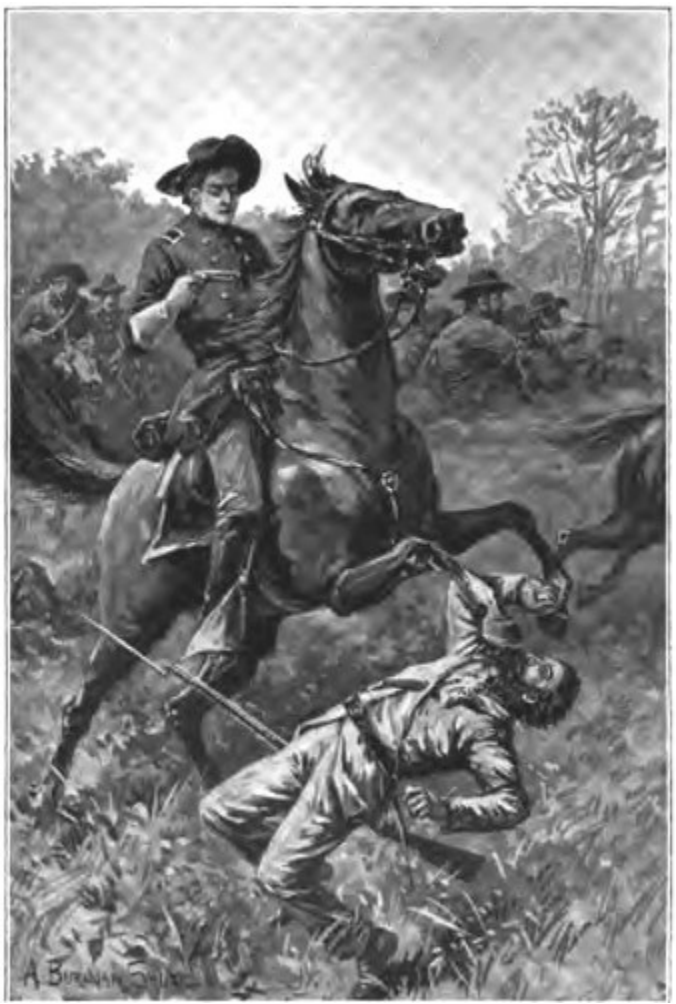
His Foot caught the Man in the Face. Page 249.

Maddened by what seemed a hopeless charge, the Confederates fought desperately, but they could do nothing against such superior numbers, and almost the first man to go down was the captain, shot through the heart. Deck was within a hundred feet of the fellow, and hardly had their leader fallen than two Confederates rushed upon the young major, each with a bayonet affixed to his gun.