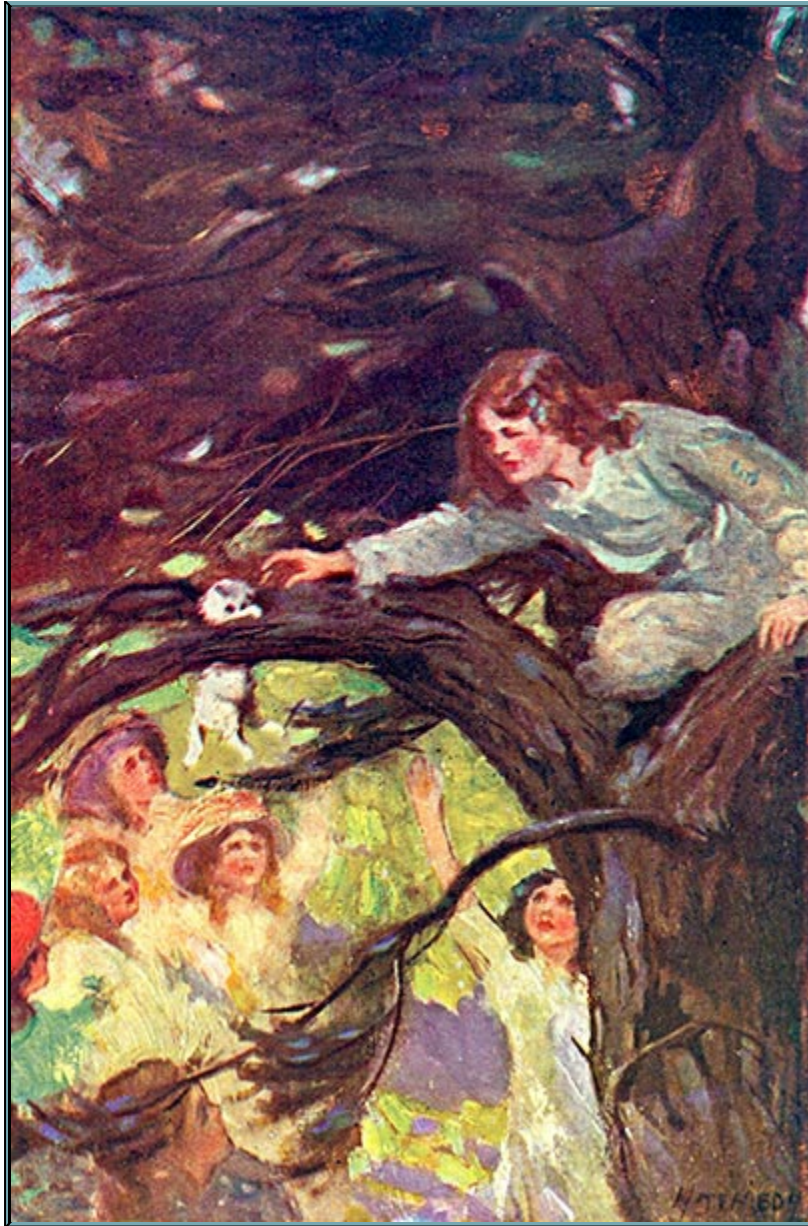
"MAKING A LONG ARM, SHE MANAGED TO SEIZE PUSS BY THE SCRUFF OF HER NECK."

Peggy liked her new friend at once; his twinkling blue eyes, his bronzed face, his jovial voice, and rather unconventional dress, seemed to mark him as distinct and different to other people. His arrival seemed to alter the whole atmosphere. Maud's supercilious manner slipped away from her like magic, and she became once more the pleasant Maud of the dancing-class, and her friends, feeling the change, soon left off trying to be poor little imitations of grown-up people, and began at last to enjoy themselves; for true enjoyment does not consist in showing off, but in being our simple, natural selves, if people would only believe it.