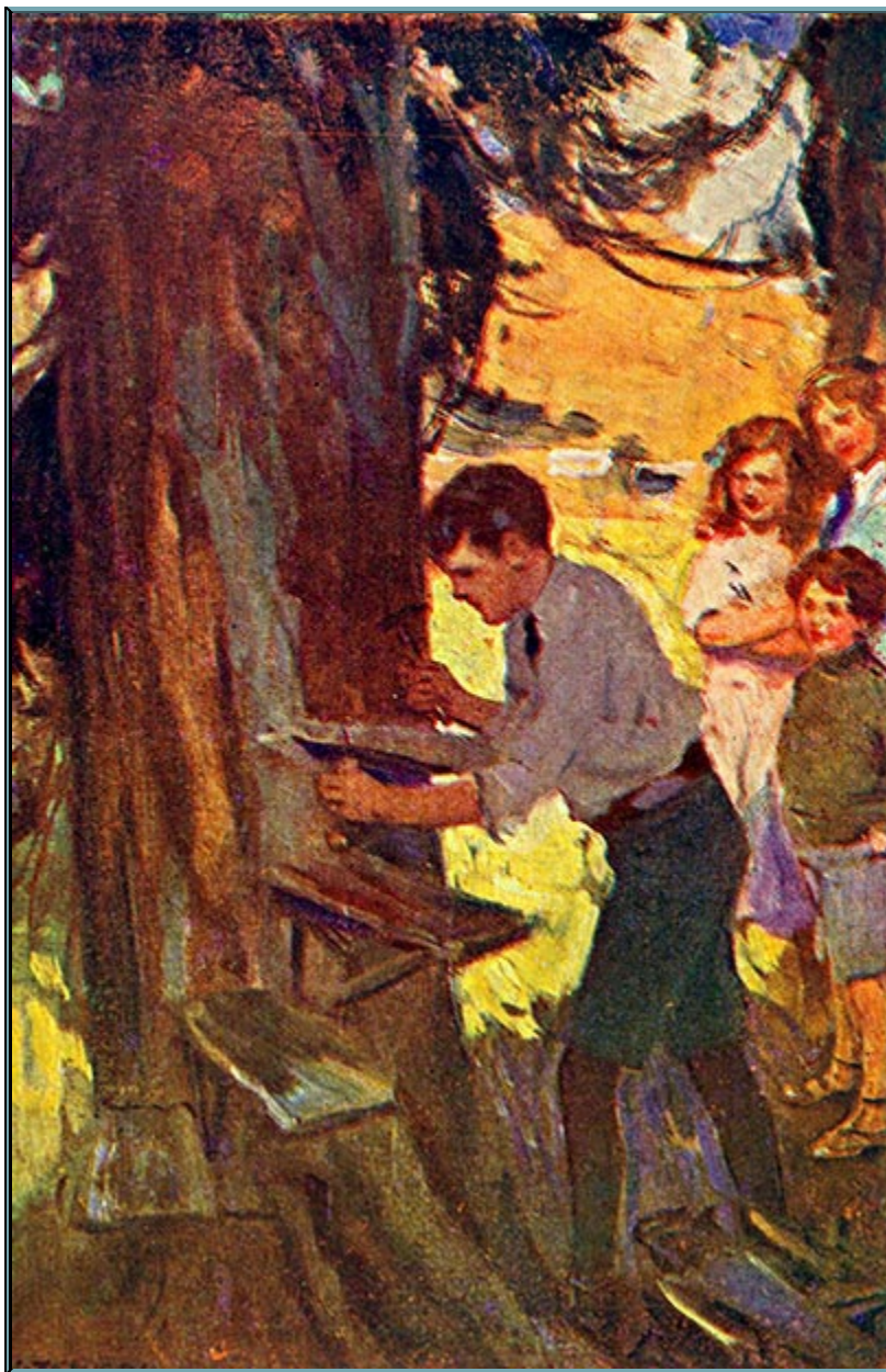
"HE FIRST SET TO WORK TO MAKE A SPIRAL STAIRCASE UP THE TREE."

Naturally Sky Cottage, like Rome, was not built in a day, and though Archie worked at it pretty constantly, it was November before the roof was on and he considered the building complete. The question of decorations was much discussed, for while Father suggested hanging the walls with sacking, and Lilian voted for garlanding them with wild flowers, both ideas were rejected, the one as too prosaic and the other as not sufficiently durable, and it was not until Peggy conceived the brilliant thought of lining their dwelling with moss that a satisfactory solution was arrived at.