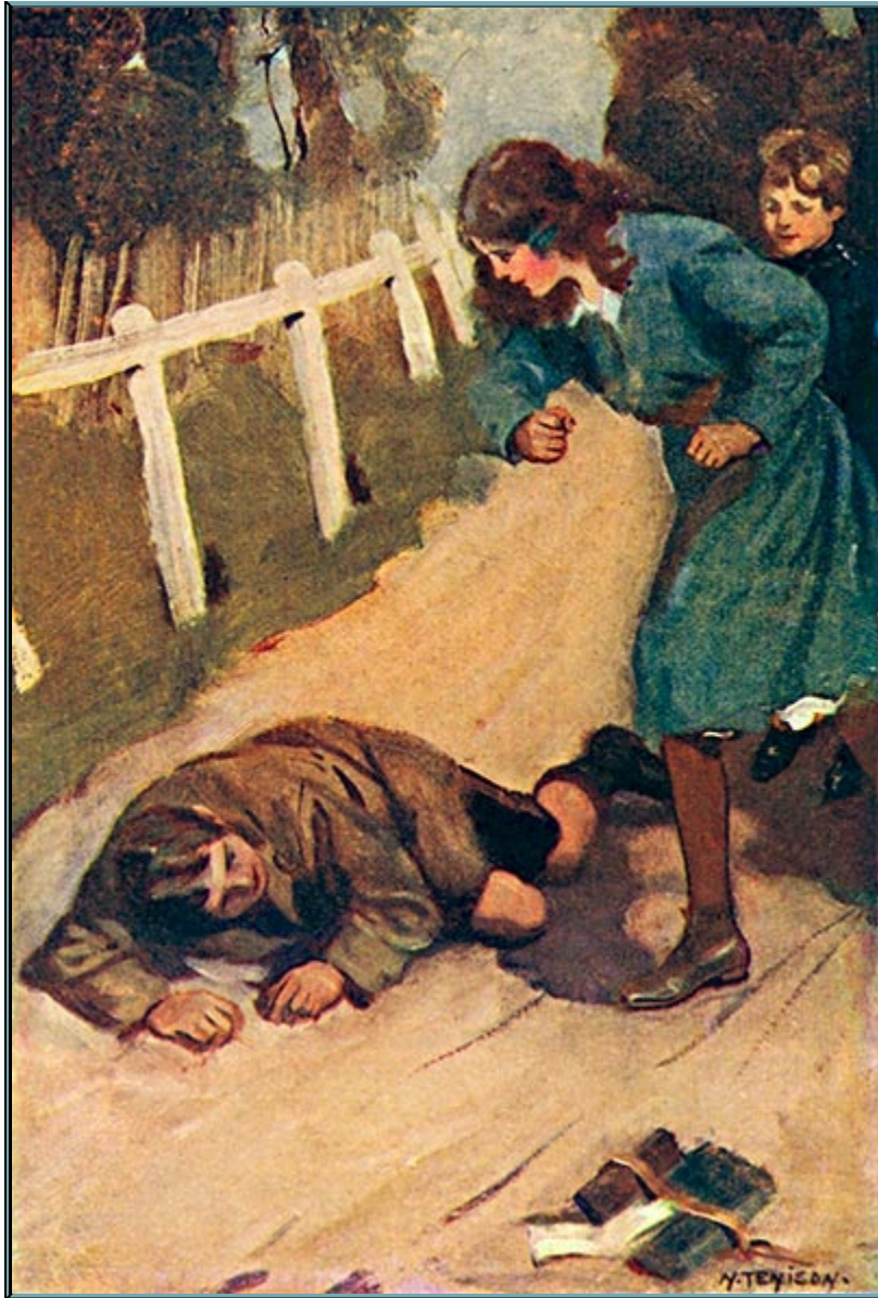
"IF YOU BREAK YOUR WORD, I'LL LET ALL WARFORD KNOW THAT YOU'VE BEEN KNOCKED DOWN AND THRASHED BY A GIRL."

'Here,' she cried indignantly, 'you Jones! Just stop that, will you?'