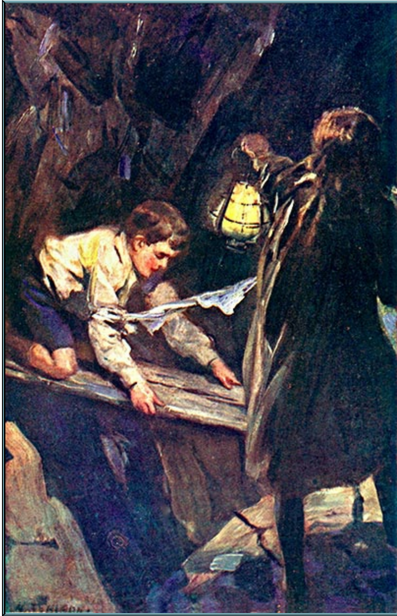
"BOBBY ACCOMPLISHED THE CROSSING IN SAFETY."

'We shall have to go back, and chance the river going down when it's light,' faltered Peggy.