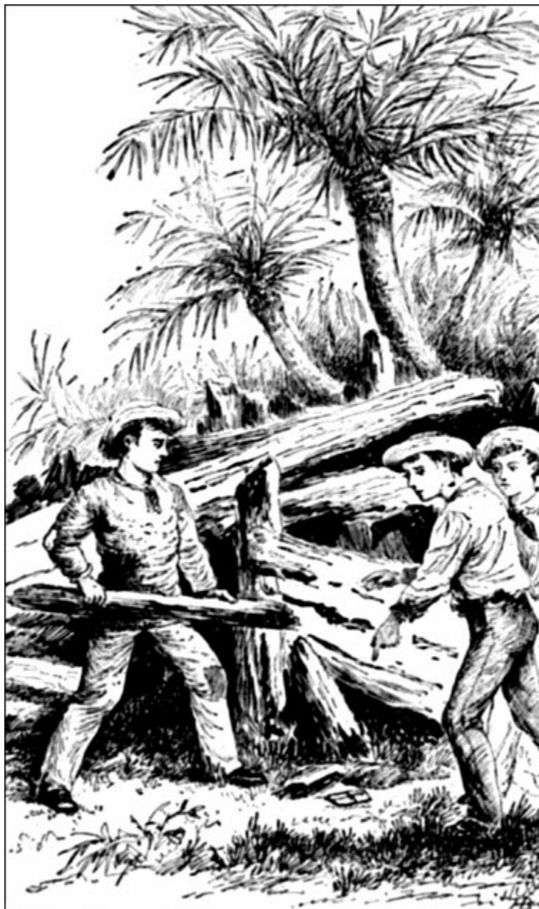
Harry sprung forward with a shout as he pointed to a small dark object.— (See page 155 .)

It was destined, however, that they should not penetrate very far into the interior of the island. Walter had led the party little more than a quarter of a mile when he halted in front of a veritable hut in the midst of a palmetto thicket.