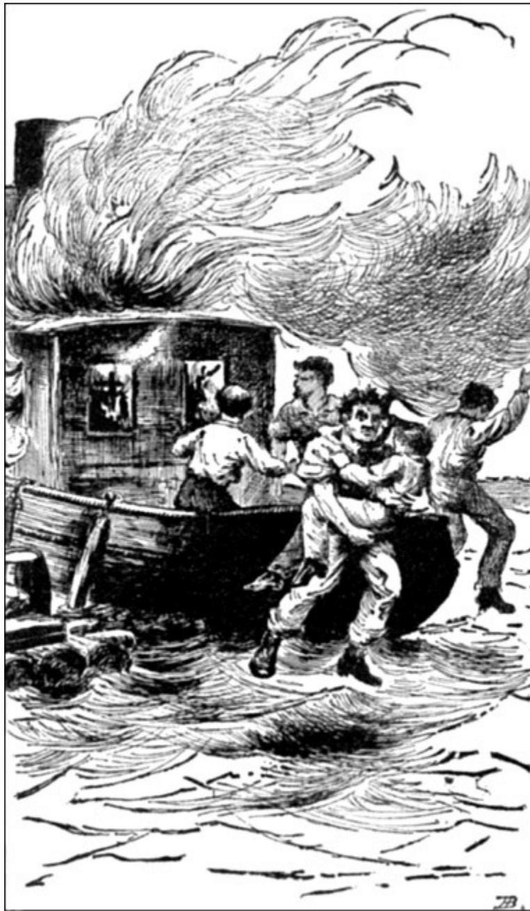
The engineer seized Walter by the waist and leaped overboard.-- See page 234.